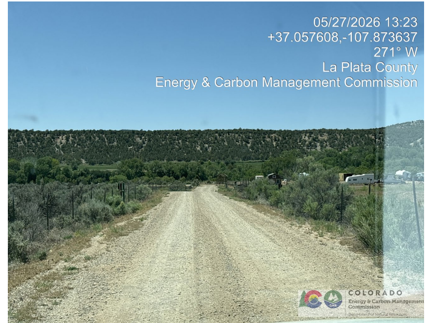
4. Access road from highway 550 looking west towards location.