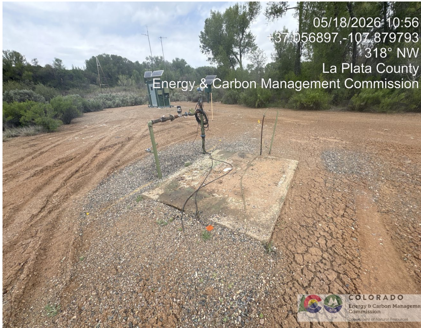
11. Concrete pad at former separator location, but flow line on left remains in use. Cut-off line on right. Newer meter run shed in background.