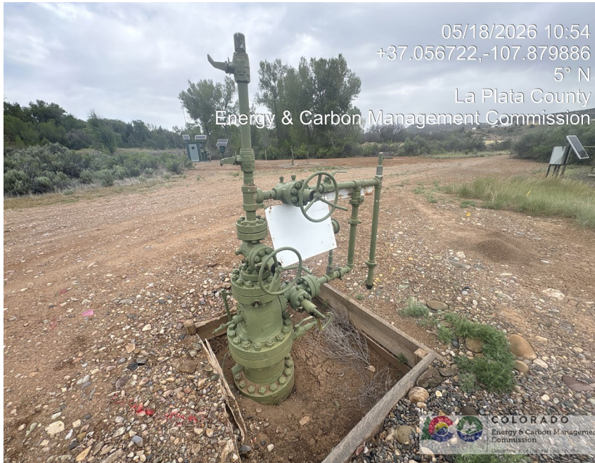
7. Back view of wellhead looking north.