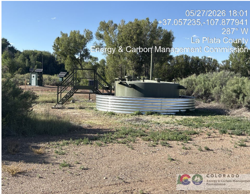
15. Location overview looking west showing new produced water tank and meter run. Note undesirable vegetation growing around tank.