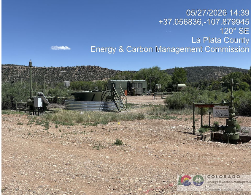
17. Location overview looking southeast showing wellhead separator and produced water tank.