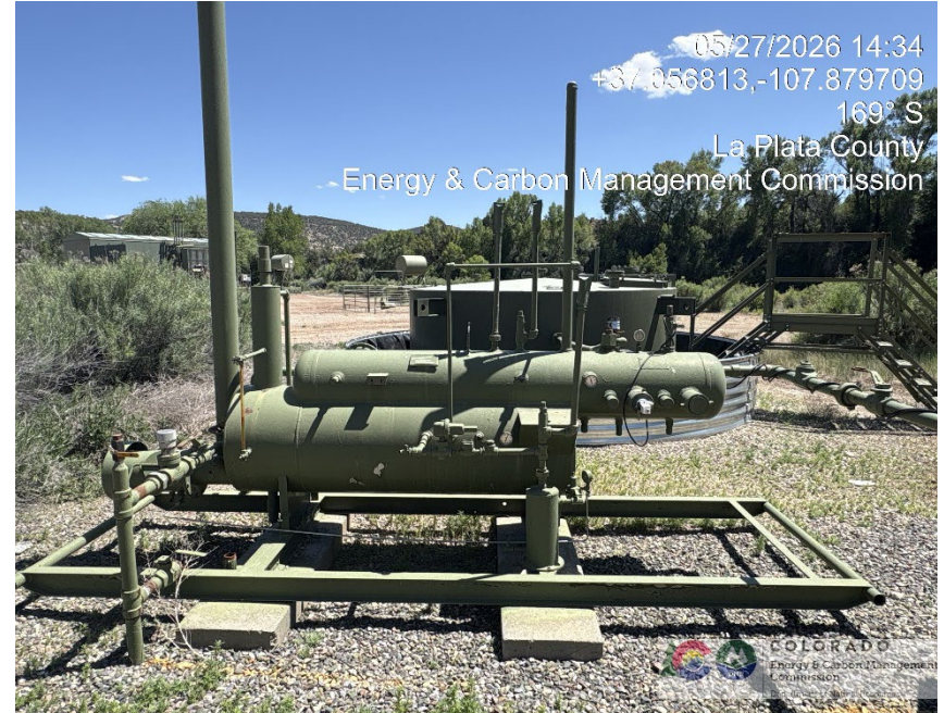
18. Skid mounted horizontal separator rests on concrete footers, but does not appear to be anchored to footing.