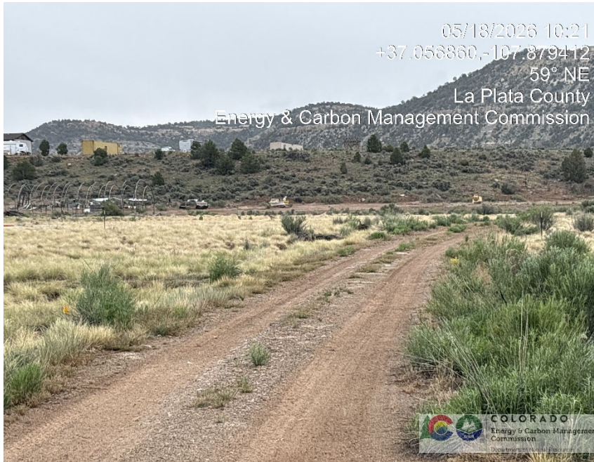
3. Access road from site looking NE towards highway 550.