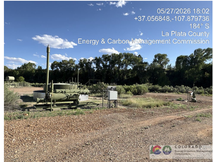
16. Location overview looking south, showing horizontal heated separator, produced water tank, electrical control panel, and wellhead. Weeds and dead vegetative debris near separator.