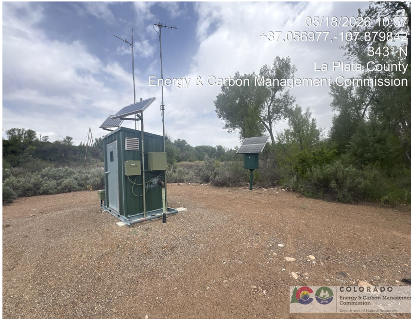
13. Meter run shed with solar telemetry, appears to be recently constructed. Separate solar telemetry with electric service panel.