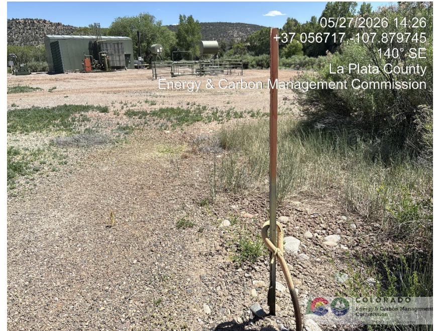
8. One of four marked rig anchors.