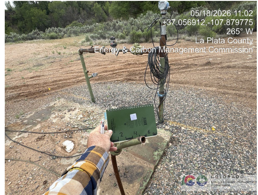
12. 1" Unmarked riser, open at one end with no valve or cap, appears abandoned. Excess cable wrapped around meter riser.