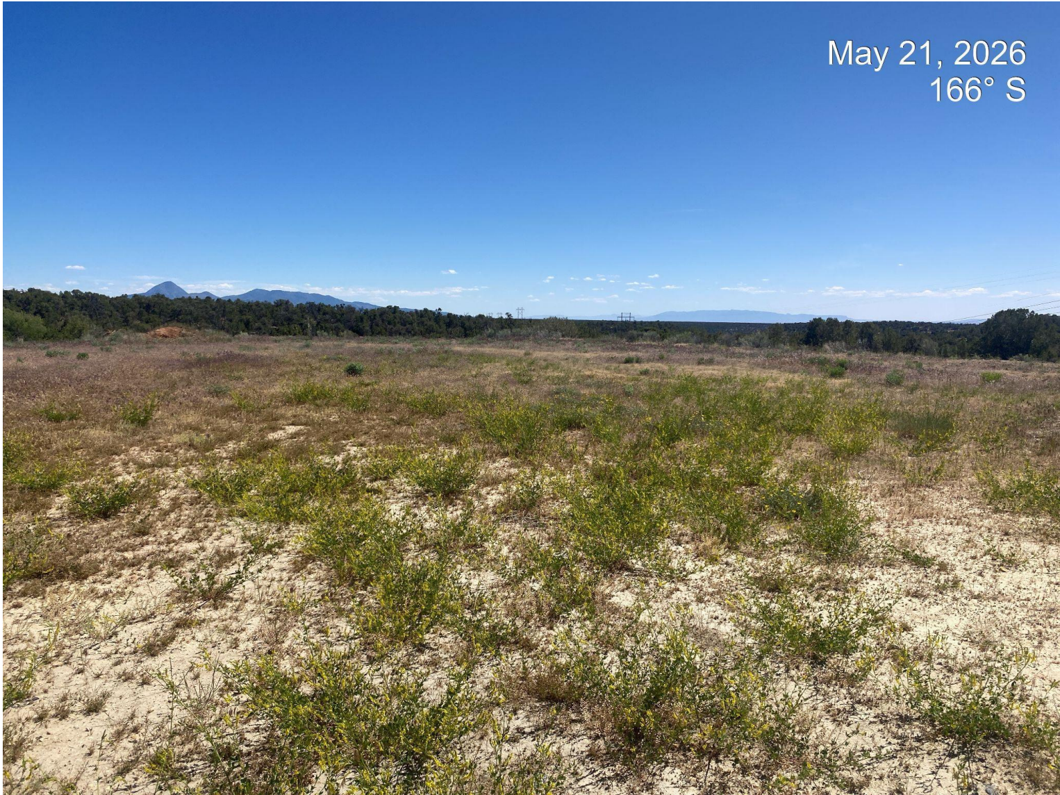
Photo 4. Cardinal photo taken from the center of the project area facing south.