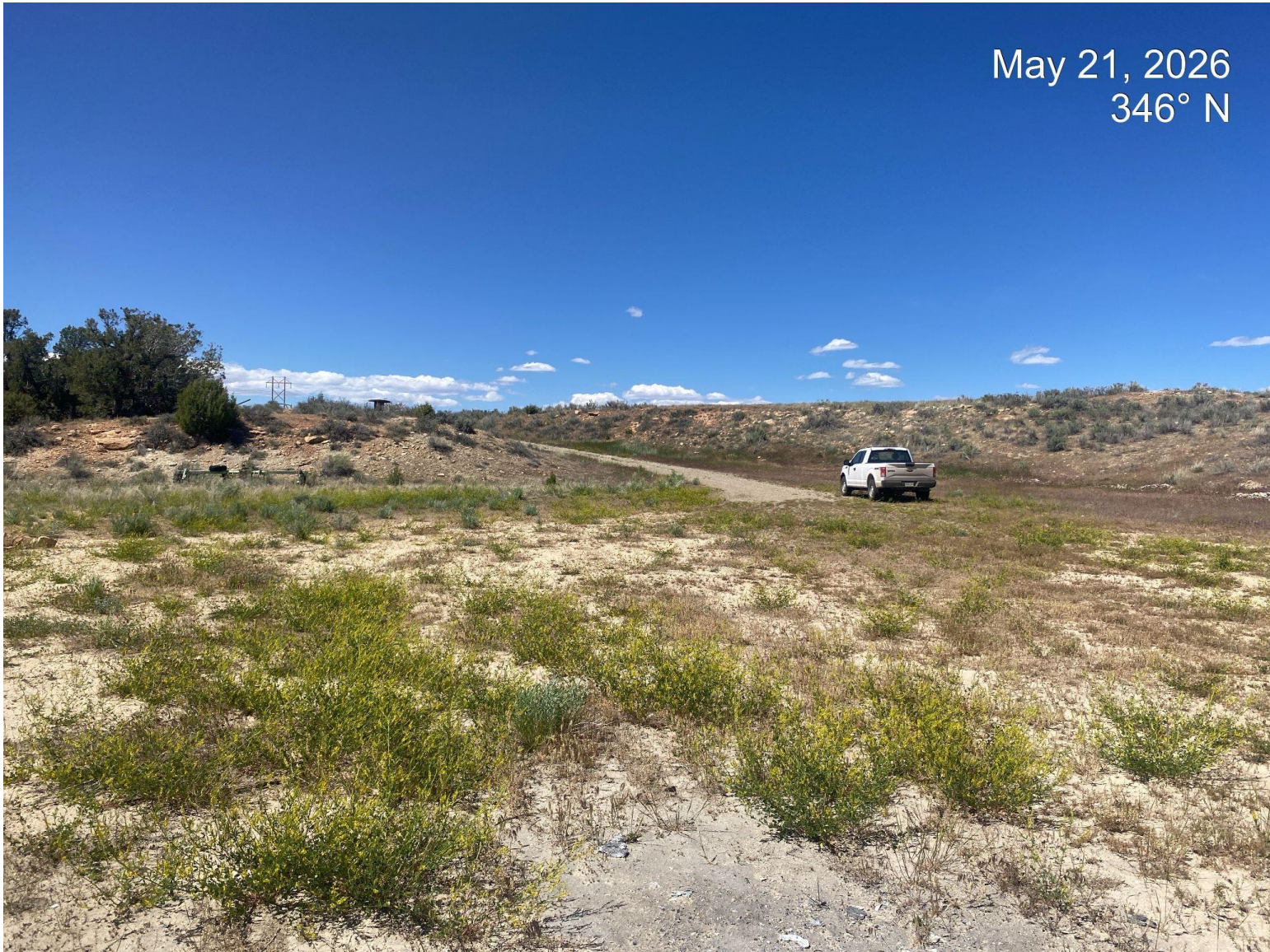
Photo 3. Cardinal photo taken from the center of the project area facing north.