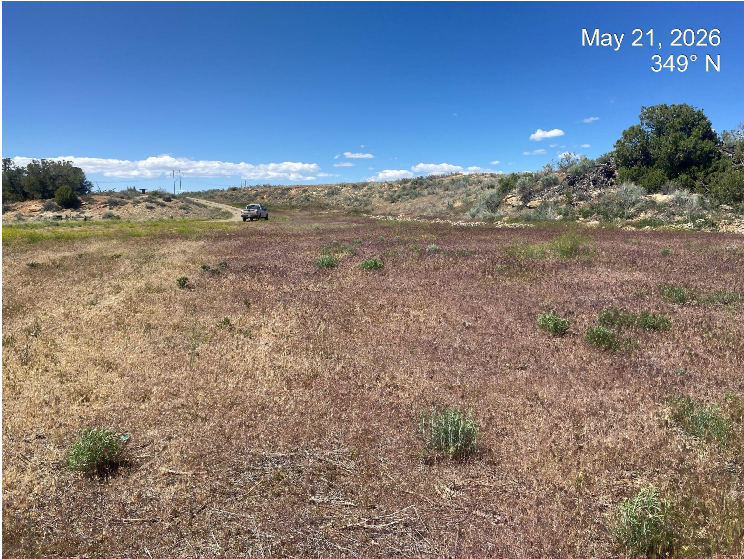
Photo 6. Large patch of Cheatgrass observed on the eastern edge of the project area.