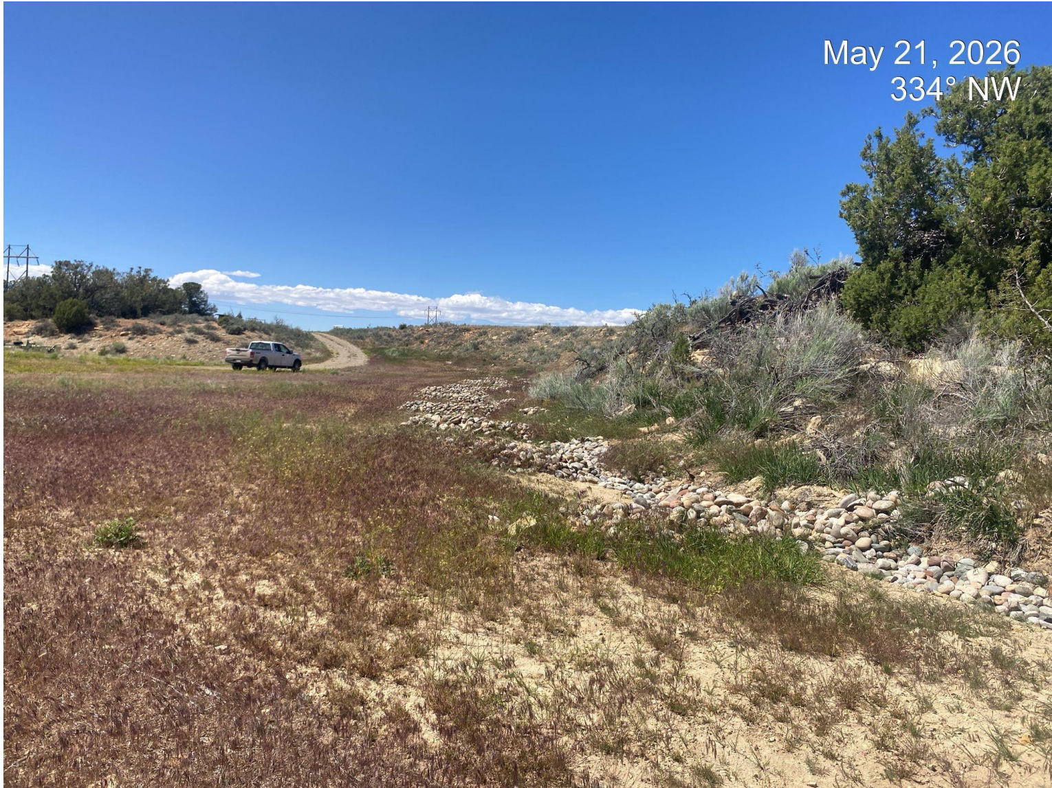
Photo 7. Tamarisk trees have been removed from the project area.