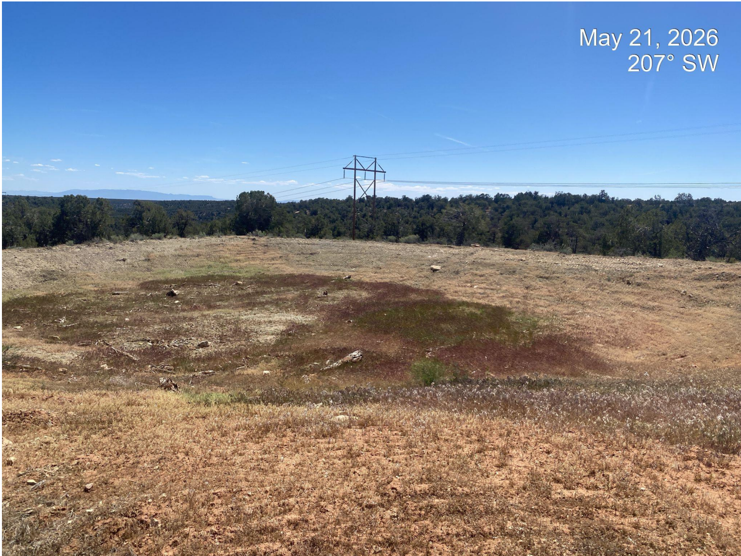
Photo 5. View of pit/drainage area in the SW corner of the project area. Large patches of Cheatgrass observed in this area.