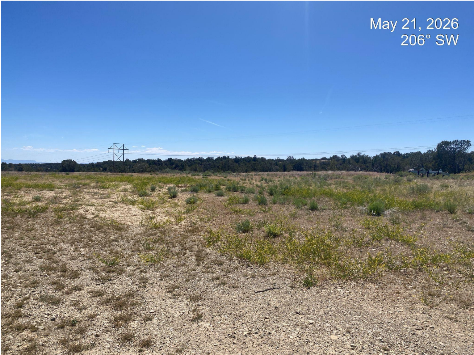
Photo 2. View of the project area taken from the access point facing center.