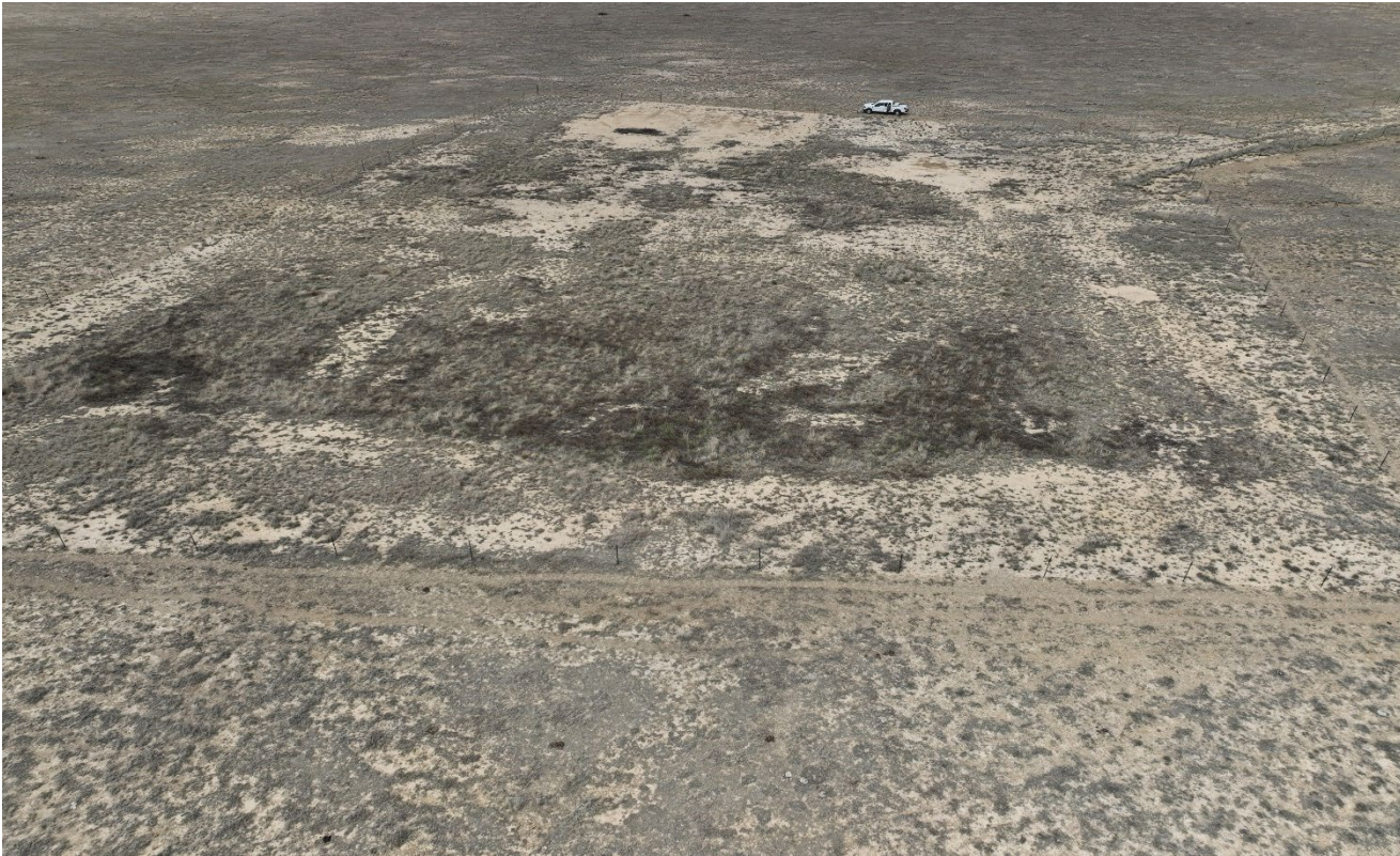
Photo 4. Drone aerial photo facing northwest toward the location.