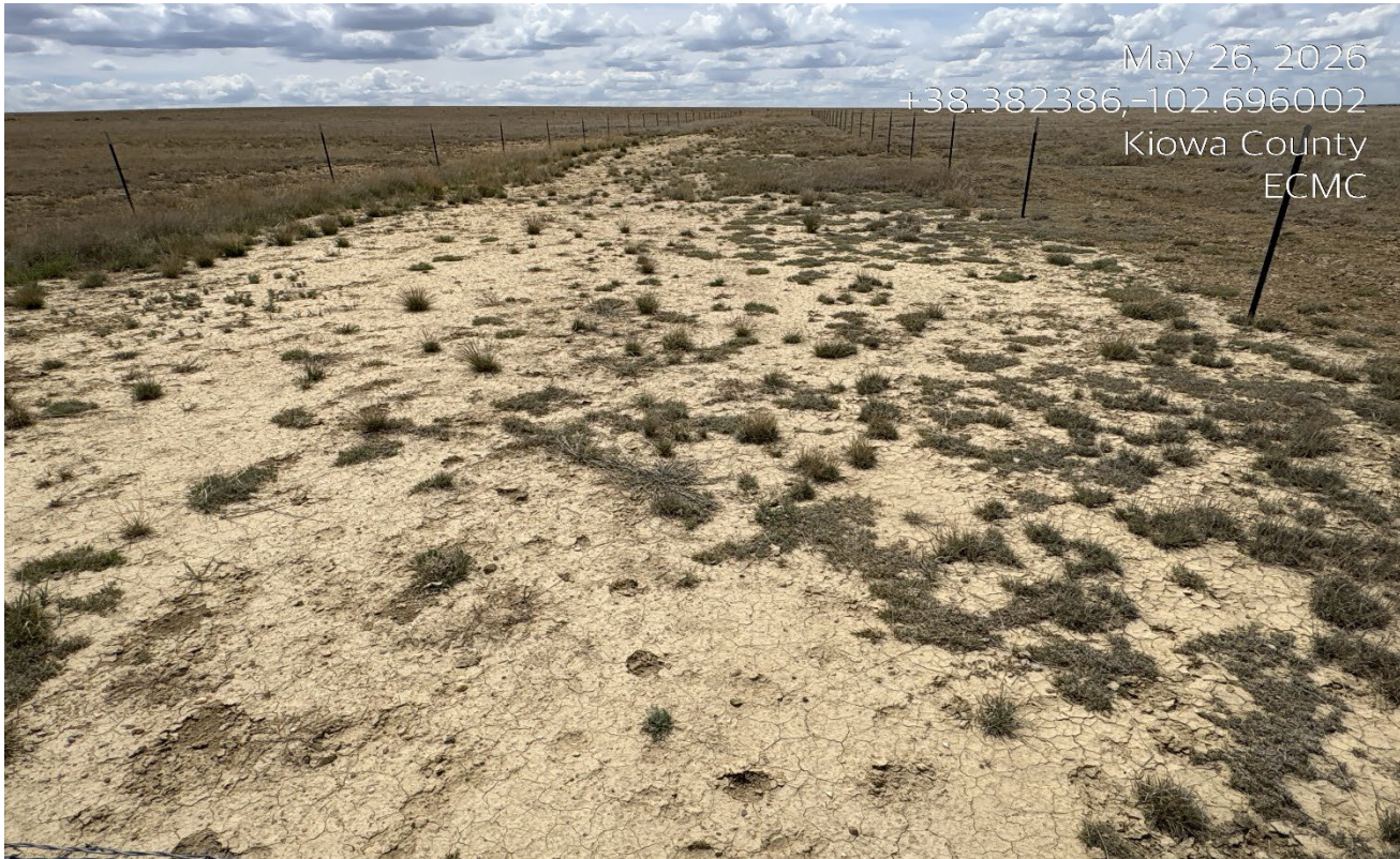
Photo 1. Facing south along the former access road. This area is fenced and vegetation is sparse in areas.