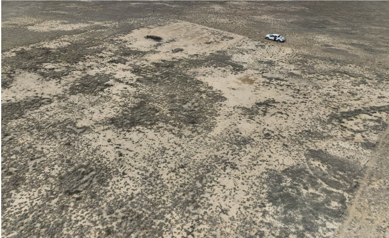
Photo 5. Facing northwest overlooking the location.