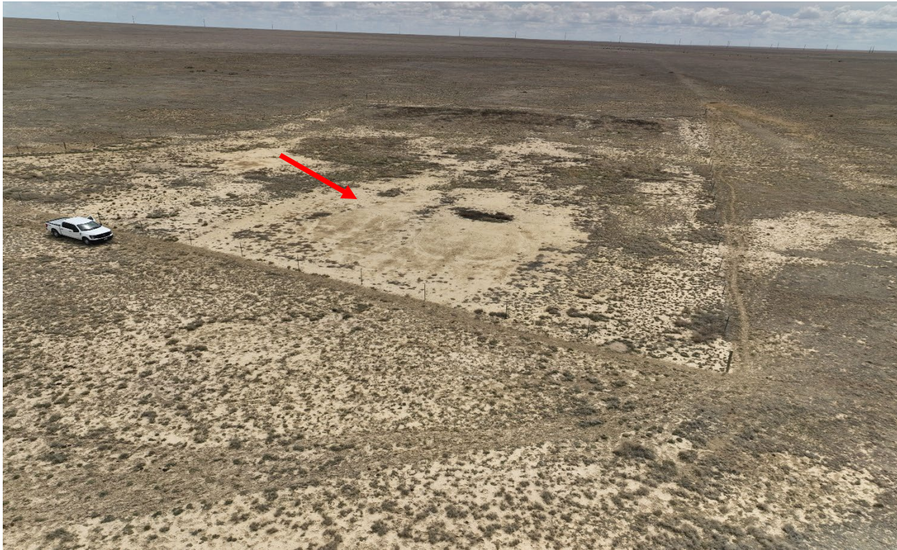
Photo 3. Drone aerial photo facing southeast toward the location. The area at red arrow has not established vegetation.