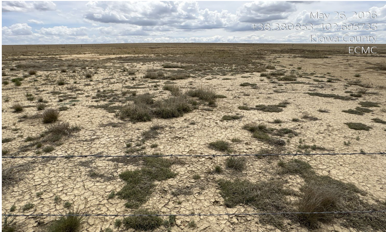
Photo 2. Facing southeast toward the location.