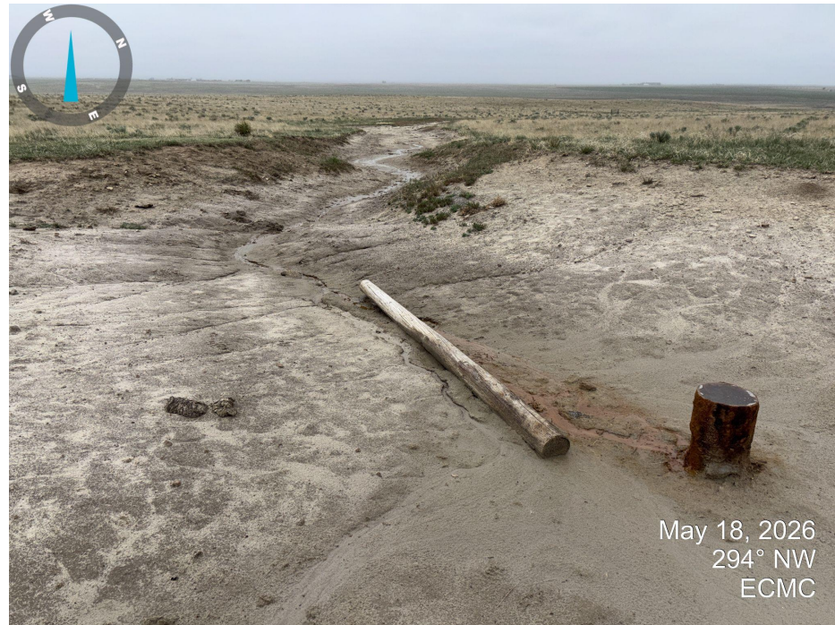
Photo 2. Looking west past the wellhead. Clear fluid was spilling out of the wellhead. Bubbles were observed in the fluid in the wellhead.