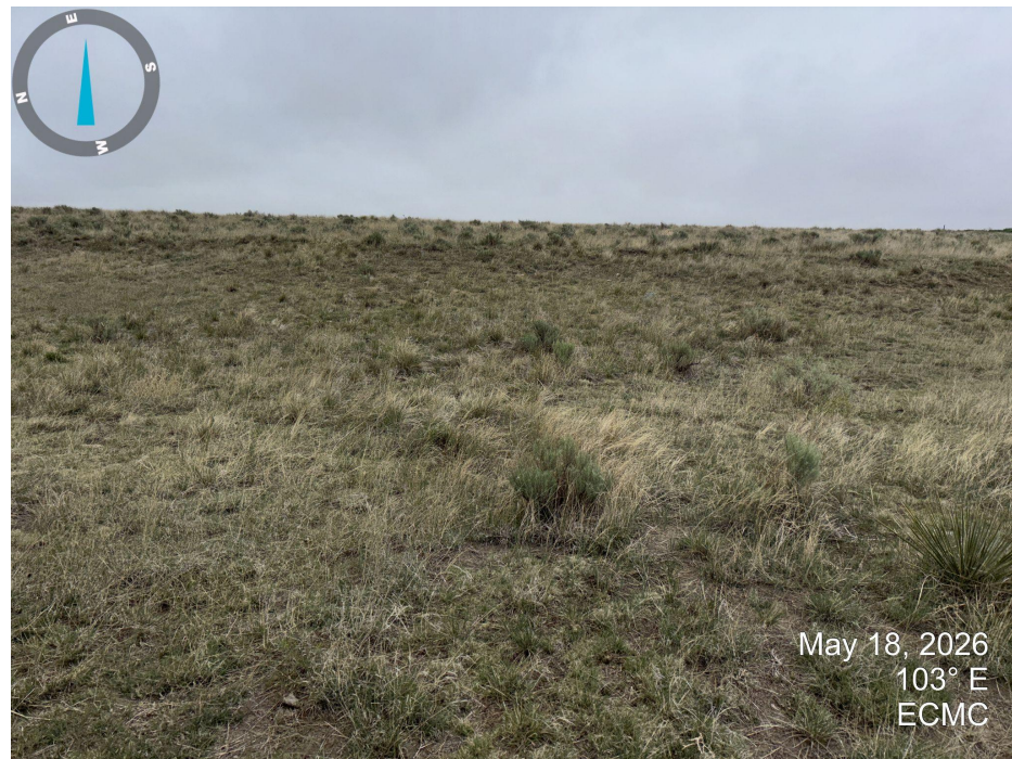
Photo 4. Looking east from center of the location. See photo 3 comments.