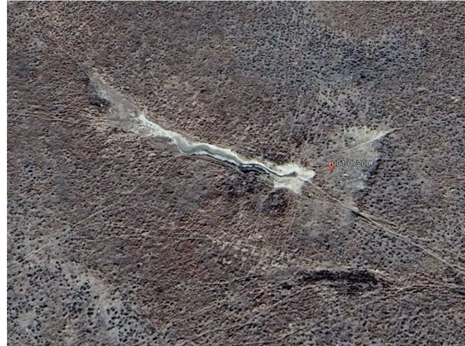
Photo 8. Google earth aerial imagery taken 11/2023. The area of bare soil around the wellhead is approximately 50 ft. Visibly impacted soil and vegetation extends downgradient approximately 400ft.