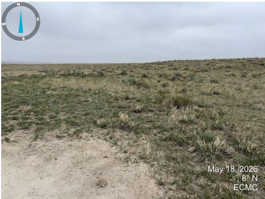
Photo 3. Looking north from the center of the location. The location was not recontoured. Except for the area around and downgradient of the wellhead the location is covered with perennial vegetation.