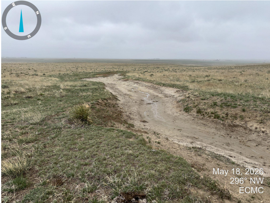
Photo 7. photo taken west of the wellbore. Visibly impacted soils extend approximately 400 ft from the wellhead.