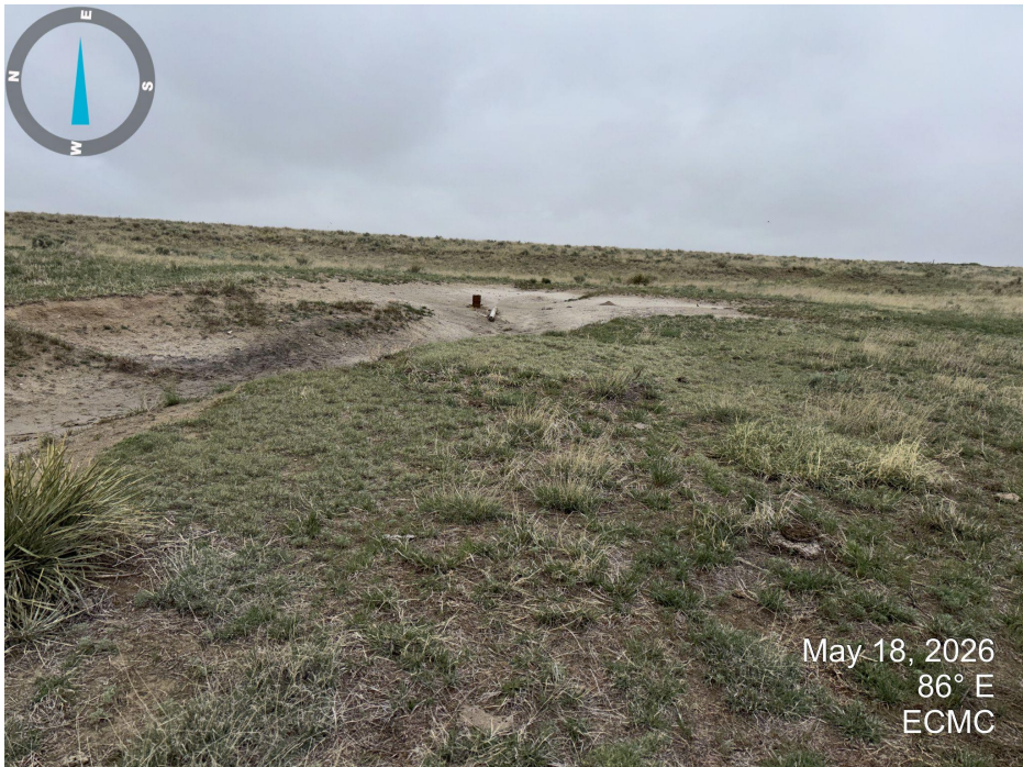
Photo 1. Looking east across the location. The well casing is exposed. the soil around the wellhead is bare and has been eroded approximately 3-4 feet below grade. Clear fluid was present in the channel.