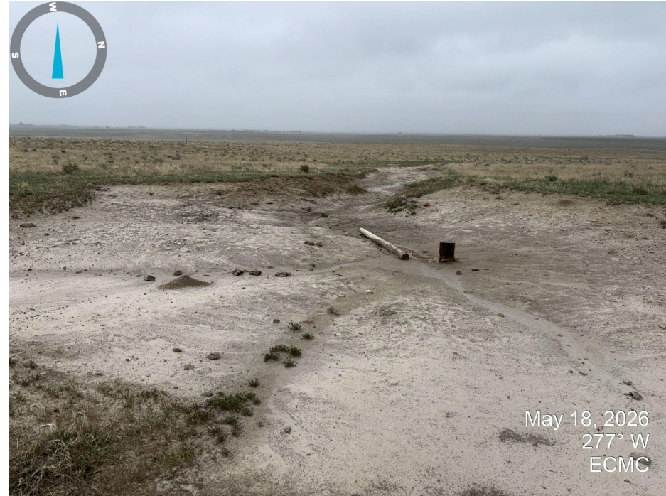
Photo 6. Looking west from center of the location. See photo 3 comments.