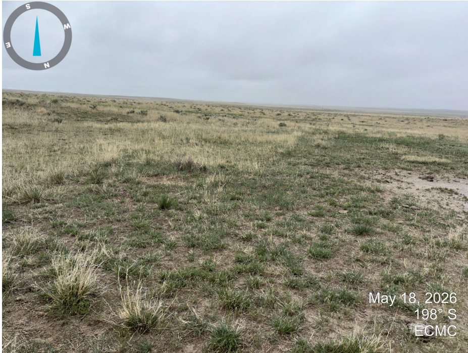
Photo 5. Looking south from center of the location. See photo 3 comments.