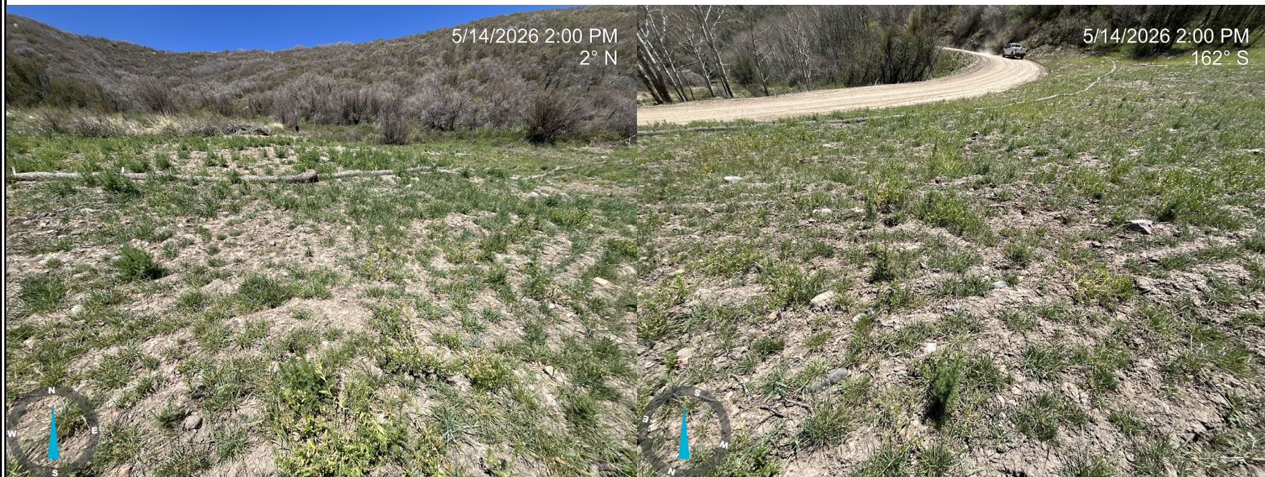
Photo 1: Photos showing an overview of the location looking north and south, respectively. Weedy mustards and pepperweeds are present throughout.