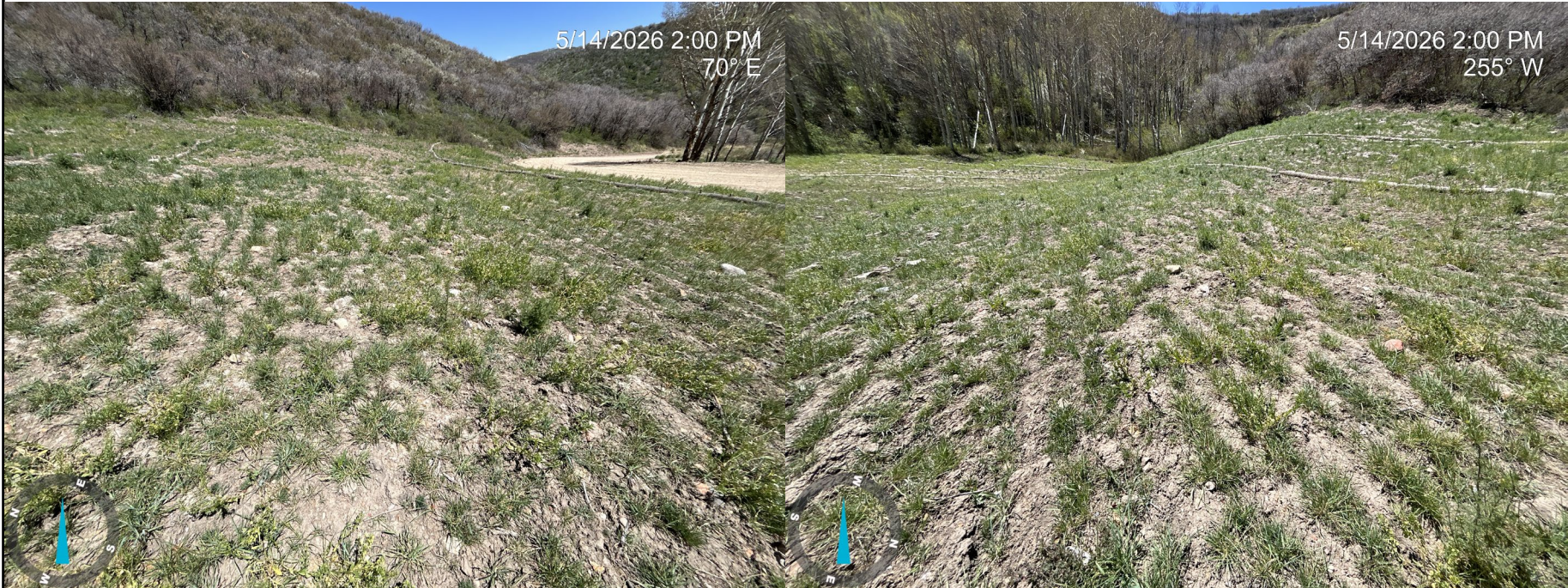
Photo 2: Photos showing an overview of the location looking east and west, respectively. Weedy mustards and pepperweeds are present throughout.