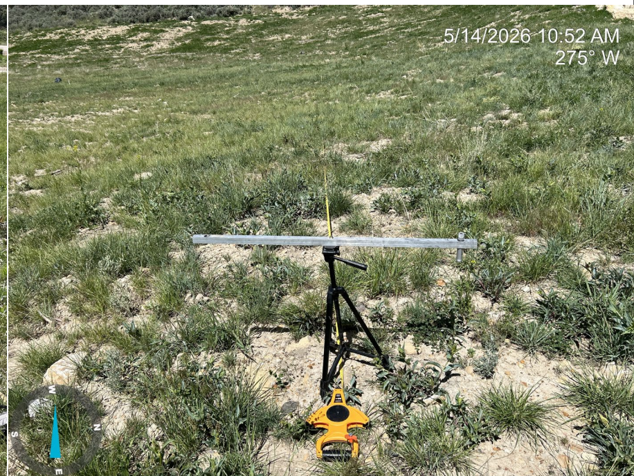
Photo 7: Photos showing the beginning and end of the disturbed area vegetation transect, respectively.