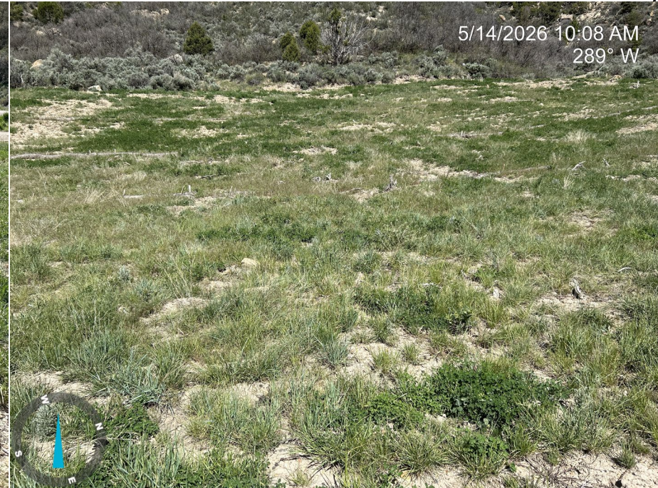
Photo 2: Photos showing an overview of the location looking east and west, respectively.