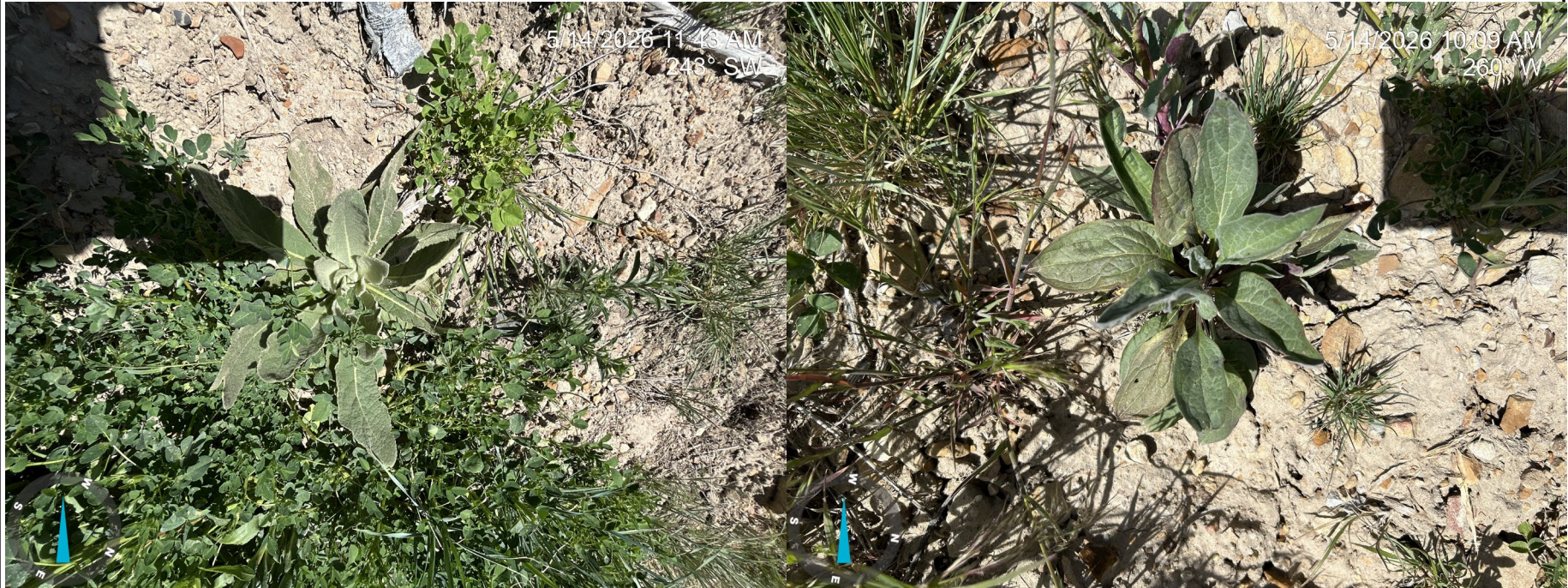
Photo 5: Photos showing an example of common mullein and houndstongue rosettes that are present in tertiary amounts throughout the location.