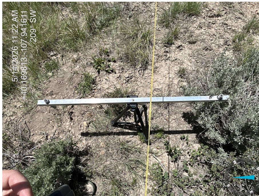
Photo 10: Photos showing the middle point of the reference area vegetation transect.