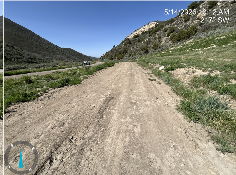
Photo 11: Photos showing the unreclaimed access road to the south of the location.