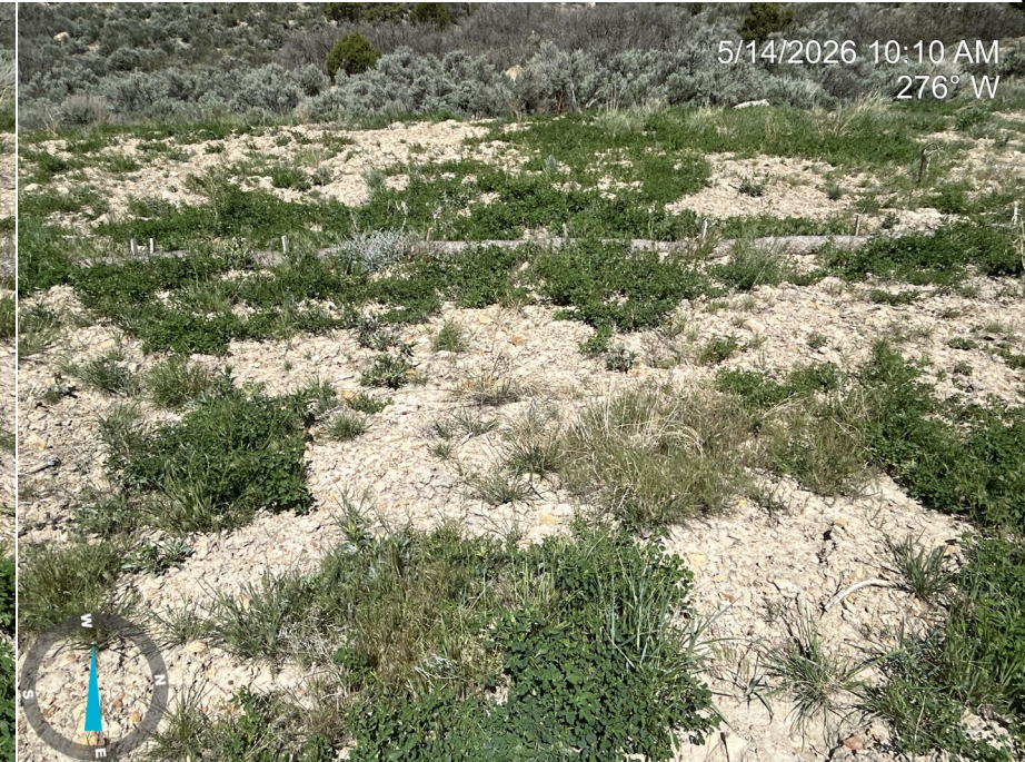
Photo 6: Photos showing that some portions of the location have not yet achieved uniformity.