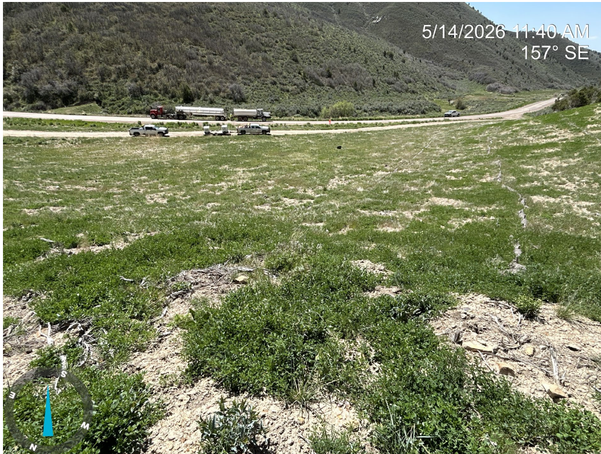
Photo 13: Photos showing a general overview of the location looking southeast.