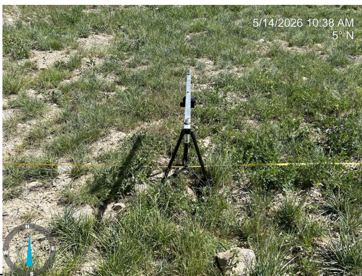
Photo 8: Photos showing the middle point of the disturbed area vegetation transect.