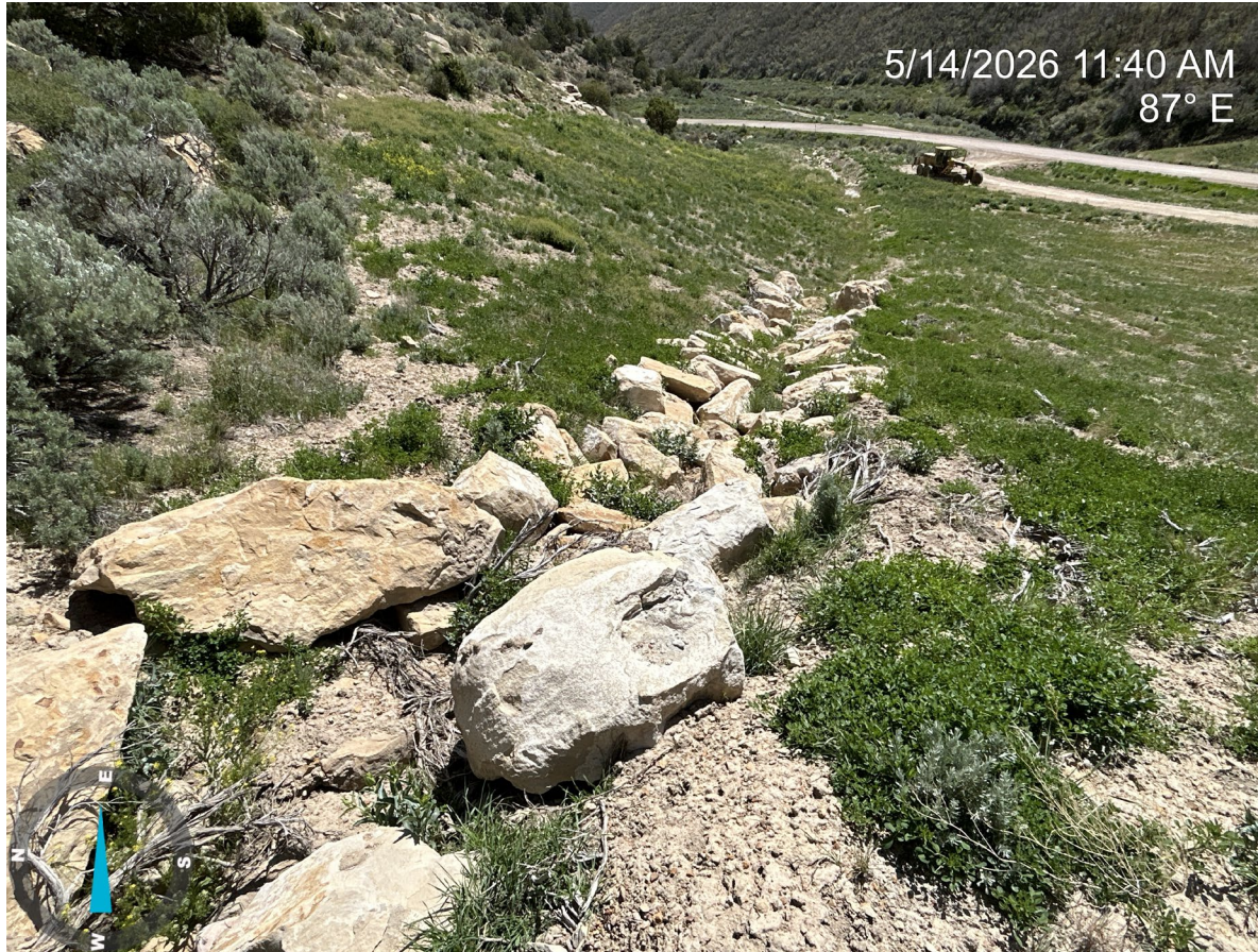
Photo 12: Photo showing a rock-armoured stormwater channel at the location; no stormwater issues observed during inspection.