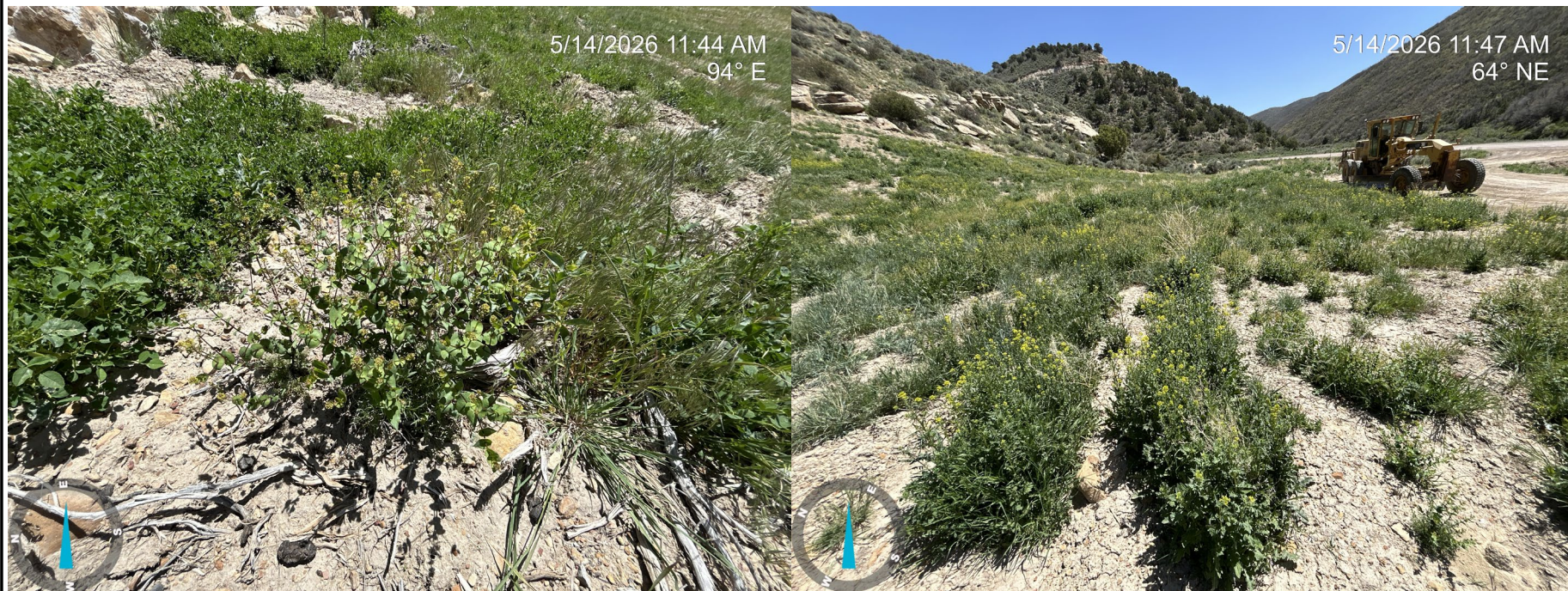
Photo 4: Photos showing an example of claspings pepperweed and a portion of the location that is dominated by weedy annual mustards, both on the eastern edge of the location.