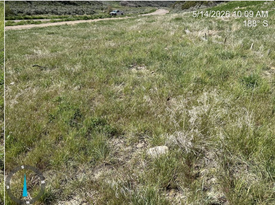
Photo 3: Photos showing an example of purple mustard and cheatgrass. Cheatgrass appears to dominate the western portion of the location.