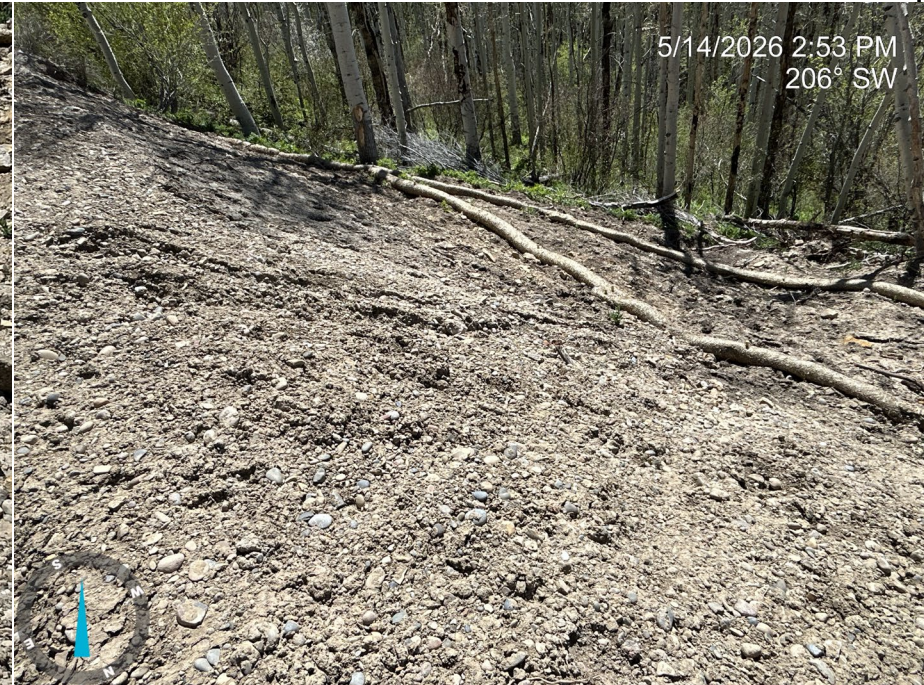
Photo 4: Photos showing that rilling and erosion is occurring on some portions of the location. Stormwater maintenance at the location is required.