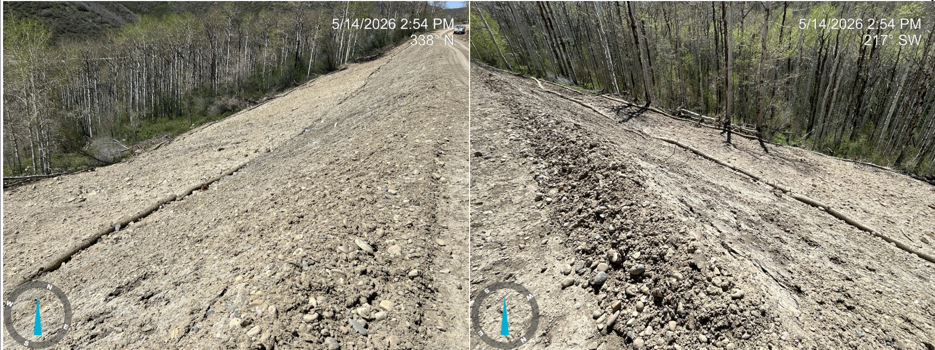
Photo 2: Photos showing the lower portion of the location. An access road bisects the location. Little to no vegetation has yet established at the location.