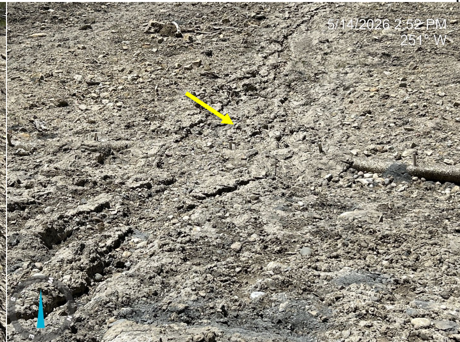
Photo 3: Photos showing an example of wattles at the location; some are in disrepair or have been overtopped with sediment. Maintenance is required.