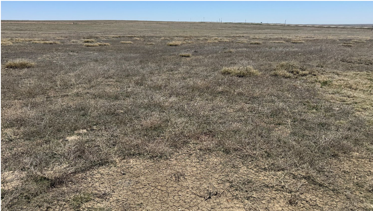
Photo 3. Center of the location facing south.