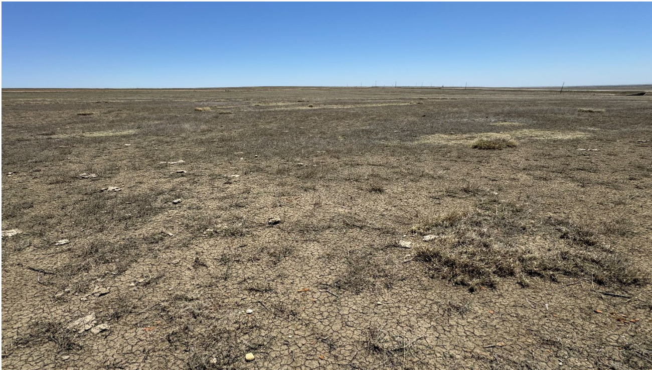
Photo 6. North side of the location facing south. The desirable vegetation has not established.