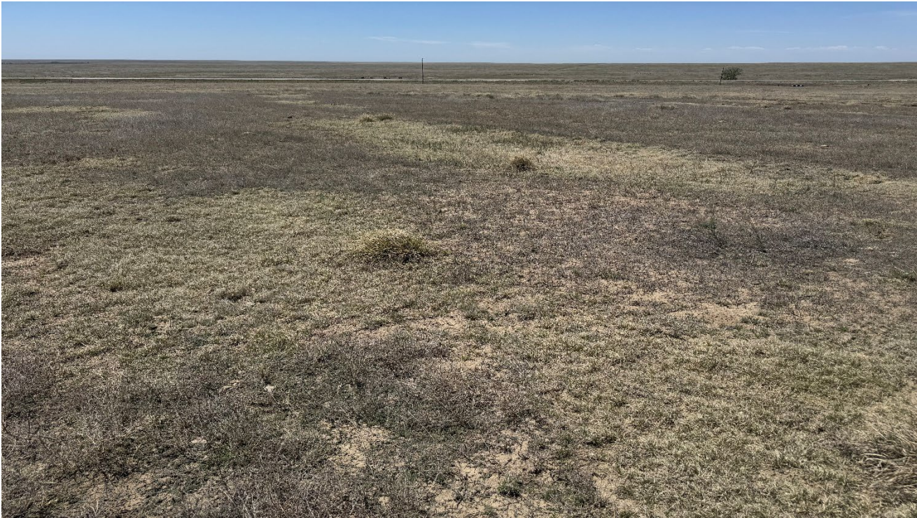
Photo 2. Center of the location facing west.