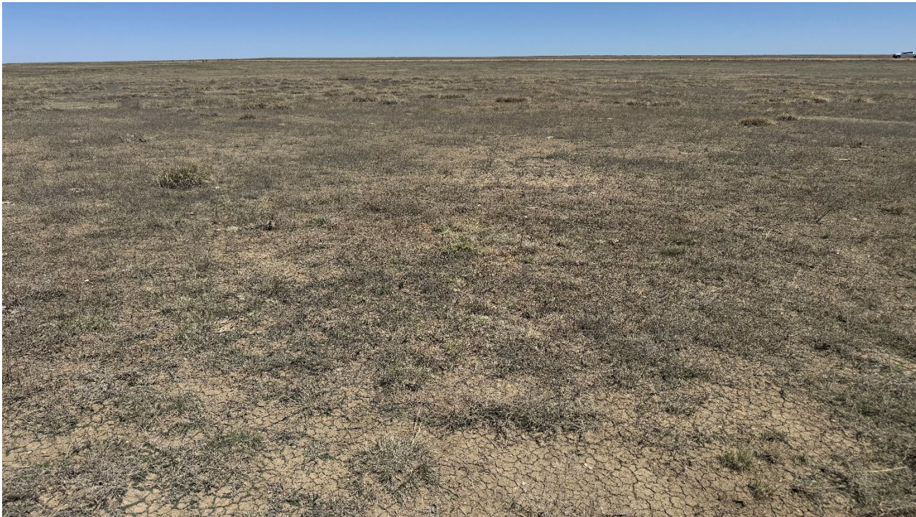
Photo 4. Center of the location facing east.