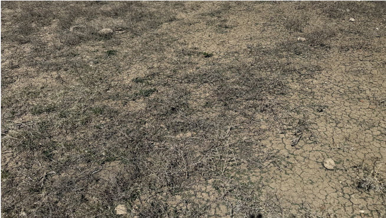
Photo 5. View of ground cover shows undesirable weeds emerging (Kochia) and bare soil.