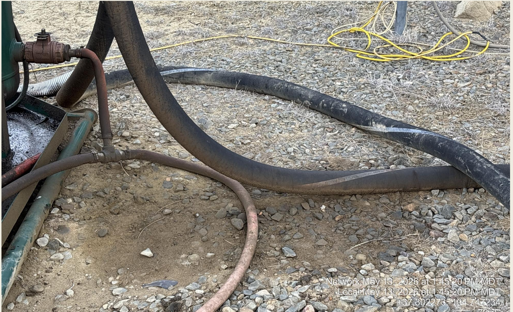
PHOTO 5: AREA OF IMPACTED SOIL NEAR COMPRESSOR SKID. Conduct maintenance on equipment, cleanup stained material and review self inspection processes. COMPLY WITH RULE 1002,(2).D. CA DATE 6/13/2026.