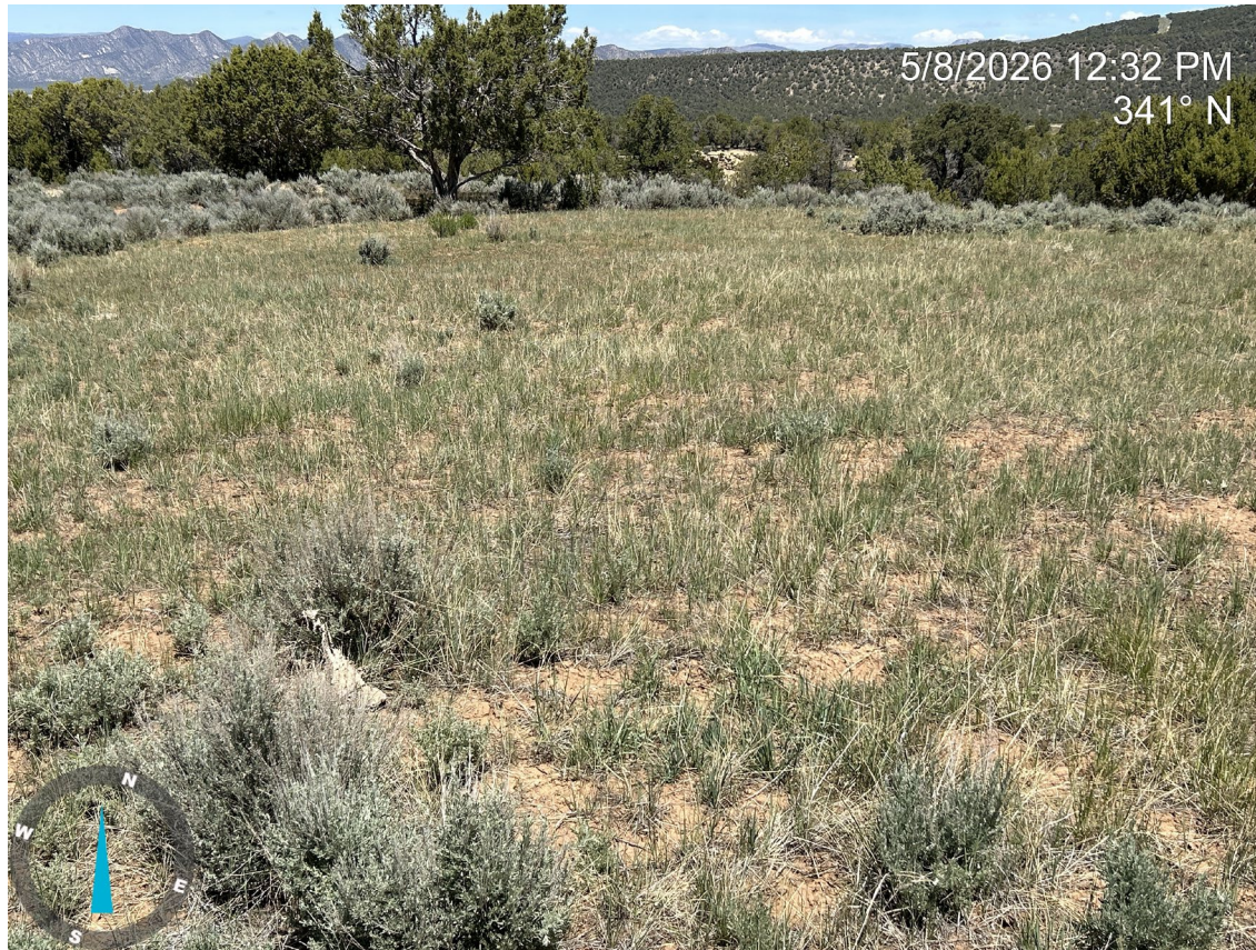
Photo 6: Photos showing the northern interim area. This portion of the interim area is composed of desirable, perennial and uniform vegetation and is progressing towards 1003 reclamation requirements.