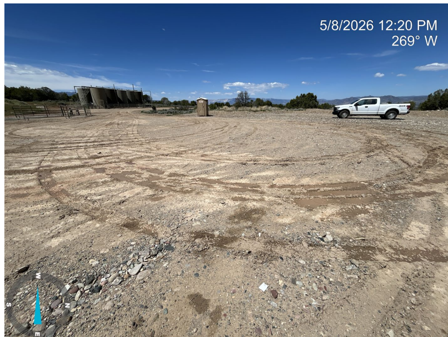
Photo 2: Photos showing an overview of the location looking east and west, respectively. Vehicle tracking is present throughout the working pad surface and requires maintenance pursuant to Rule 1002.f.