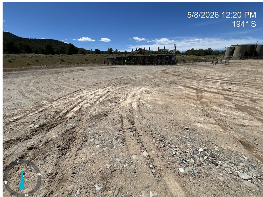
Photo 1: Photos showing an overview of the location looking north and south, respectively.