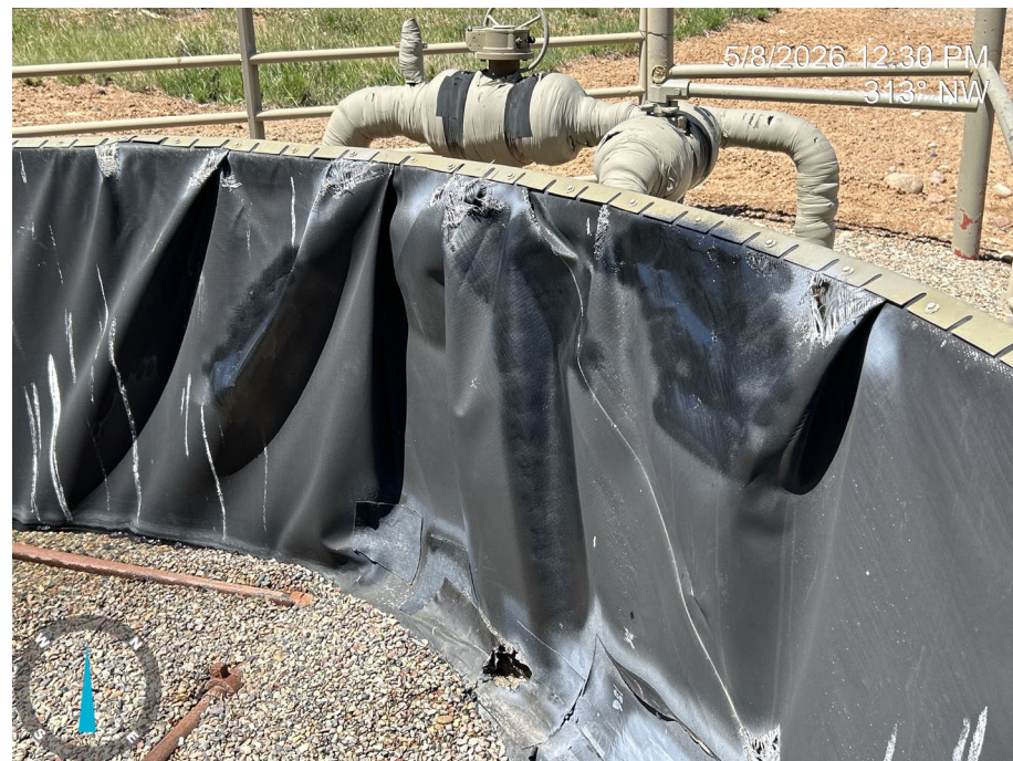
Photo 3: Photos showing examples of holes and tears that are present in the tank's secondary containment black geotextile liner. Maintenance/repair is required.