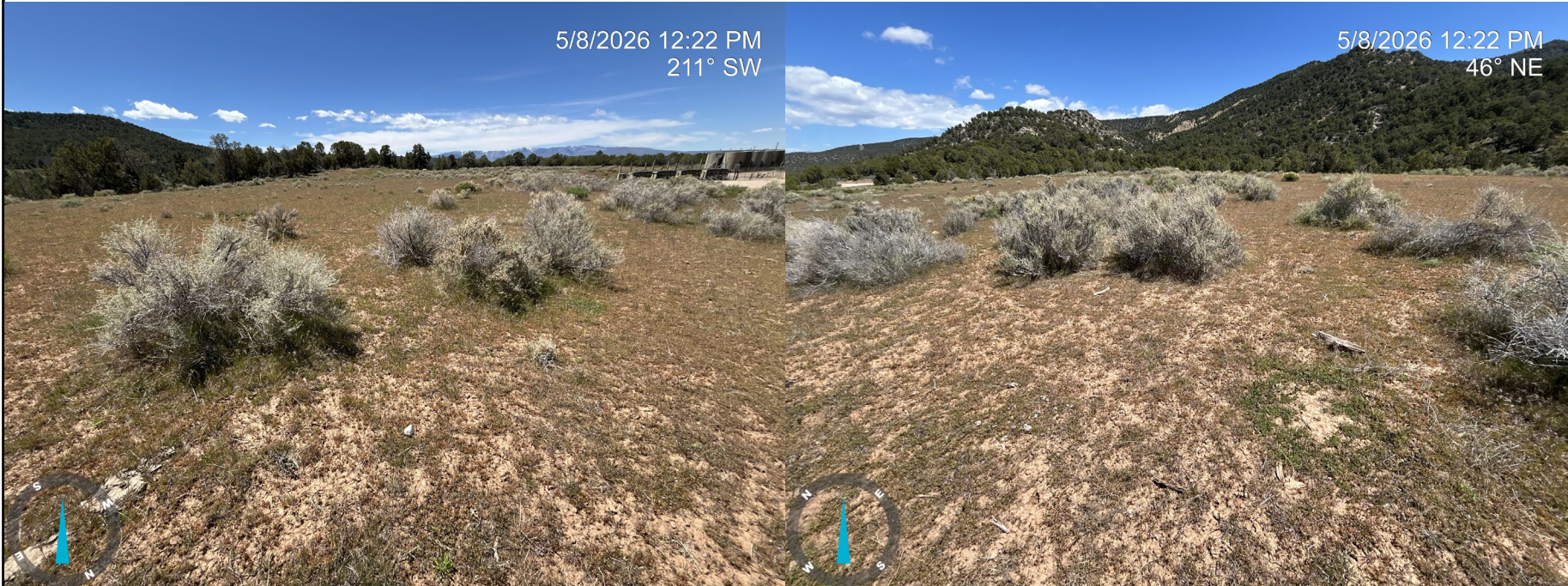
Photo 4: Photos showing an overview of the southern interim area; fourwing saltbush is present in secondary amounts; bulbous bluegrass and redstem fillaree, both List C noxious weeds, are dominant in the understory. Weed management is required.