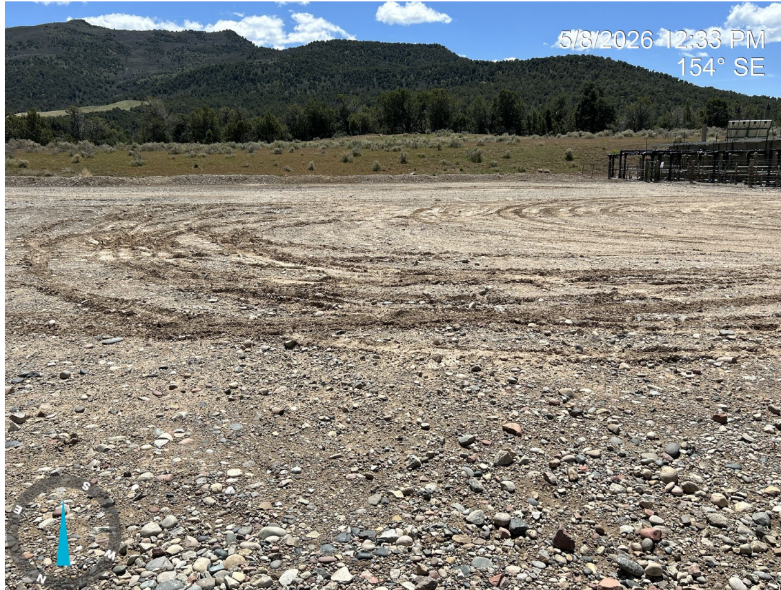
Photo 7: Vehicle rutting/tracking is present throughout the working pad surface and gravel appears sparse in some areas. Maintenance is required.