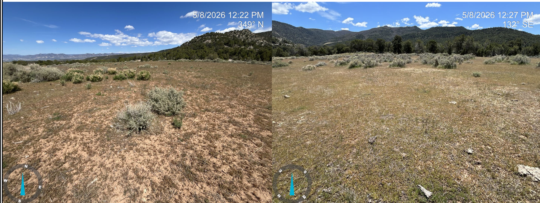
Photo 5: Photos showing an overview of the eastern interim area; fourwing saltbush is present in secondary amounts; bulbous bluegrass and redstem fillaree, both List C noxious weeds, are dominant in the understory. Weed management is required.