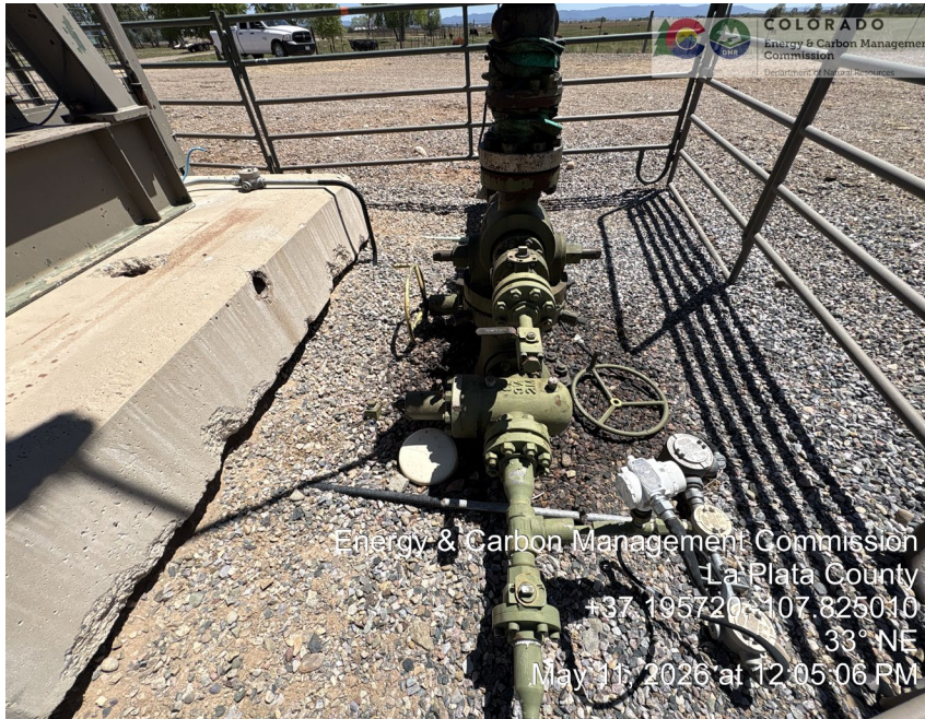
5. Wellhead. Oil staining visible on gravel surrounding wellhead. View looking E.