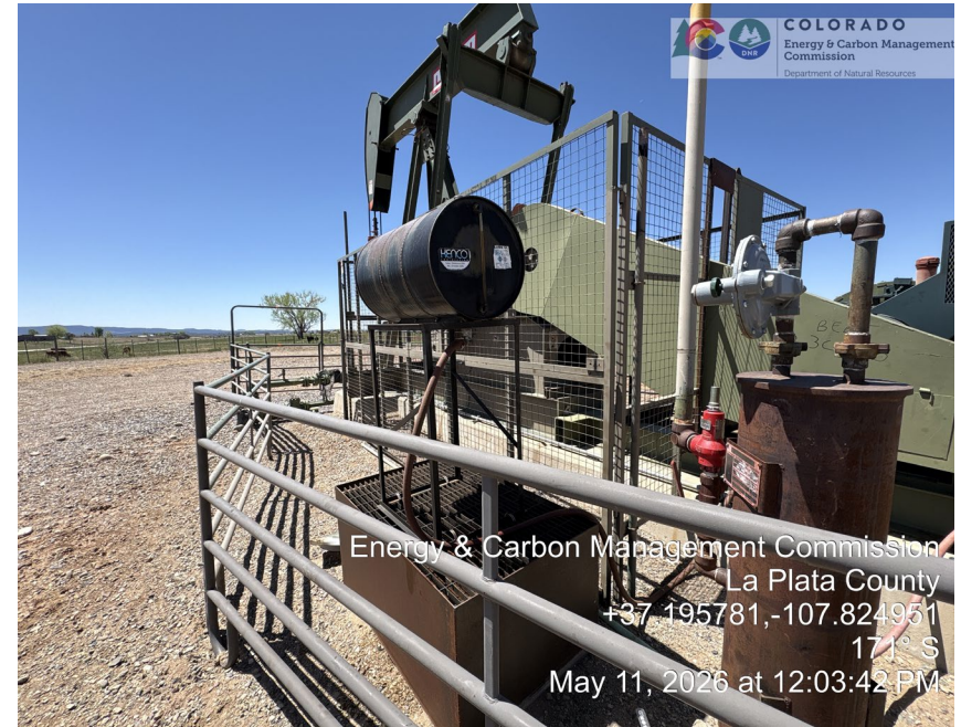
7. Wellhead, pump jack and prime mover.