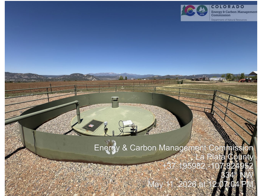
9. Solar telemetry for well controls. Muffler for prime mover on gravel.