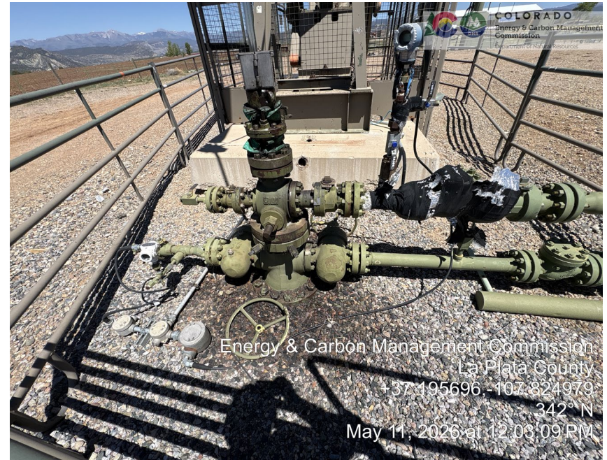
3. Wellhead and pumpjack. There is stained gravel near the wellhead.