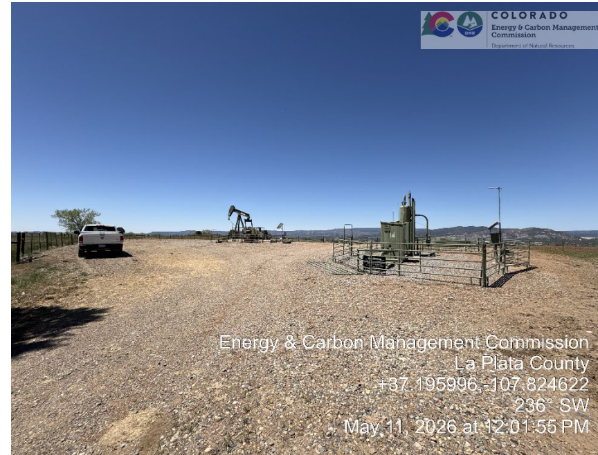
1. Well sign inside cattle panel fence by pad entrance by production equipment.