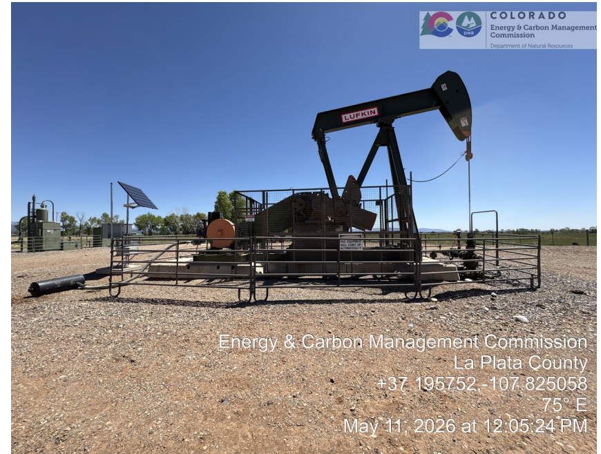
6. Wellhead and pumpjack with gas prime mover. Was operating during inspection. Cattle panel barrier and solar telemetry.