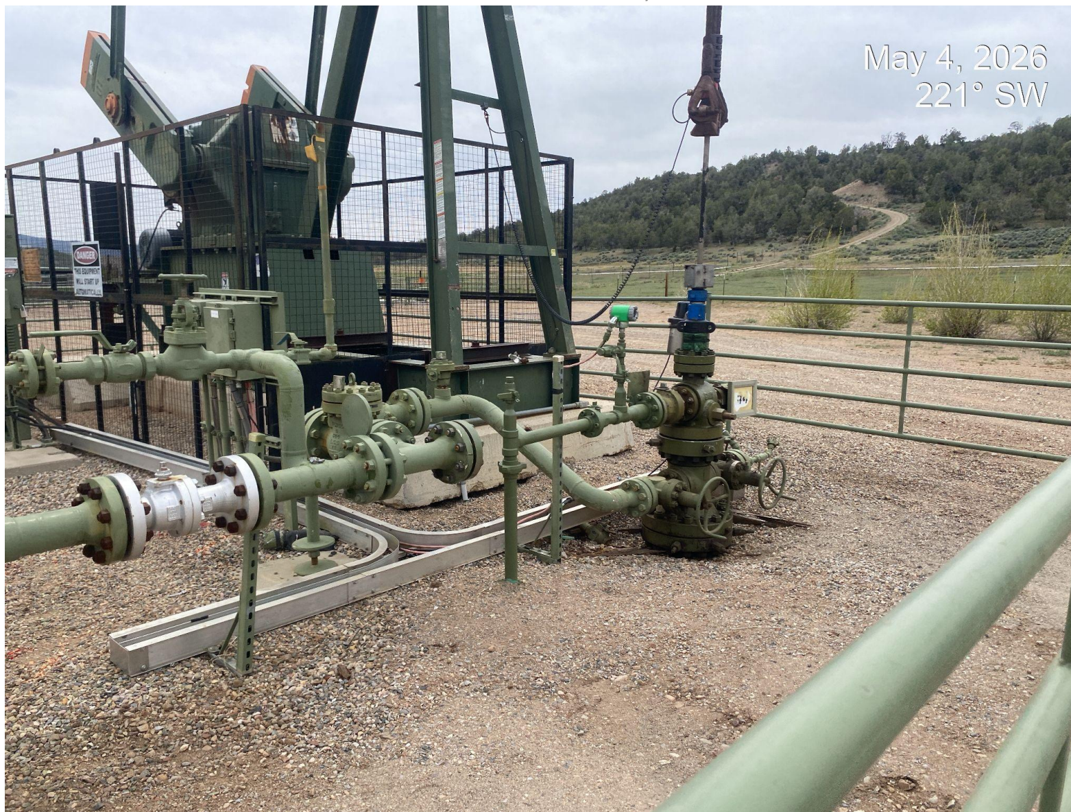
Photo 3. Stained surface material at wellhead #4 has been removed.