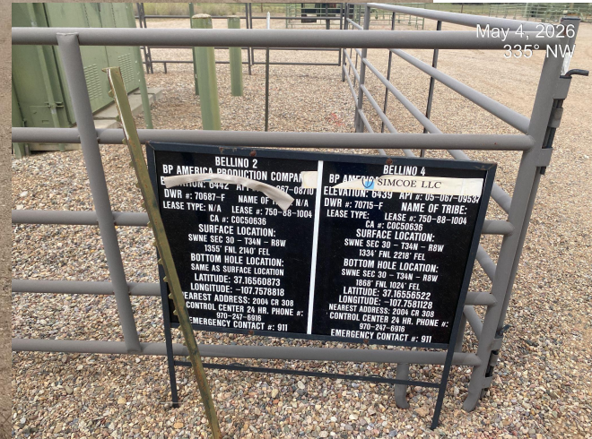
Photo 1. View of the well pad taken from the access point facing center. Note: Location sign is peeling and becoming illegible.