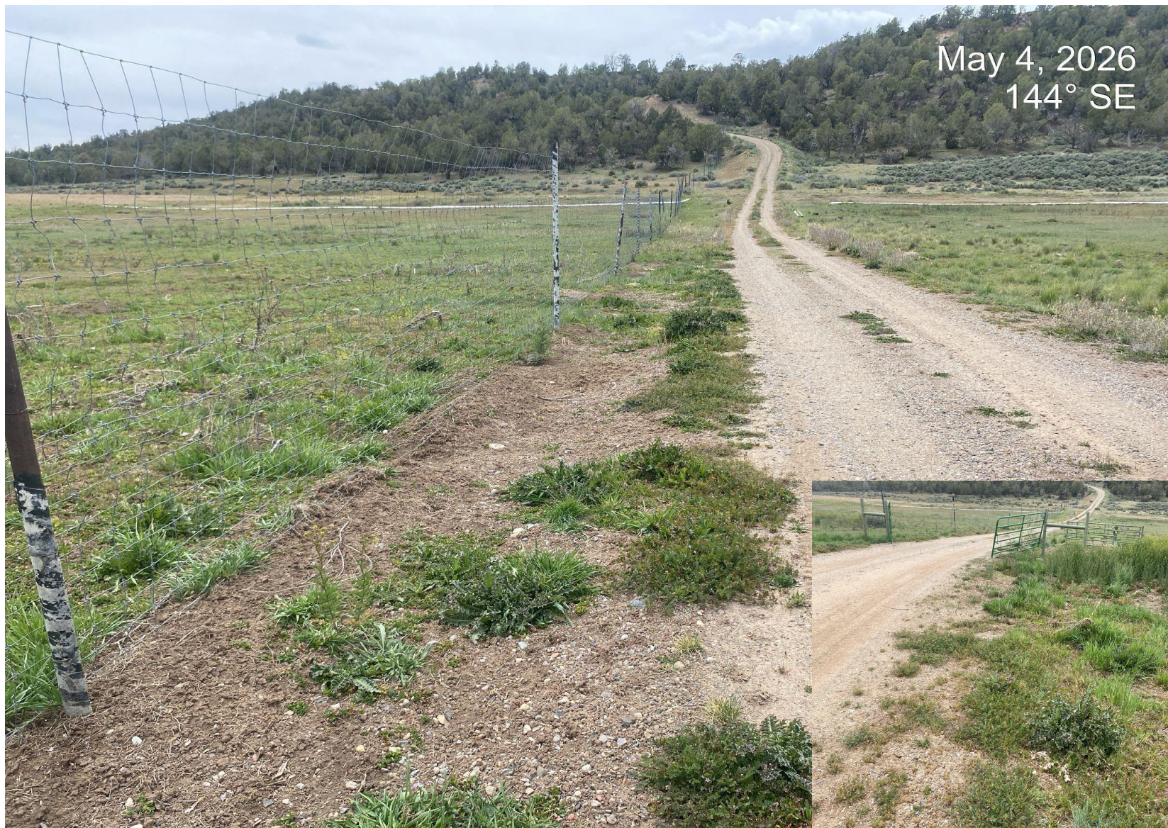
Photo 4. Produced water tank label is peeling and no longer legible.