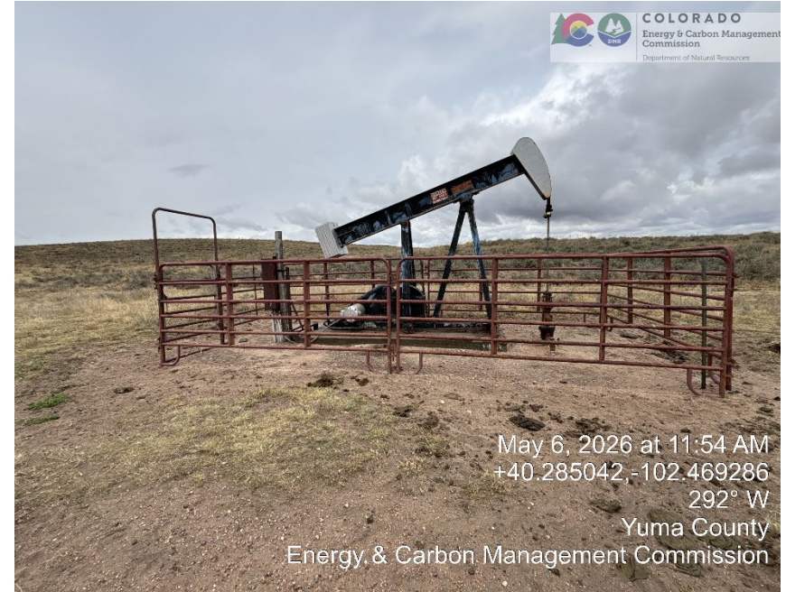
PU and Wellhead