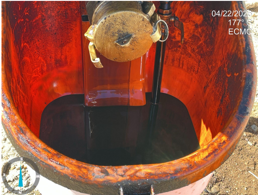
Photo 9. Photos 9-10 taken of the honey pot and uncovered container on the northern side of the tanks, outside the berm. Both have fluids; the container in photo 10 had no protective covers.