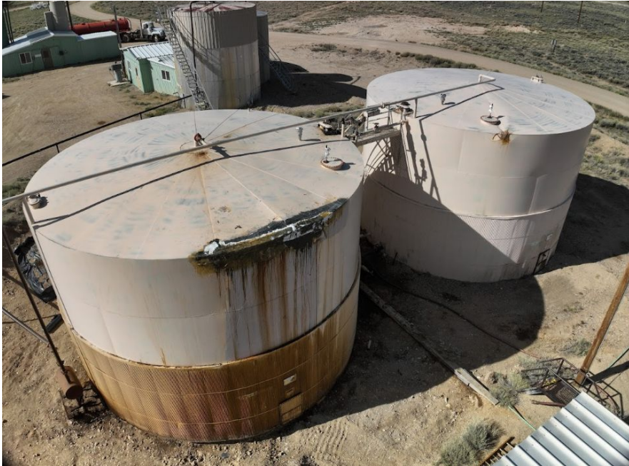
Photo 1. Photos 1-2 taken of the tank battery with drone imagery, illustrating the fiberglass patch.