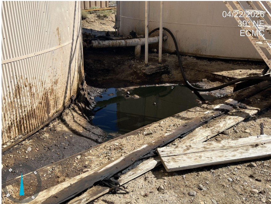
Photo 7. Photos 7-8 taken on the south of the tank batteries, facing northeast. Photos illustrate the free-standing fluids between the two tanks.