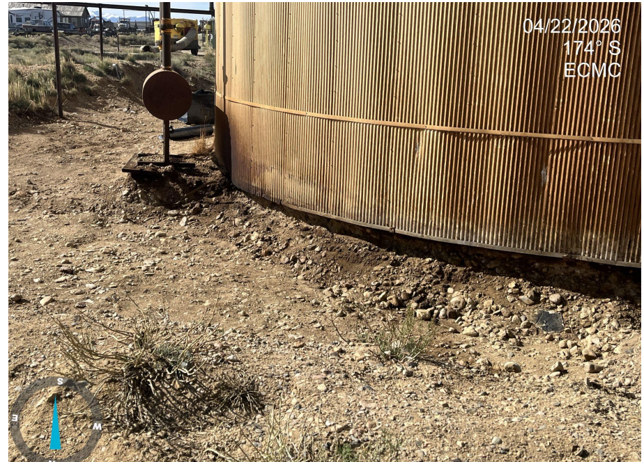
Photo 6. Photo taken from the northeastern portion of the tank battery, facing south, illustrating some of the contaminated soil has been excavated underneath the tank battery.