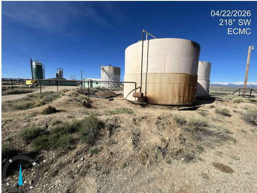
Photo 3. Photo taken from the northeastern portion of the tank battery, facing southwest, illustrating overview.