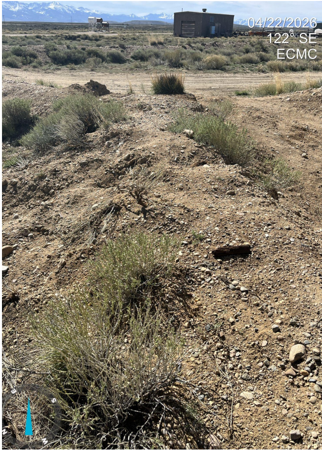
Photo 25. Photos 25-26 illustrate examples of vegetative growth on the earthen berms, illustrating the berms are not impervious to spills.