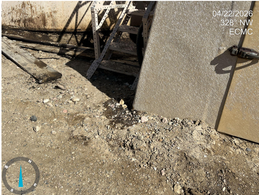
Photo 11. Photos 11-15 taken throughout the Location, illustrating stained and contaminated soils.