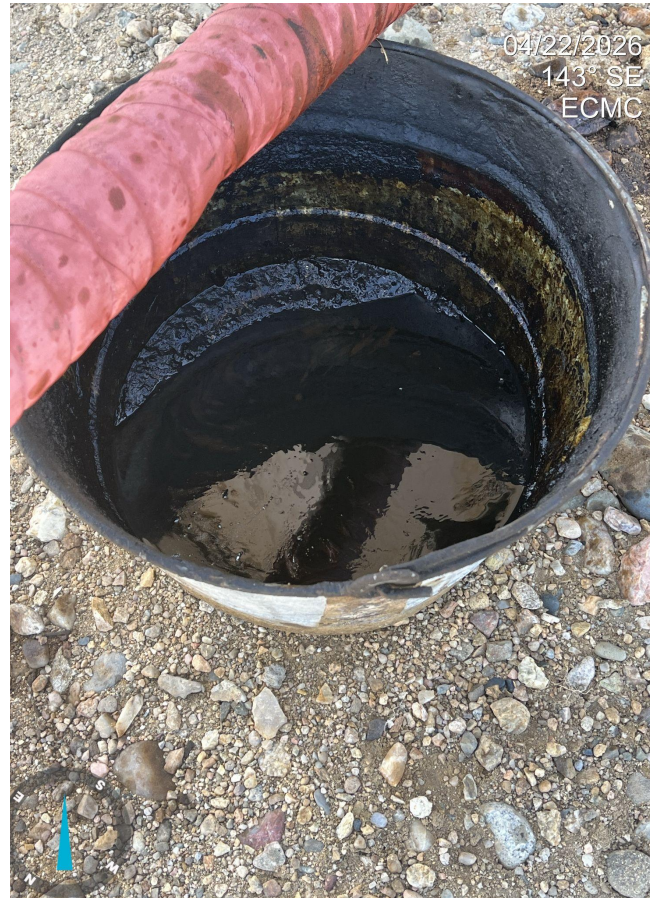
Photo 10. See comments under photo 9.