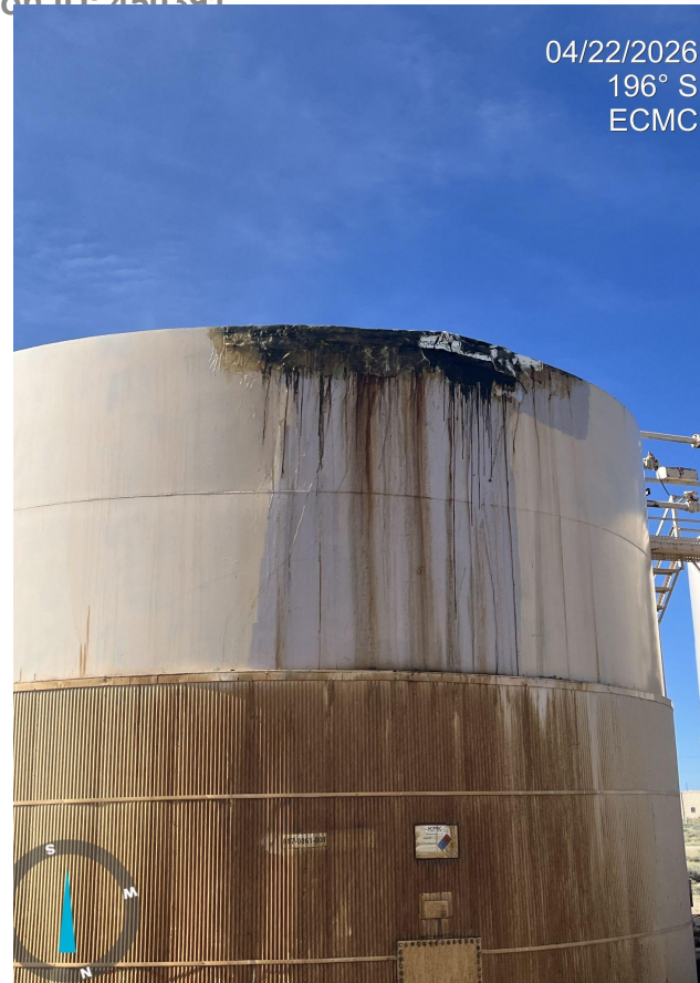
Photo 4. Photos 4-5 taken of the fiberglass patch on the tank.