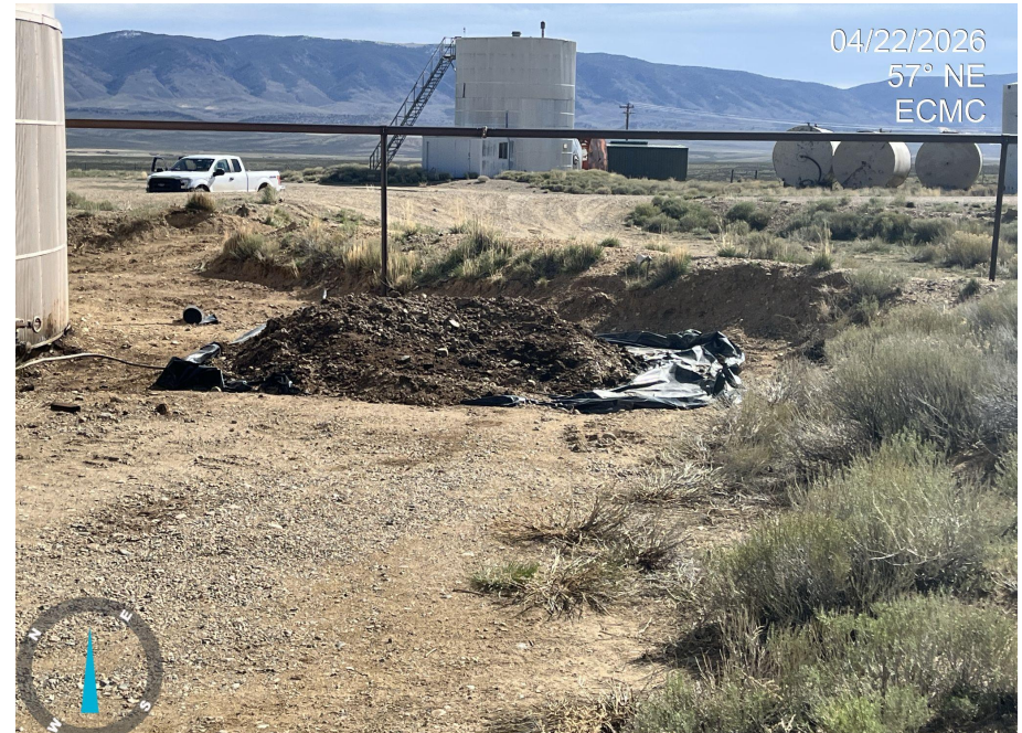
Photo 16. Photos 16-20 illustrated what appears to be the excavated contaminated soil from within the berm during the first spill. The soil is not stored adequately on the additional liner.