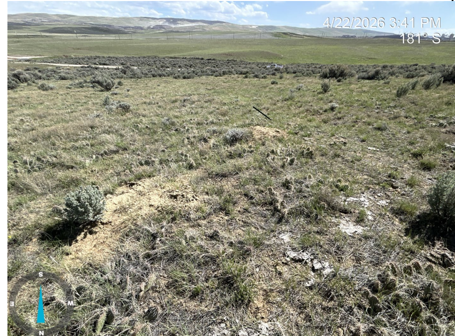
Photo 1: Photos showing an overview of the location looking north and south, respectively. Yellow arrow shows t-post at well coordinate; t-post requires removal before the Abandoned Location is passed.