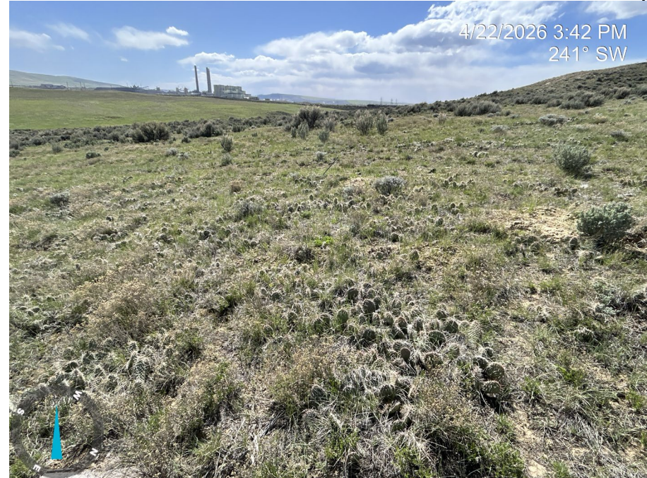
Photo 2: Photos showing an overview of the location looking east and southwest, respectively.