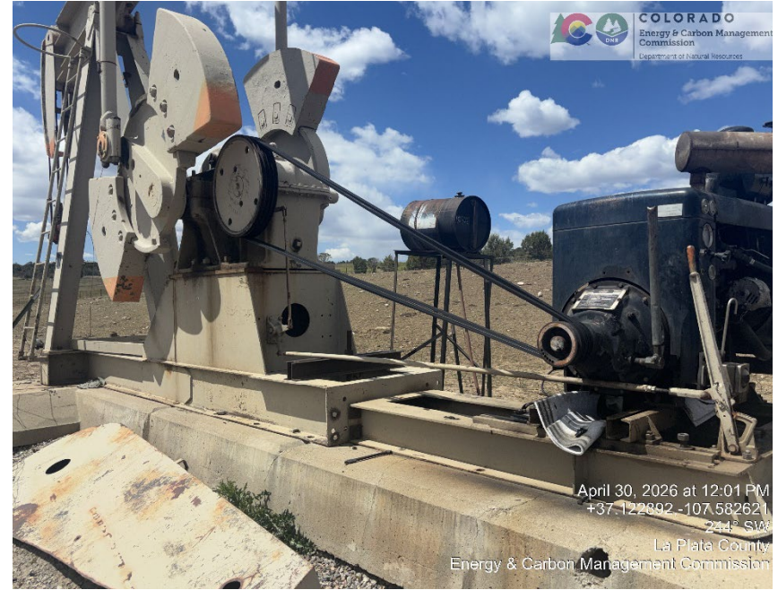
REMOVED DRIVE BELT GUARD