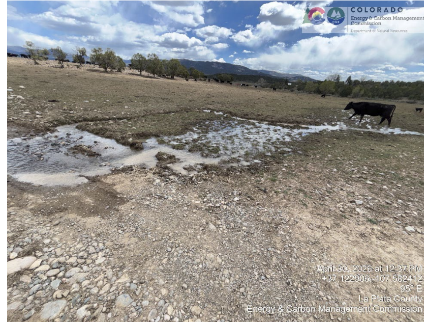
NO CULVERT AT LOCATION ENTERANCE