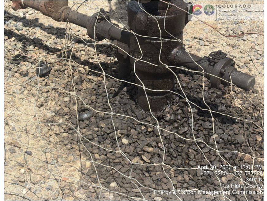
WELLHEAD LUBRICATION LEAK IMPACTED SOIL