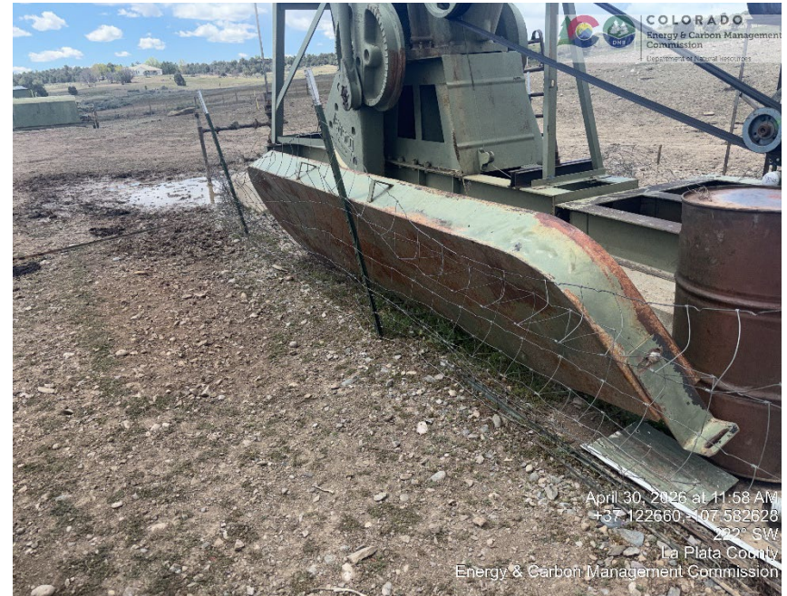
REMOVED DRIVE BELT GUARD