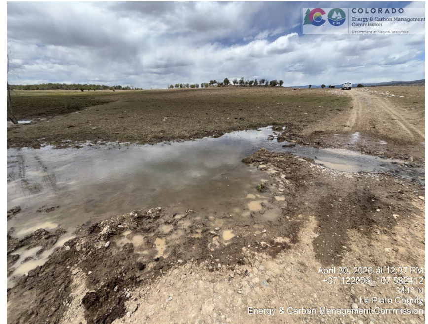
NO CULVERT AT LOCATION ENTERANCE