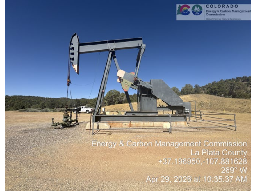
2. Wellhead, and pumpjack.