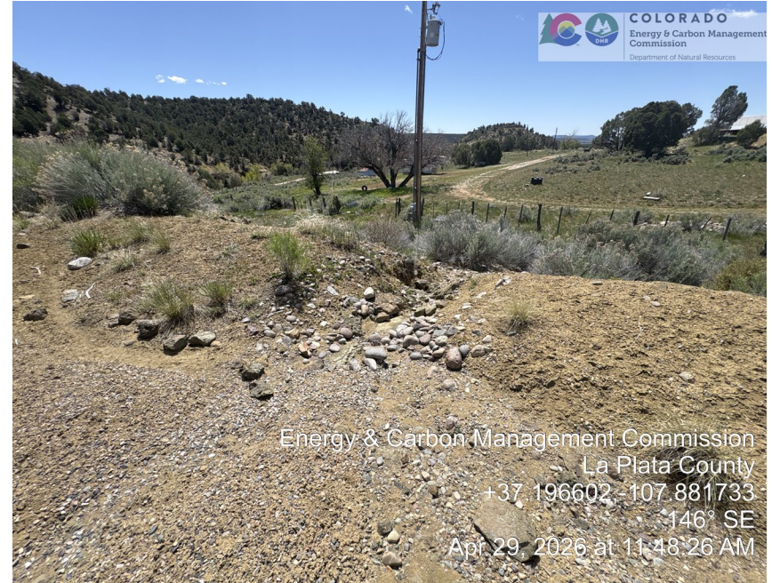
11. Rig anchor markers on north end.