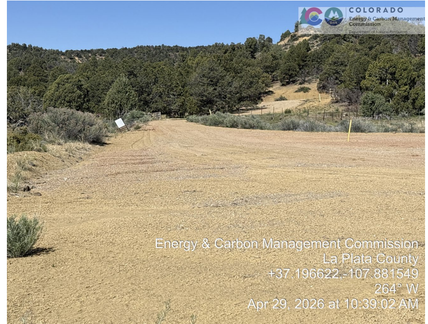
14. Location access road and south end of pad looking west.