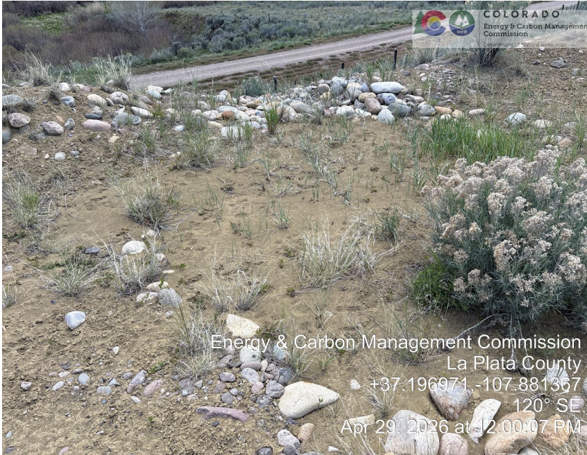
13. Riprap- armored drain and sediment retention feature is functional, but is filling with sediment.