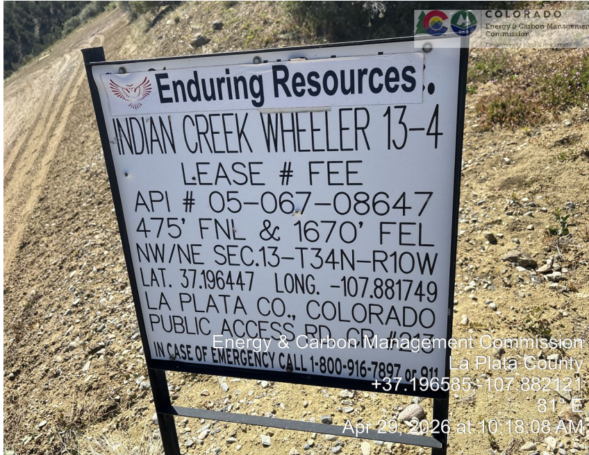
1. Well sign.