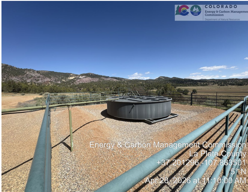
13. Open topped steel produced water tank from SE Corner. Lat Long = 37.201296/-107.863501. Berm appears to be adequate.