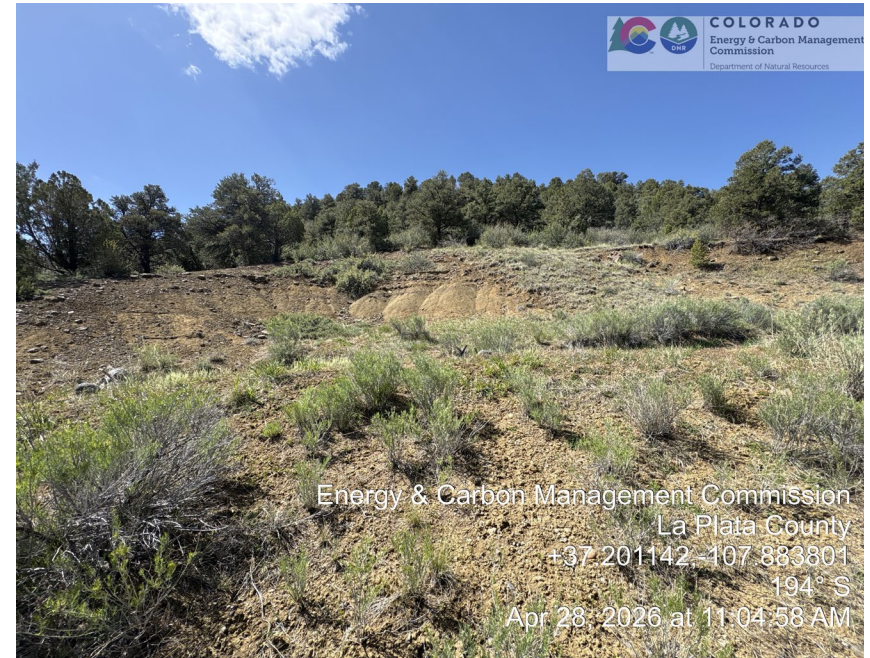
17. Overview of well pad from SE corner looking NW. Rig anchor marker is down. Also marked with "Gas Pipeline" fiberglass marker.