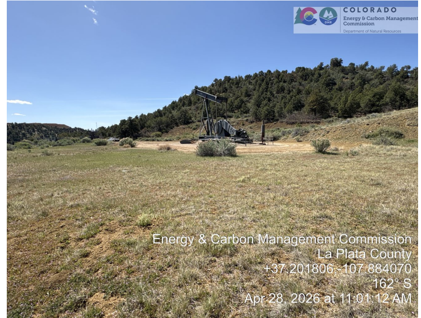
3. Location overview from pad entrance near well sign.