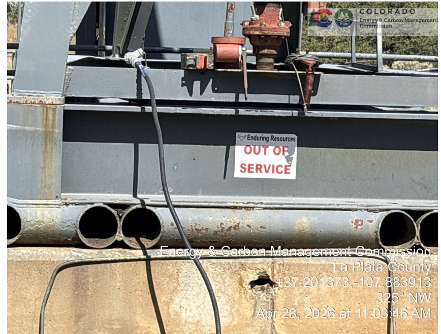
10. Pumpjack labelled out of service near wellhead.