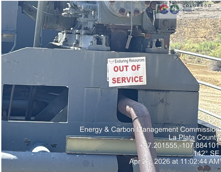
9. Pumpjack labelled out of service by prime mover.