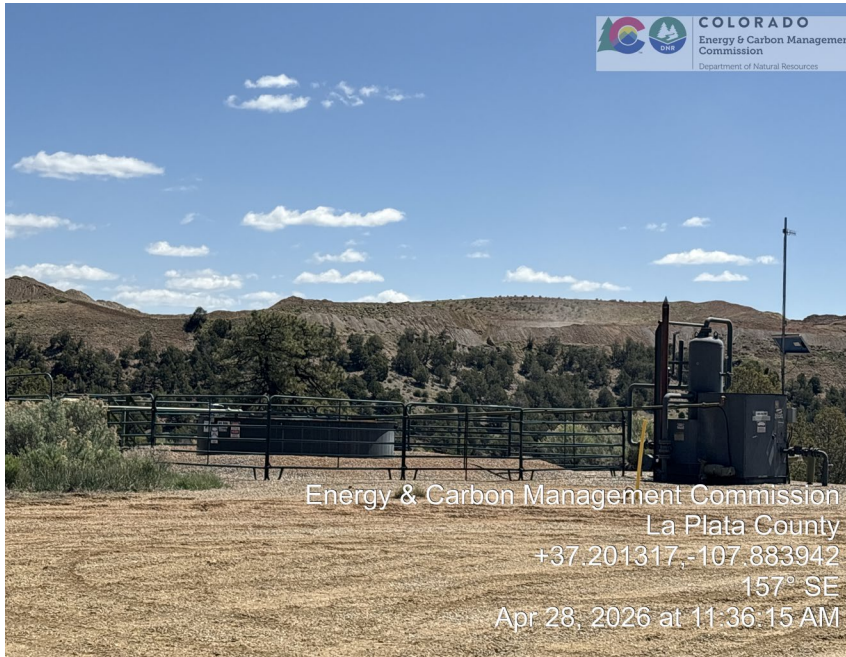
15. Tank behind cattle panel fence and heated separator/meter run structure. Bird protector on heater stack. Solar telemetry.