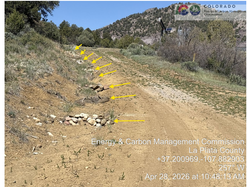
16. Ditch on road approaching pad. Alternating cobble check dams and straw wattles. All appear to be full of sediment and water is flowing around causing erosion.