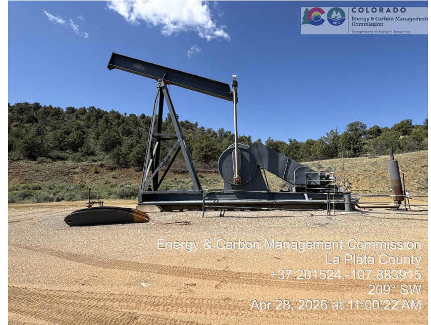
6. Side view of pump jack with horsehead removed and lying on ground.