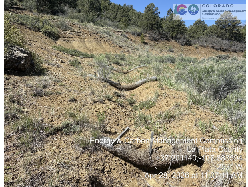
19. Straw wattles in southern reclamation area run-on diversion ditch are full of sediment.