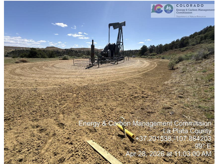
21. Interim reclamation and drainage ditch on east end of well pad.