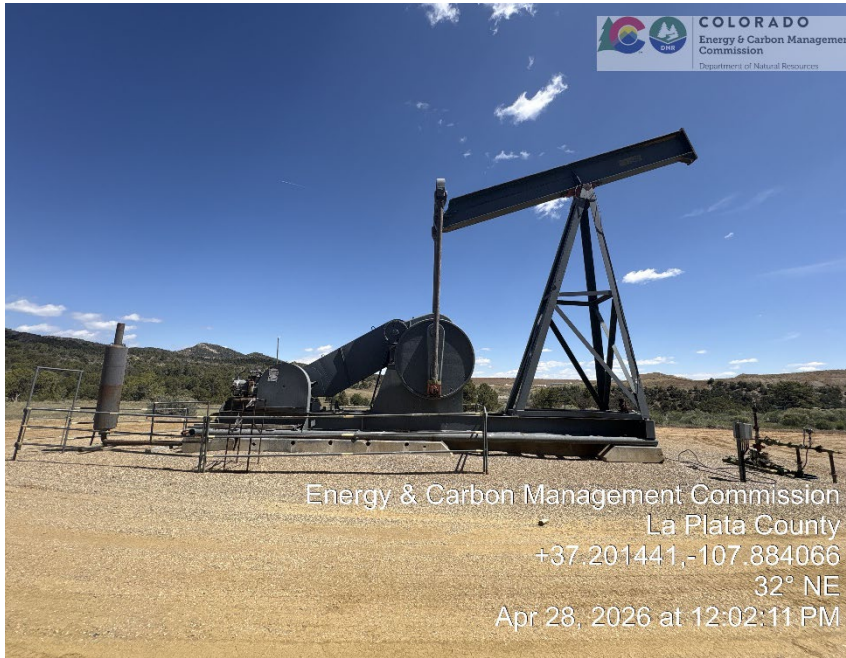
7. Side view of pumpjack and wellhead.