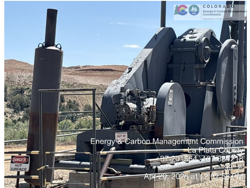
08. Prime mover. Motor appears to have electrical and fuel supply disconnected.