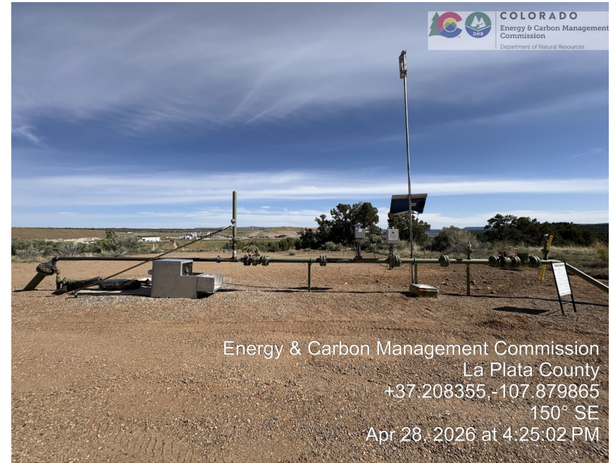
6. Flow line, meter run and solar telemetry. Meter calibration inside box.