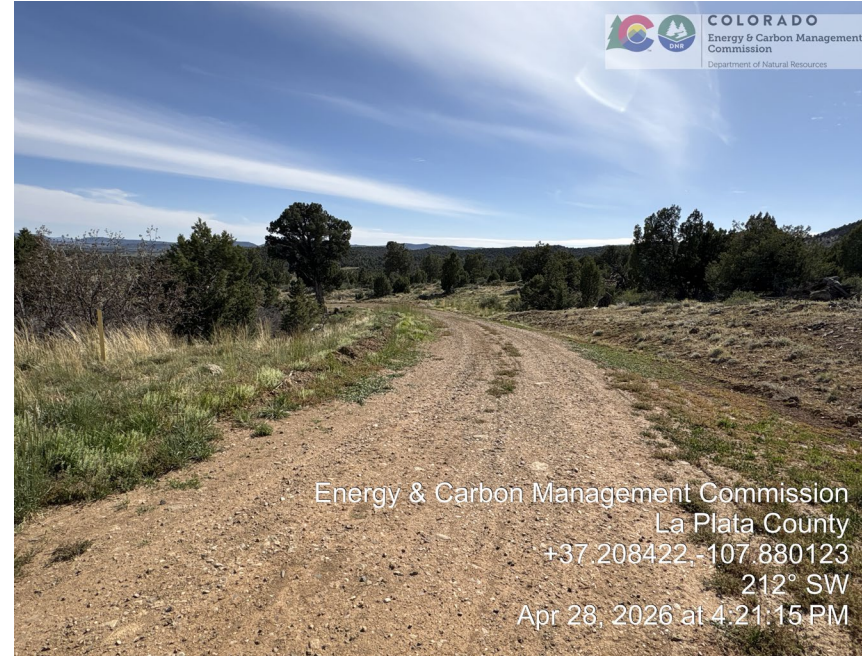
13. Access gate at bottom of access road.