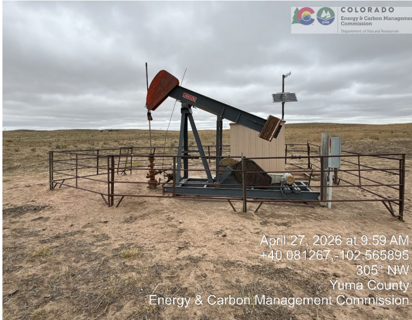
Wellhead and PU