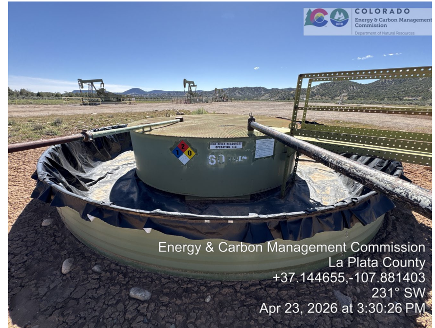
12. 60 BBL Steel AST inside of metal secondary containment with impermeable plastic liner. Has labels for contents, volume, and NFPA diamond.