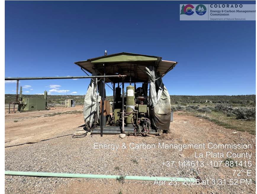
14. Compressor inside shelter structure with canvas curtain sides. Curtains are saturated with oil or antifreeze.