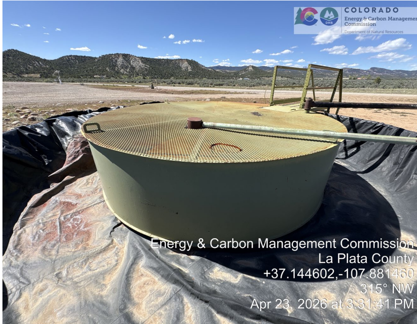
13. 60 BBBL tank from SE Corner.