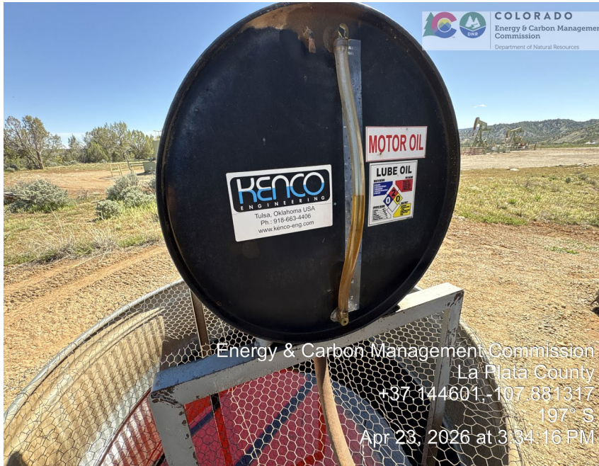
17. One of two lube oil tanks by compressor.