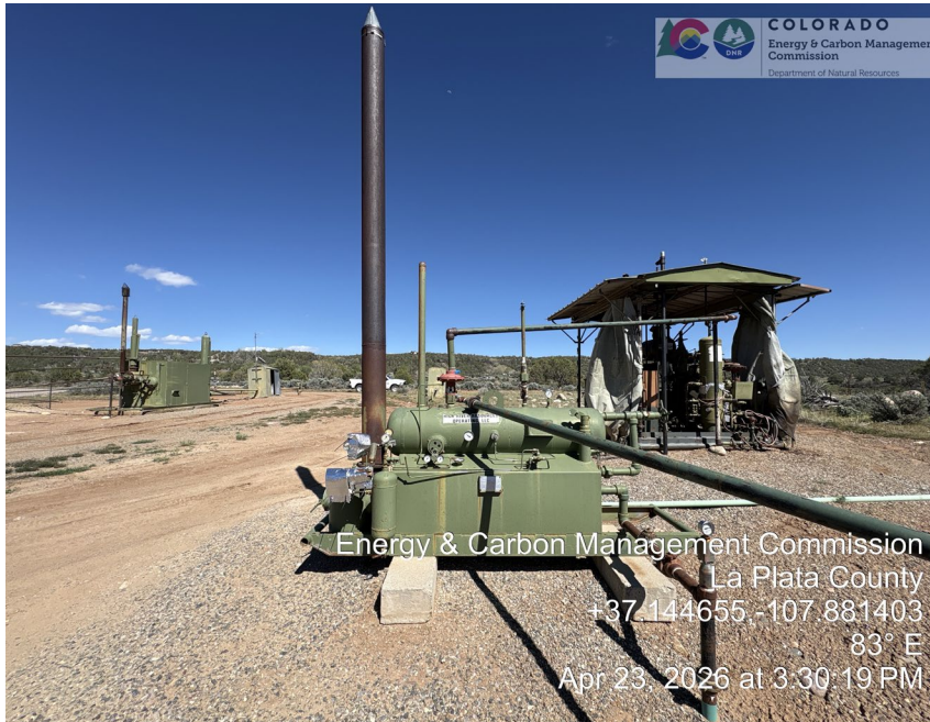
11. Horizontal heated separator with bird protector on heater stack.