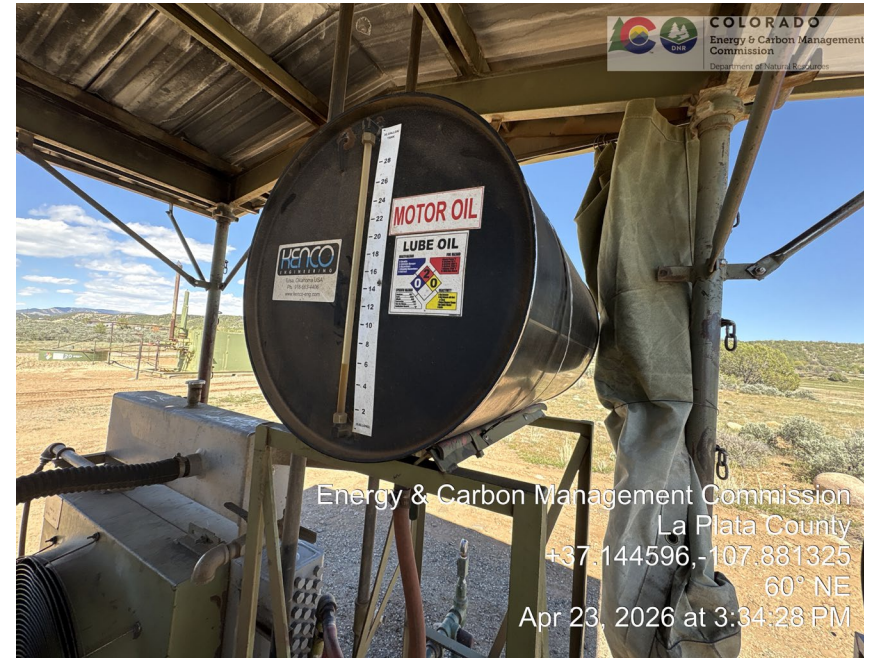
18. Second of two lube oil tanks by compressor.