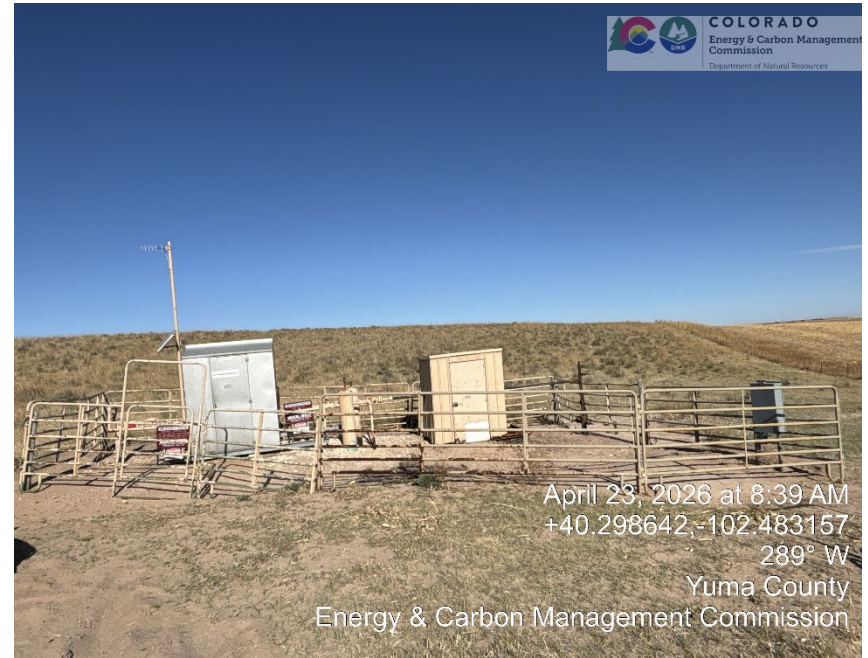
Meter run and Wellhead