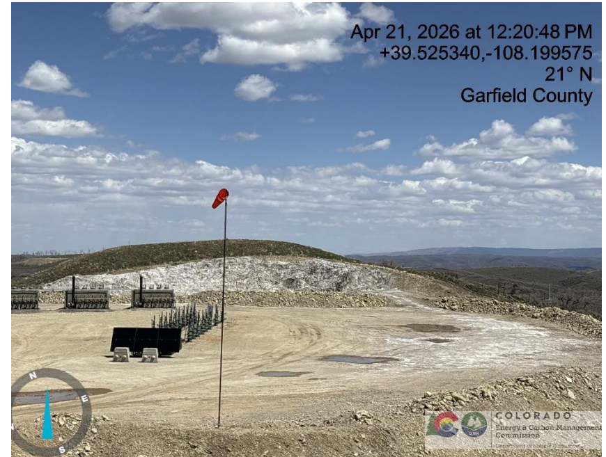
Photo # 1404 Cuttings/E & P waste has migrated onto & across location/not in compliance with CECMC Rules