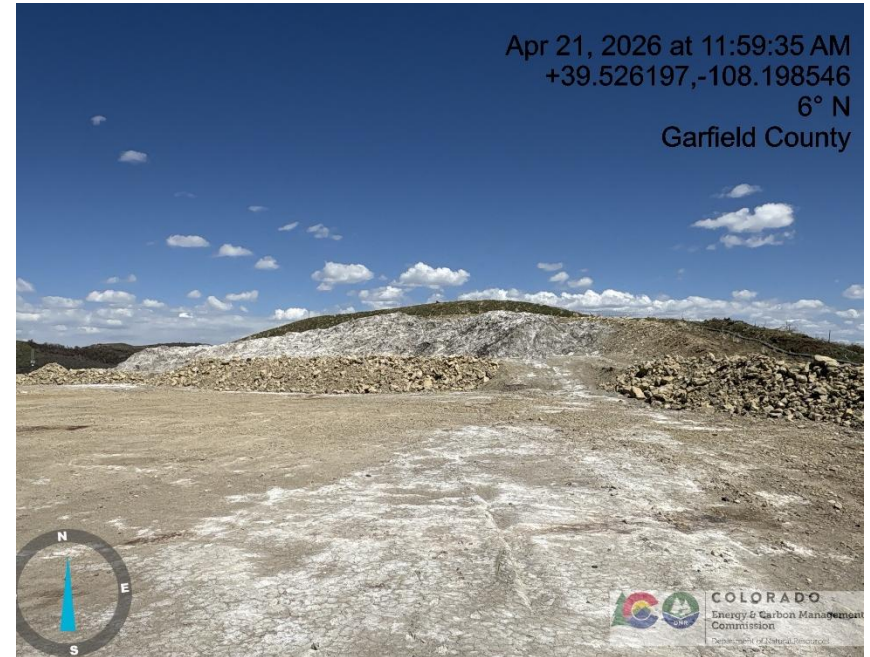
Photo # 1398 Cuttings/E & P waste has migrated onto & across location/not in compliance with CECMC Rules