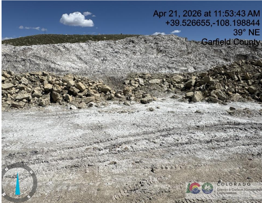
Photo # 1385 Cuttings/E & P waste has migrated onto location/not in compliance with CECMC Rules