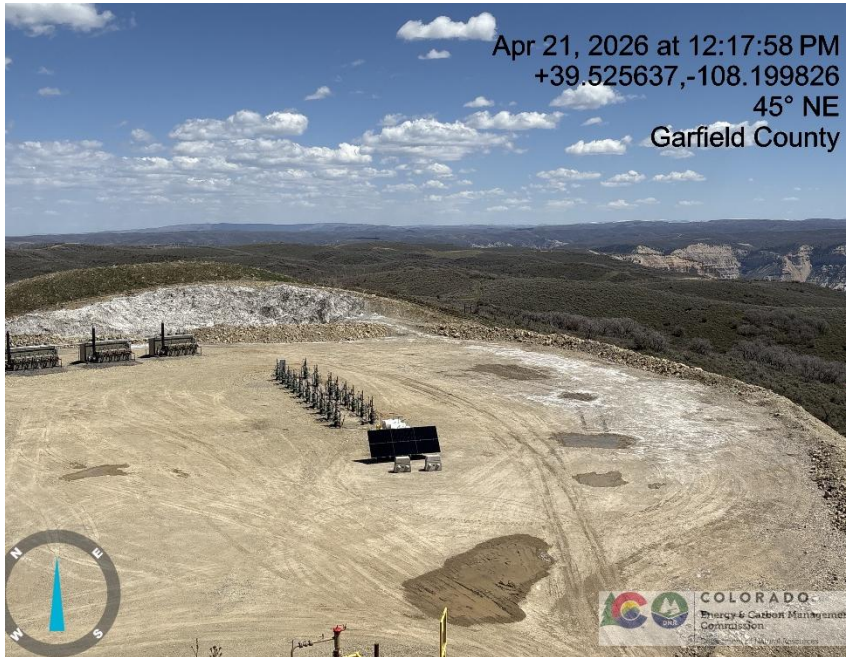
Photo # 1403 Cuttings/E & P waste has migrated onto & across location/not in compliance with CECMC Rules