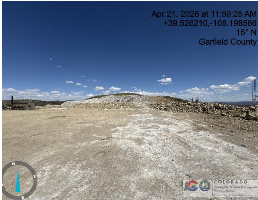
Photo # 1397 Cuttings/E & P waste has migrated onto & across location/not in compliance with CECMC Rules