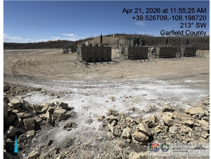
Photo # 1386 Cuttings/E & P waste has migrated onto location/not in compliance with CECMC Rules