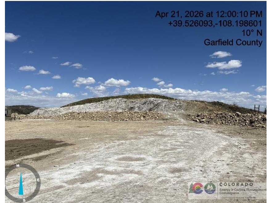
Photo # 1402 Cuttings/E & P waste has migrated onto & across location/not in compliance with CECMC Rules