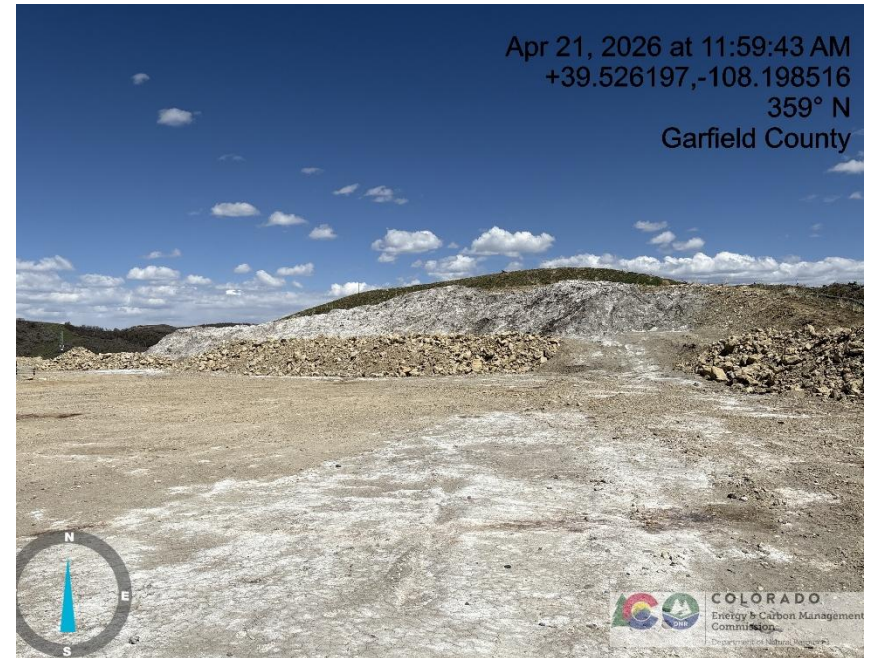
Photo # 1400 Cuttings/E & P waste has migrated onto & across location/not in compliance with CECMC Rules