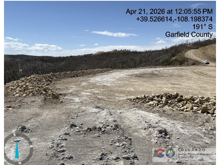
Photo # 1390 Cuttings/E & P waste has migrated onto & across location/not in compliance with CECMC Rules