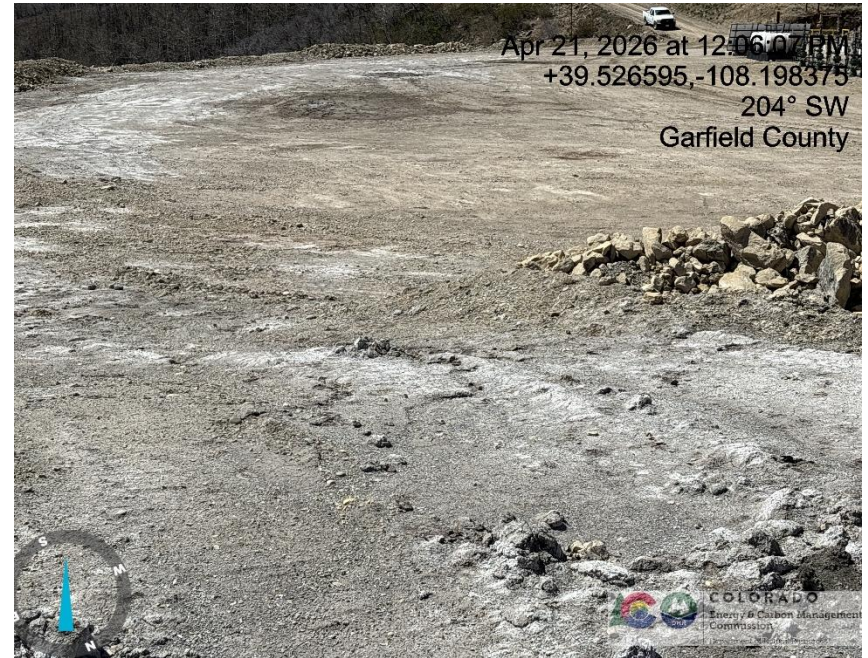
Photo # 1391 Cuttings/E & P waste has migrated onto & across location/not in compliance with CECMC Rules