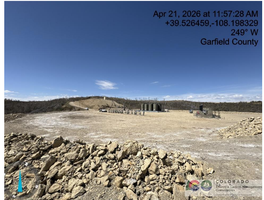
Photo # 1395 Cuttings/E & P waste has migrated onto & across location/not in compliance with CECMC Rules

Photo # 1396 Cuttings/E & P waste has migrated onto & across location/not in compliance with CECMC Rules