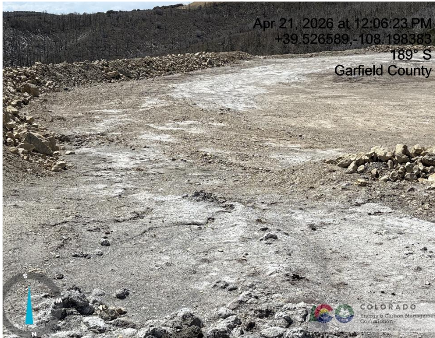
Photo # 1393 Cuttings/E & P waste has migrated onto & across location/not in compliance with CECMC Rules