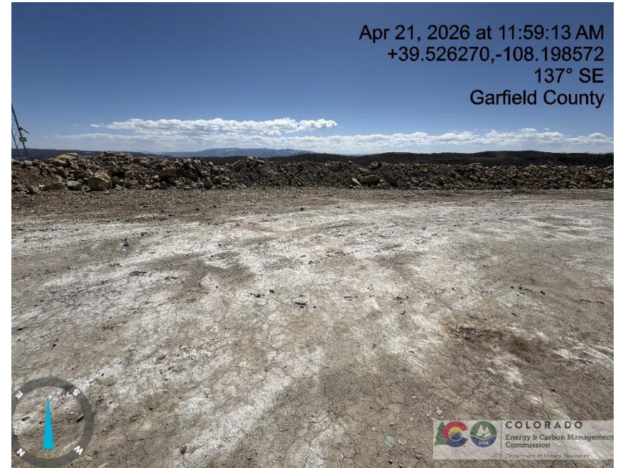
Photo # 1394 Cuttings/E & P waste has migrated onto & across location/not in compliance with CECMC Rules