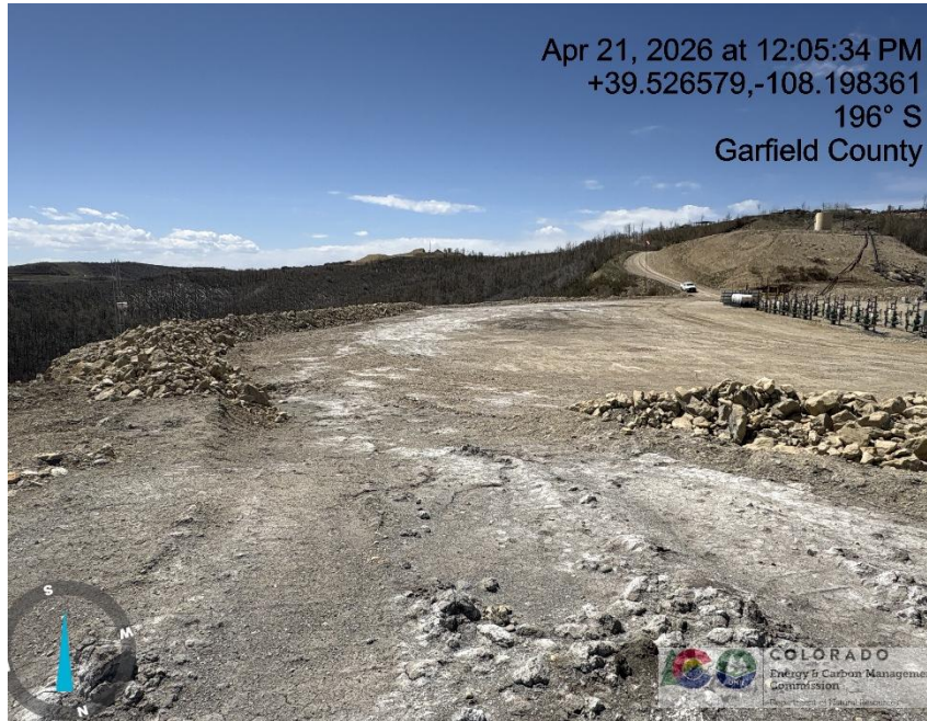
Photo # 1389 Cuttings/E & P waste has migrated onto & across location/not in compliance with CECMC Rules