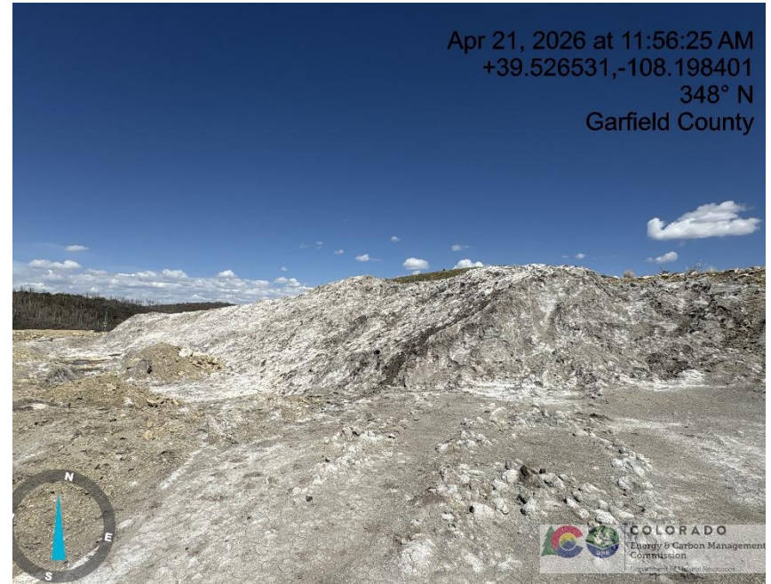
Photo # 1387 Cuttings/E & P waste has migrated onto location/not in compliance with CECMC Rules