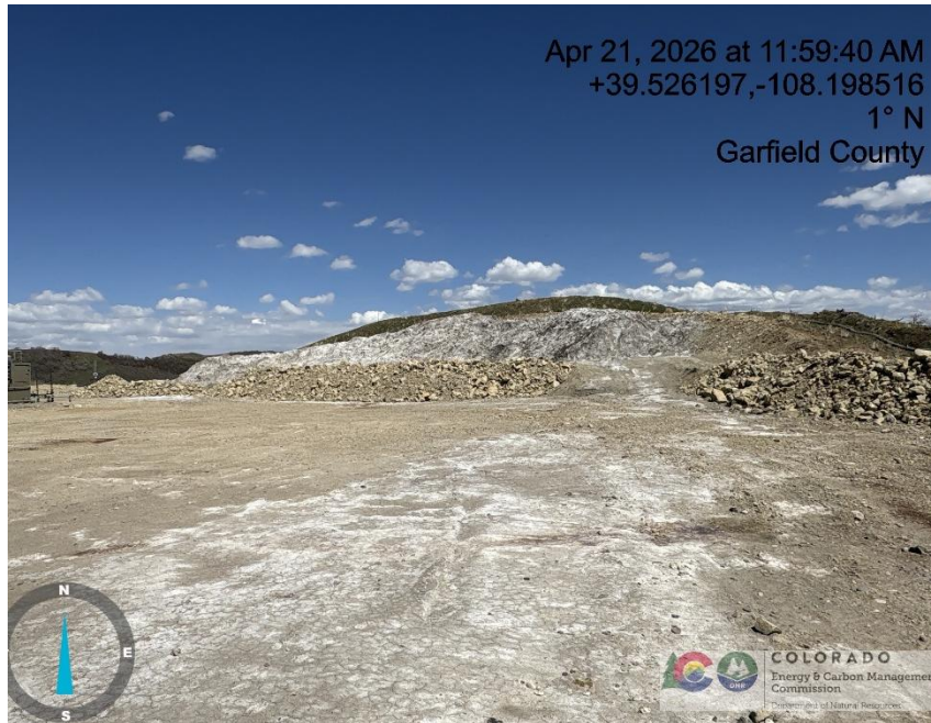
Photo # 1399 Cuttings/E & P waste has migrated onto & across location/not in compliance with CECMC Rules