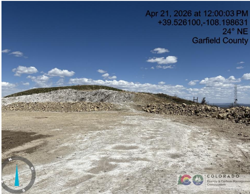
Photo # 1401 Cuttings/E & P waste has migrated onto & across location/not in compliance with CECMC Rules