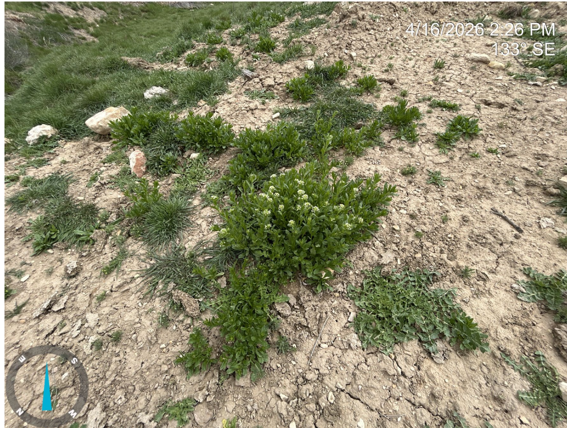
Photo 7: Photos showing an example of whitetop and thistle rosettes, likely Canada thistle (both a List B noxious weed), that are present throughout the location. Weed management is required per Rules 606.c. and 1004.e.