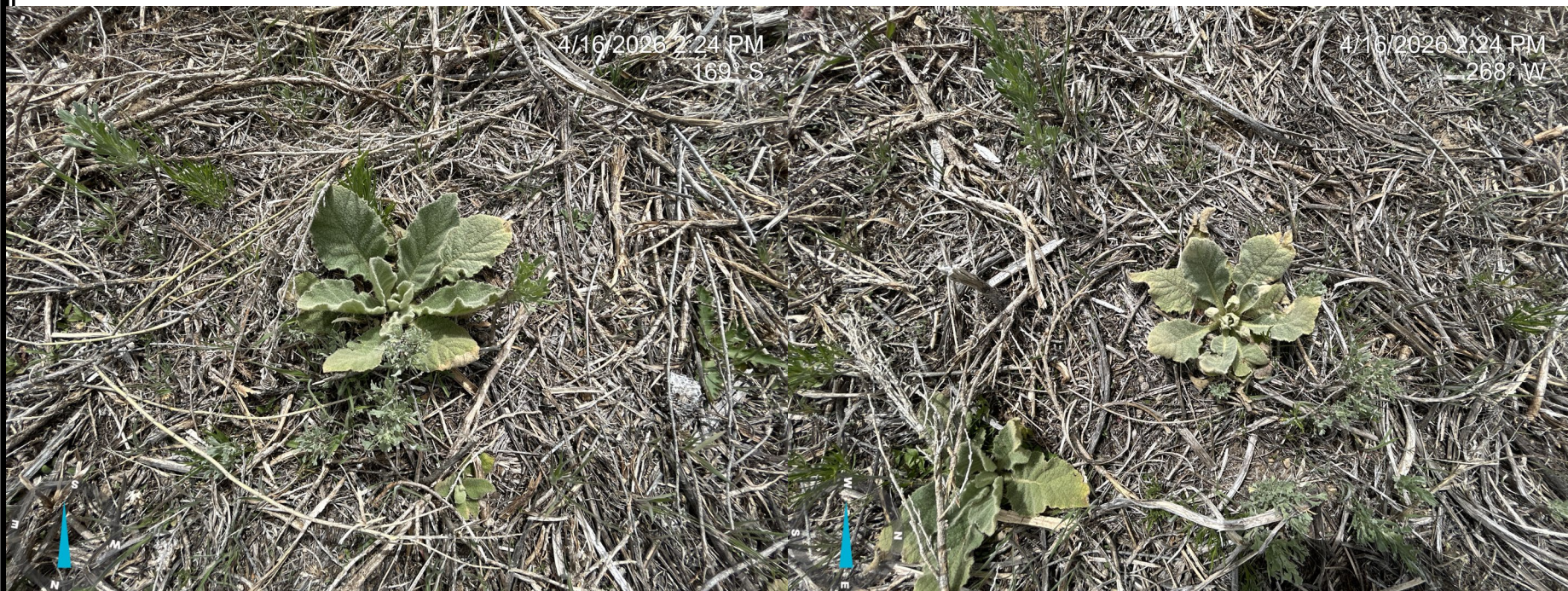
Photo 5: Photos showing an example of common mullein, a List C noxious weed, is present throughout the location. Weed management is required per Rules 606.c. and 1004.e.