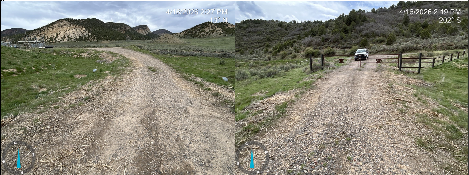
Photo 8: Photos showing the access road; the location has a pending Variance request (Docket #220700196) to leave the access road unreclaimed.