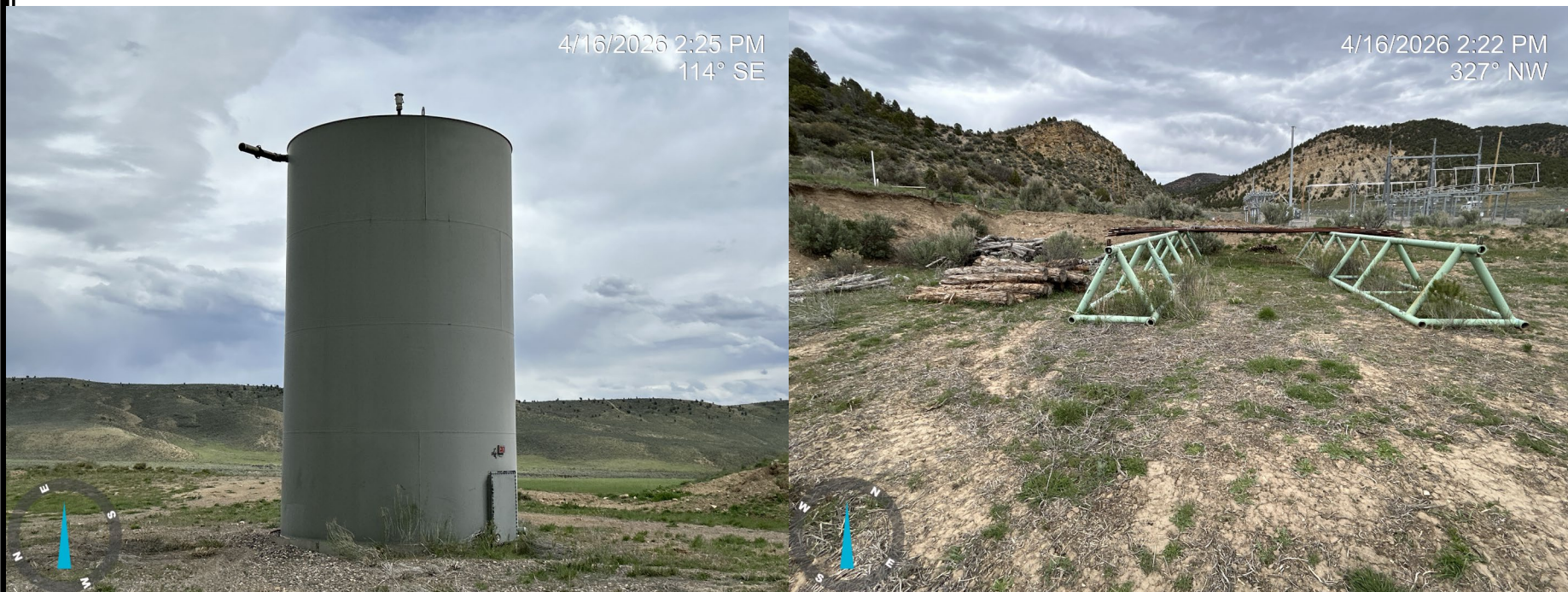
Photo 9: Photos showing an example of equipment at the location that was purchased/stored by the Surface Owner. Operator has submitted a bill of sale.