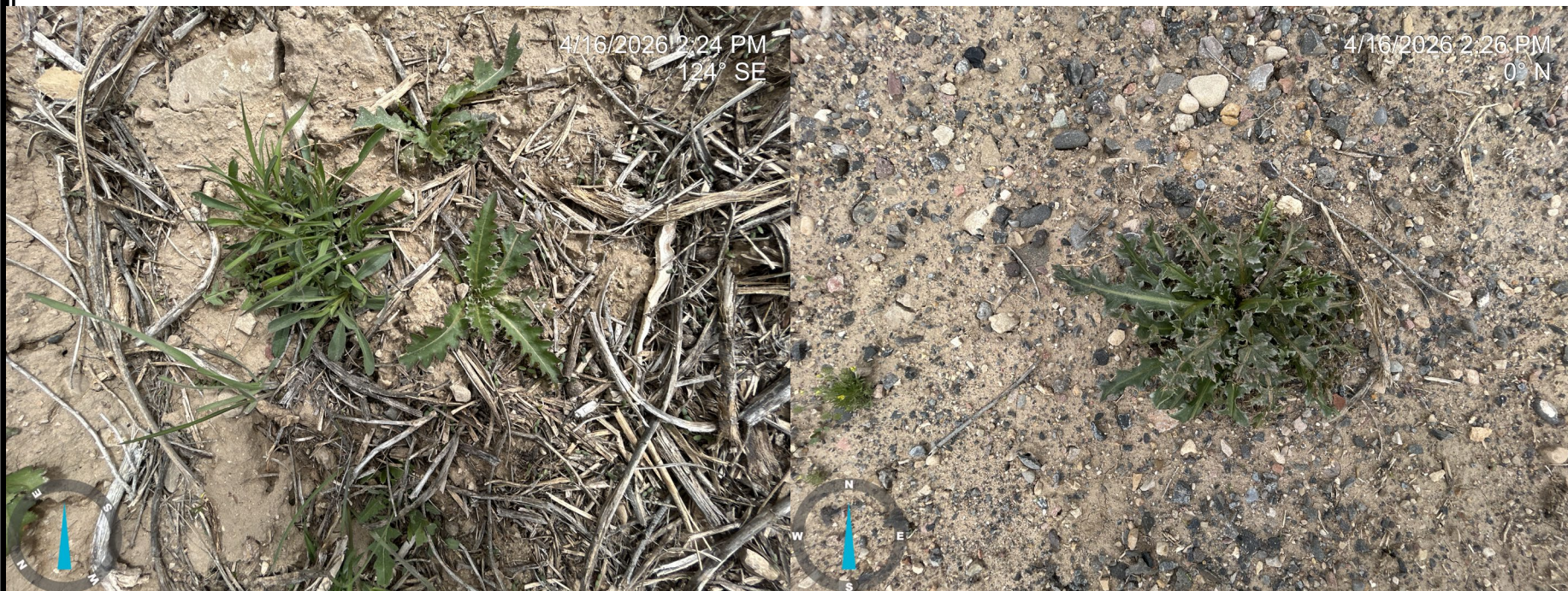
Photo 6: Photos showing an example of young thistle basal rosettes, likely Canada thistle (a List B noxious weed), that is present throughout the location. Weed management is required per Rules 606.c. and 1004.e.