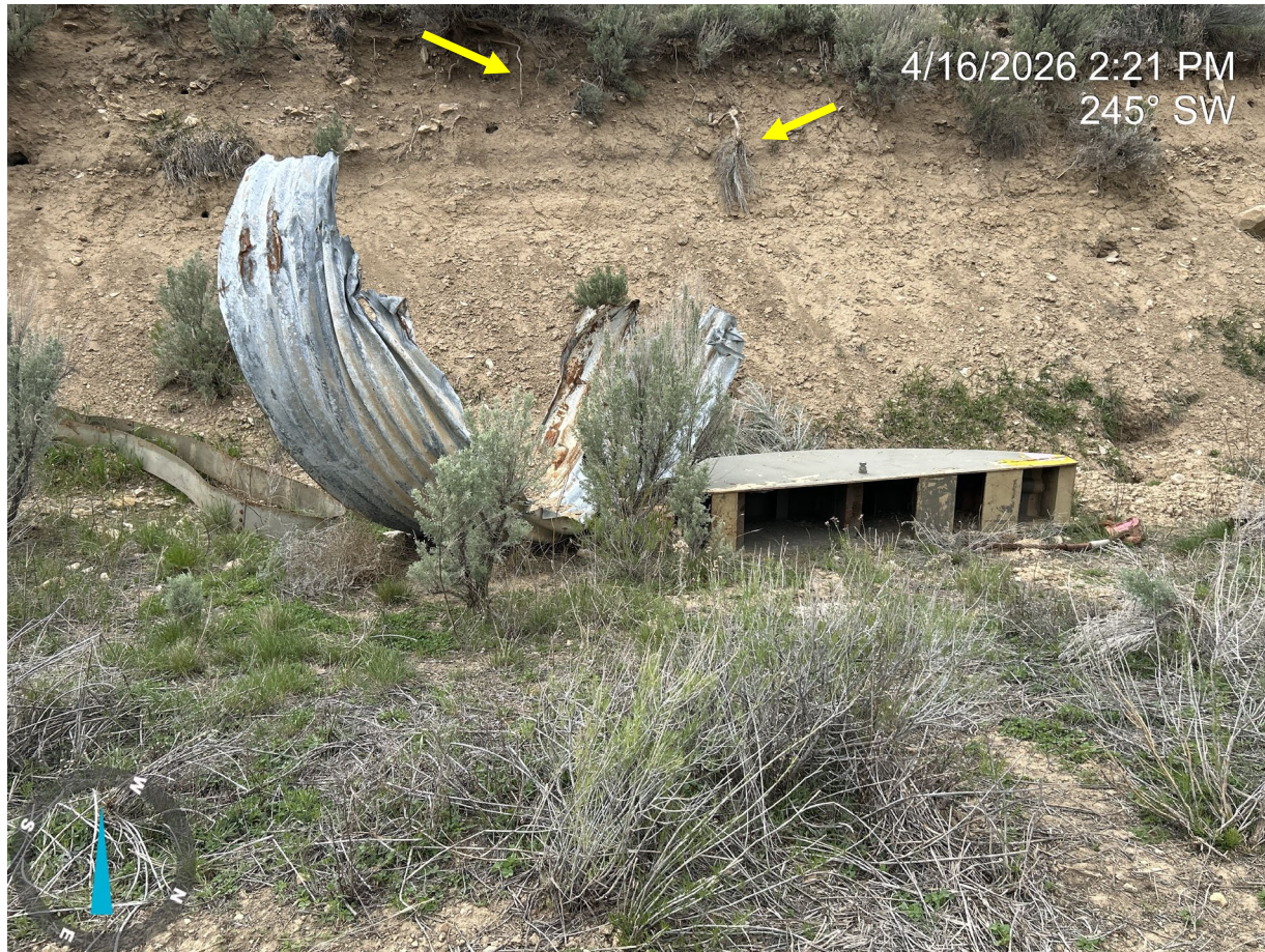
Photo 4: Photo showing exposed roots (yellow arrow) on the western cut slope, indicating erosion and degradation.