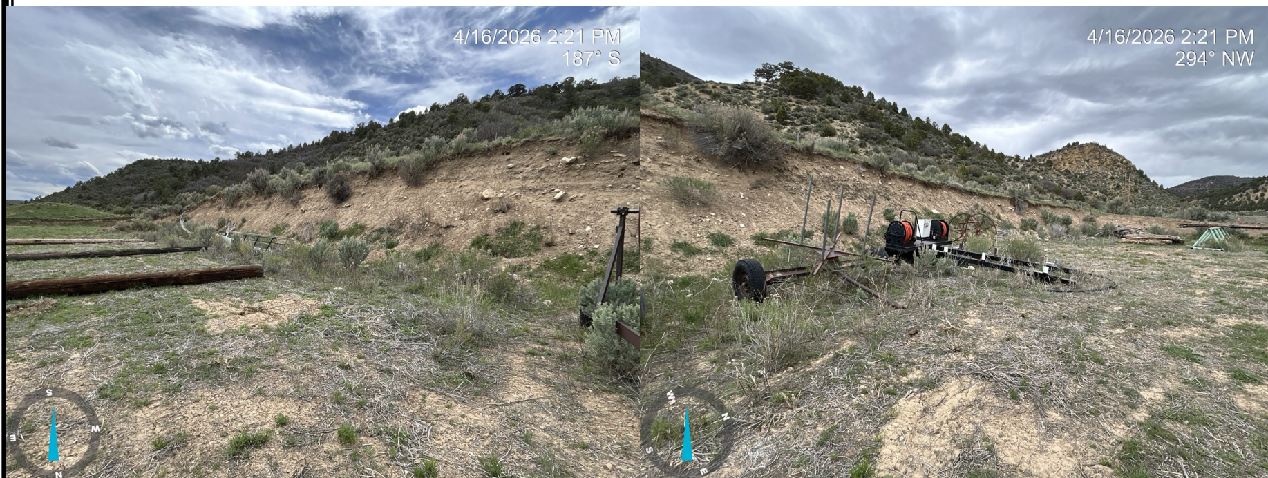
Photo 3: Photos showing the western cut slope. Scarping appears to be occurring. Rule 1002.f. is not waivable per Rule 1001.c.; comply with Rule 1002.f. and stabilize cut slopes.