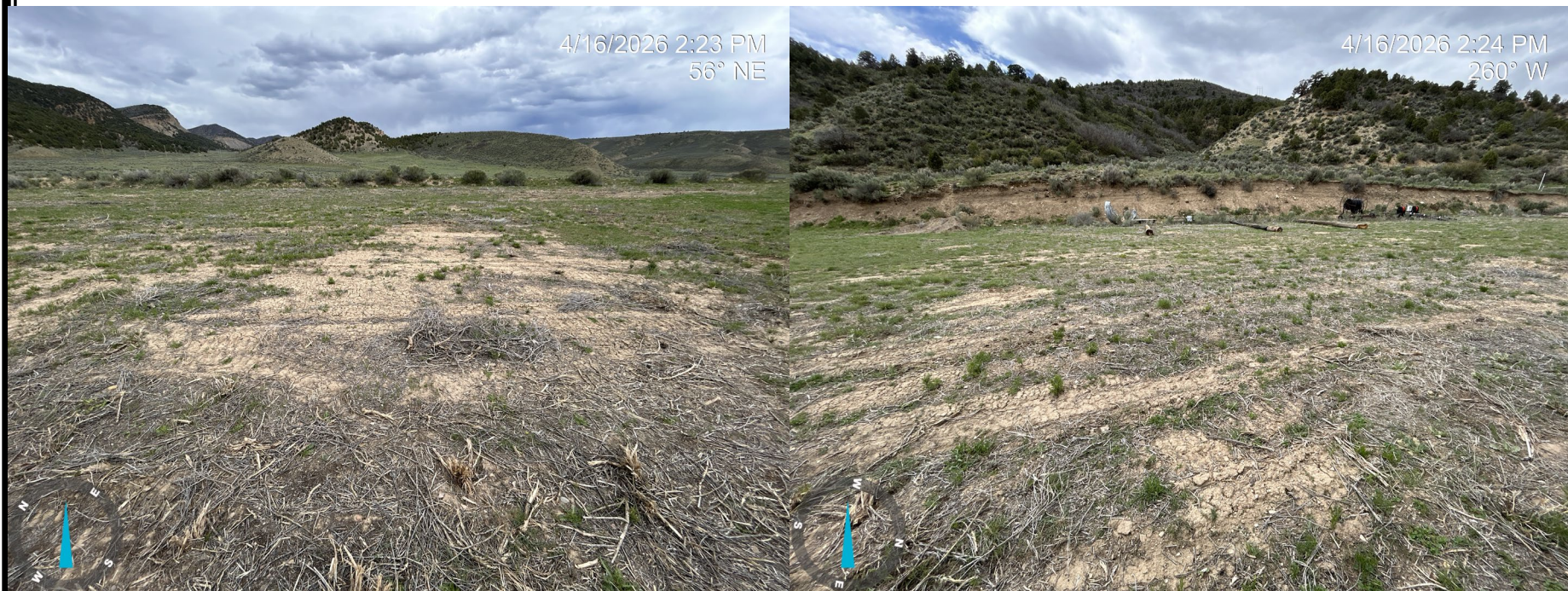
Photo 2: Photos showing an overview of the location looking northeast and west, respectively.