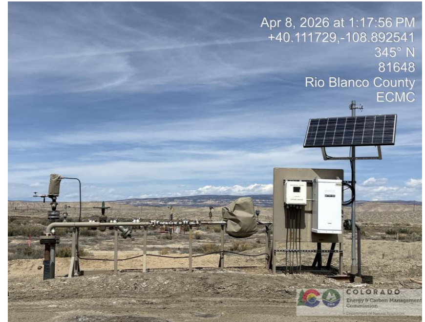
Photo # 4284 Wellhead sign lacks public road used to access the well