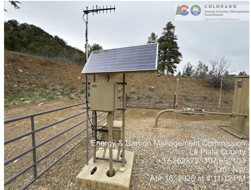
5. Production equipment.