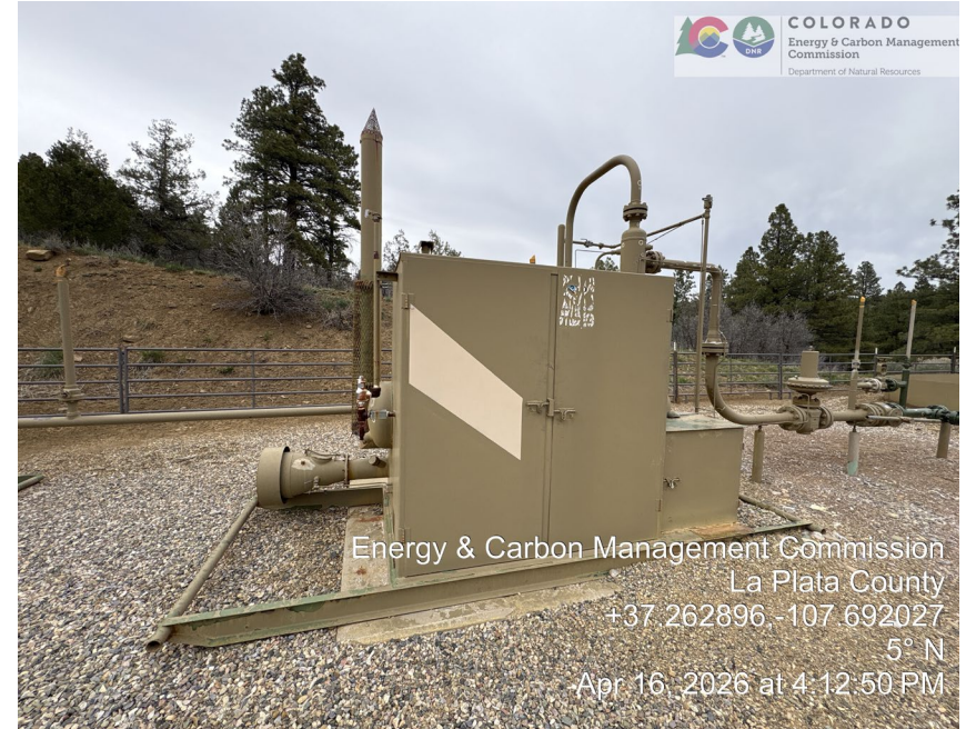
7. Meter run shed.