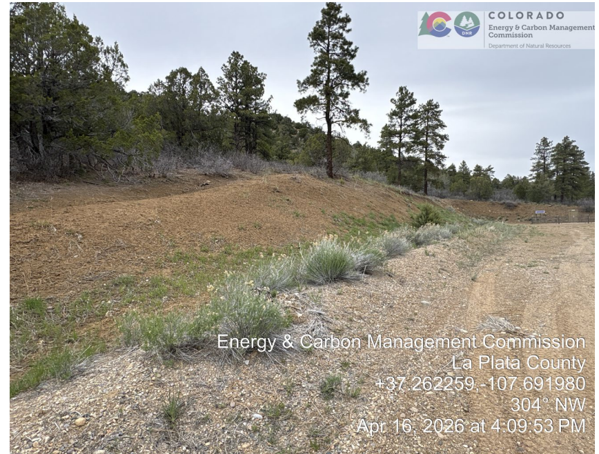
13. Cut slope next to location access road near entrance.