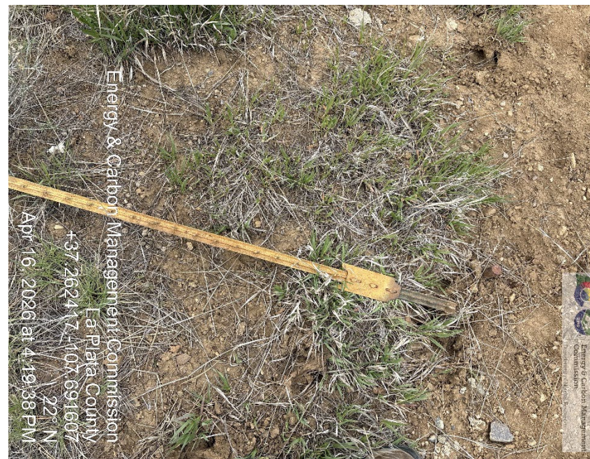
11. Sediment trap and ditch on east side of pad.