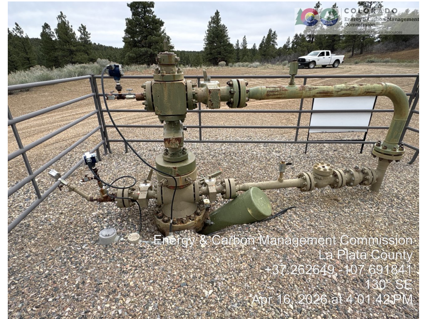
3. Wellhead behind cattle panel fence.