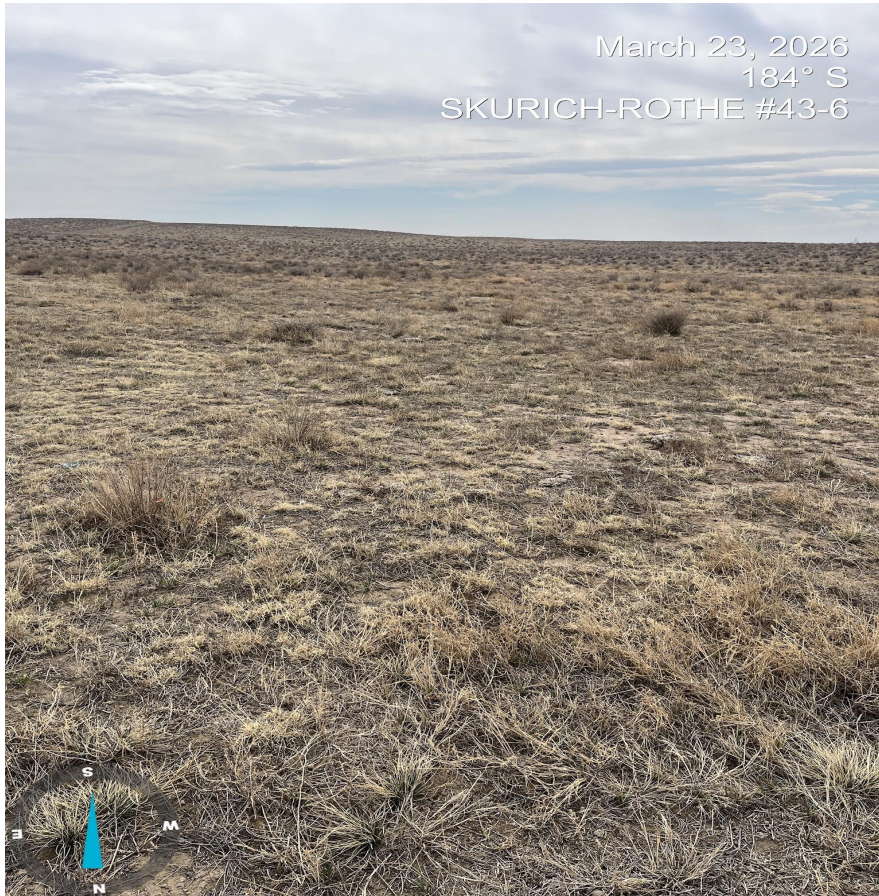
Photo 5. Photo taken from the disturbance area facing south showing the establishment of desirable vegetation.