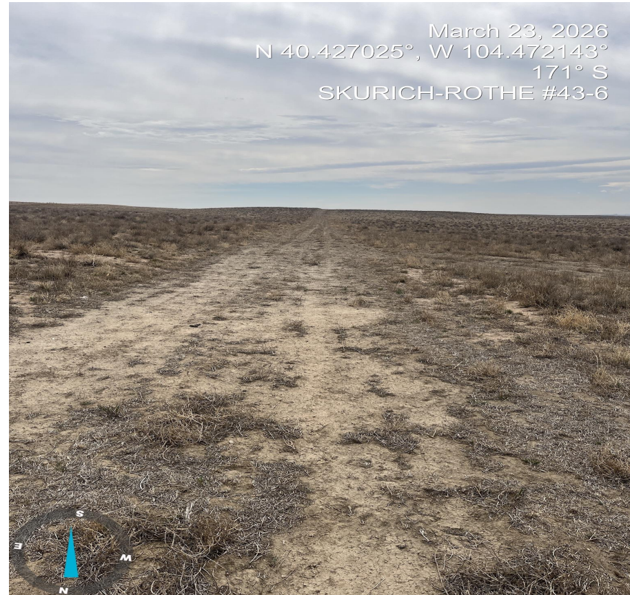
Photo 10. Photo taken from the lease road facing south showing bare soil and the establishment of undesirable vegetation.