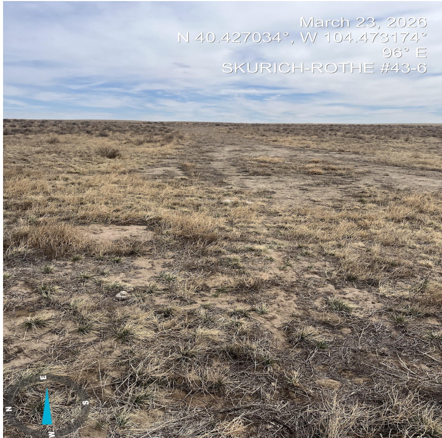
Photo 3. Photo taken from the disturbance area facing east showing the establishment of desirable vegetation in the disturbance area. Bare soil is present where the well was previously located and on the access road.