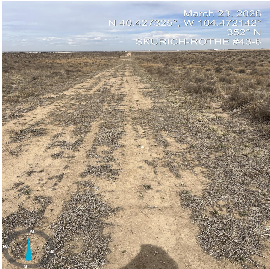
Photo 11. Photo taken from the lease road north of the well location, showing bare soil and some establishment of desirable vegetation on the east side of the road.