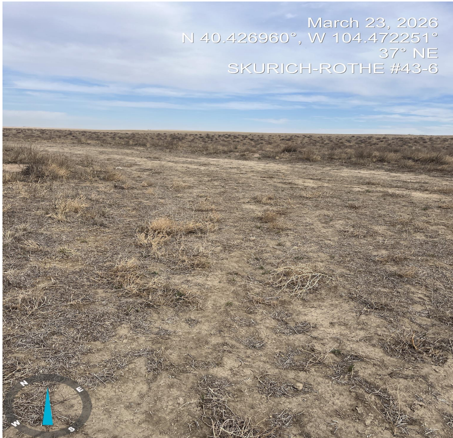
Photo 9. Photo taken from the east side of the well access road at its intersection with the lease road, showing bare soil and the establishment of undesirable vegetation.