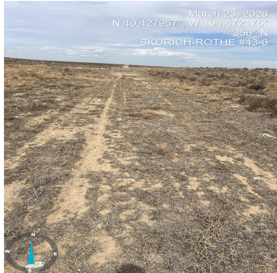
Photo 12. Photo taken from access road north of well location, showing bare soil and some establishment of desirable vegetation on the east side of access road.