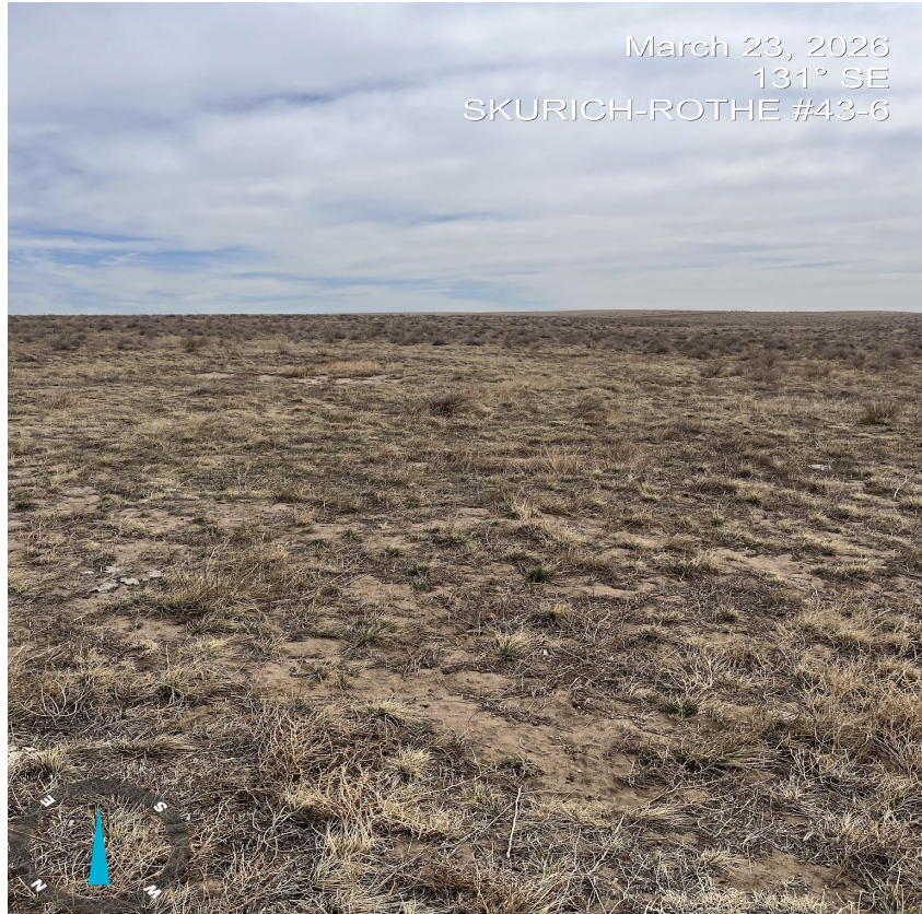
Photo 7. Photo taken from the disturbance area facing southeast, showing establishment of desirable vegetation.