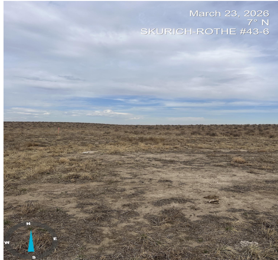
Photo 6. Photo taken from the disturbance area facing north, showing the establishment of some desirable vegetation and bare soil where the well was located.