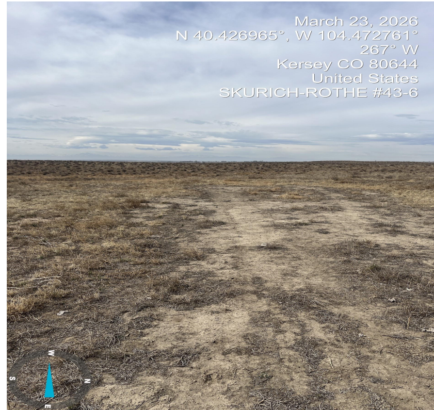
Photo 4. Photo taken from the disturbance area facing west, see comment under photo 3.