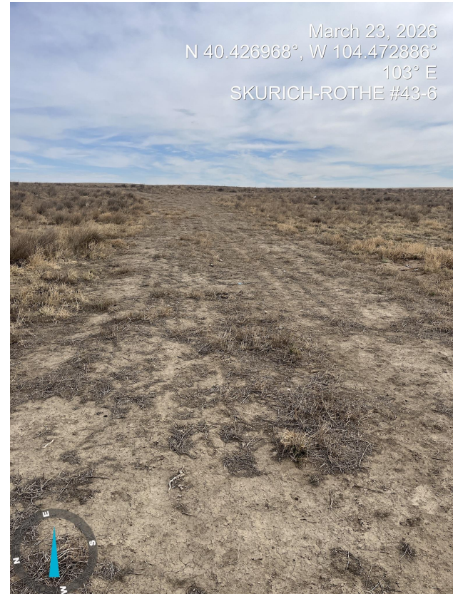
Photo 8. From the access road, facing east, the well location is approximately 30 feet west of the photo location. Road has a small amount of desirable vegetation establishment, but is mostly bare soil.