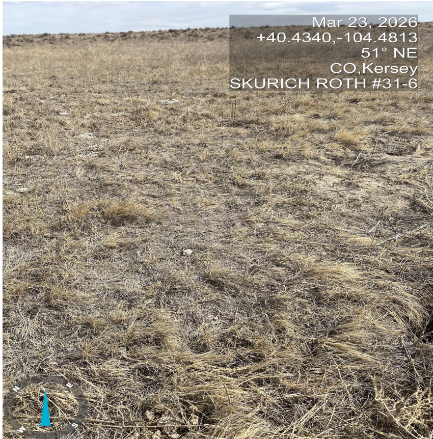
Photo 3. Photo taken north of main lease road facing northeast, Showing reference are for road.