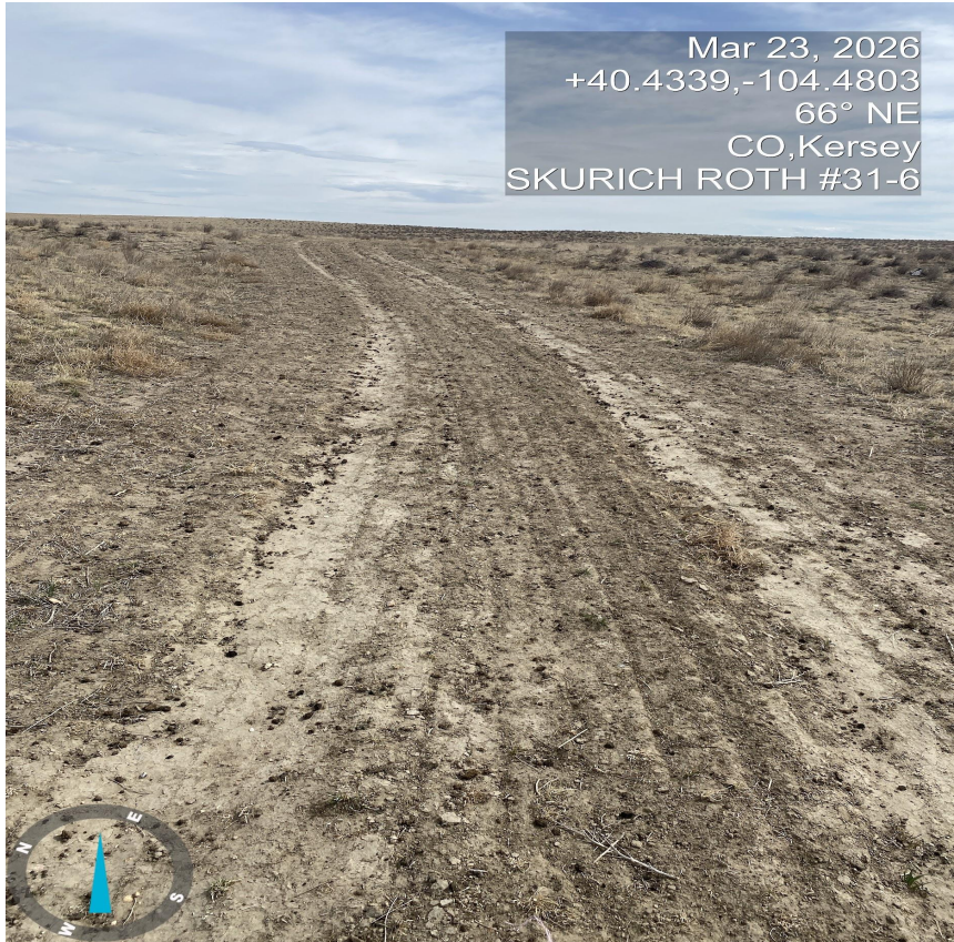
Photo 5. Photo taken from the main lease going west to east, facing northeast. See comment under photo 4.