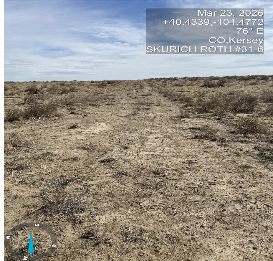
Photo 12. Photo taken from the location access road, facing east, showing that most of the road is bare soil.