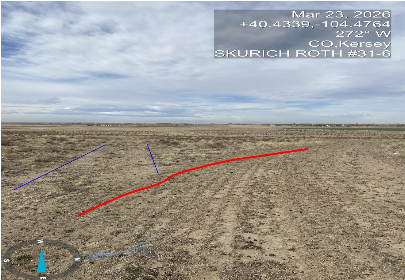
Photo 13. Photo taken at the point where the secondary access road intersects the main lease road. To the right of the red line is the main lease road and the location access road is outlined by the two blue lines. Both roads have significant bare soil, and more work is needed to meet final reclamation standards. Work was recently completed on the main lease road but not on access road to well location.