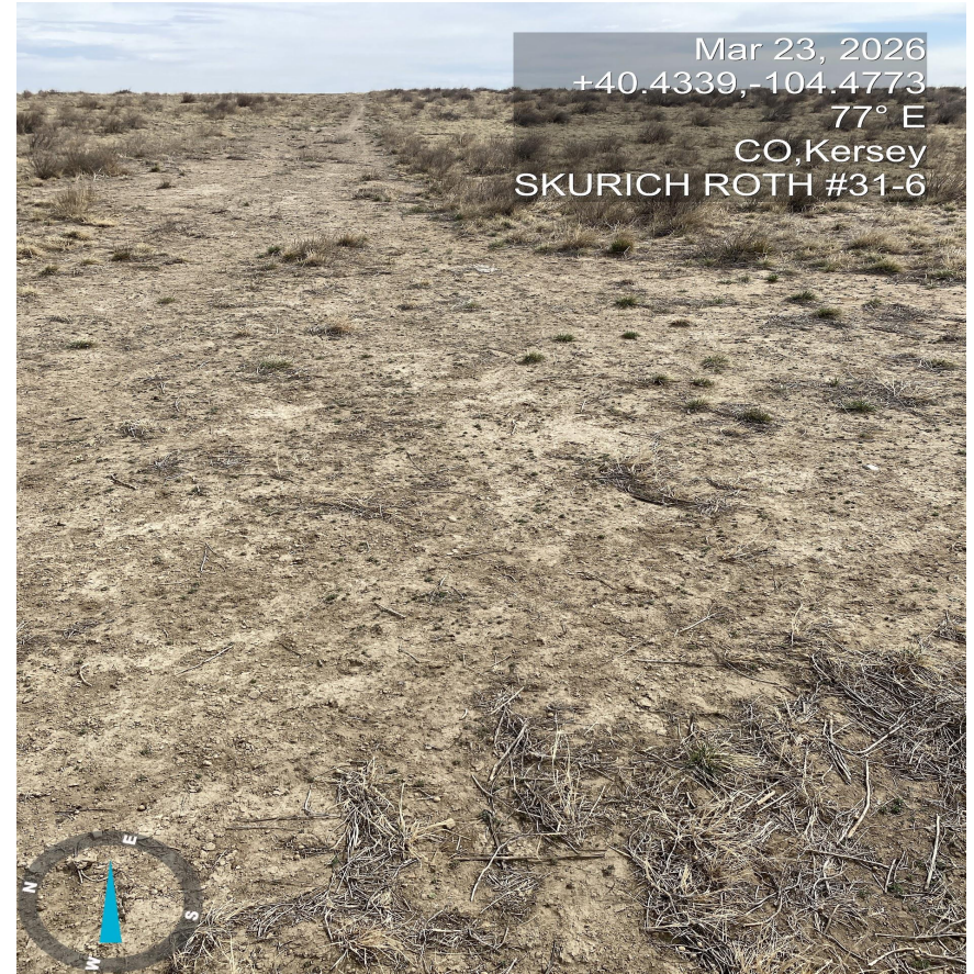
Photo 8. Photo taken from the location facing east showing bare soil on the location and the location access road.