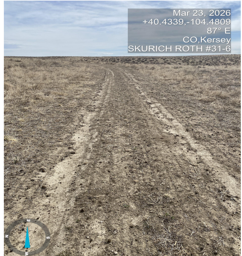
Photo 4. Photo taken from the main lease going west to east, facing northeast, showing bare soil. Some drill seeding was performed, and manure was spread on the main lease road. The majority of the road is comprised of bare soil, and more work is needed to meet final reclamation standards.