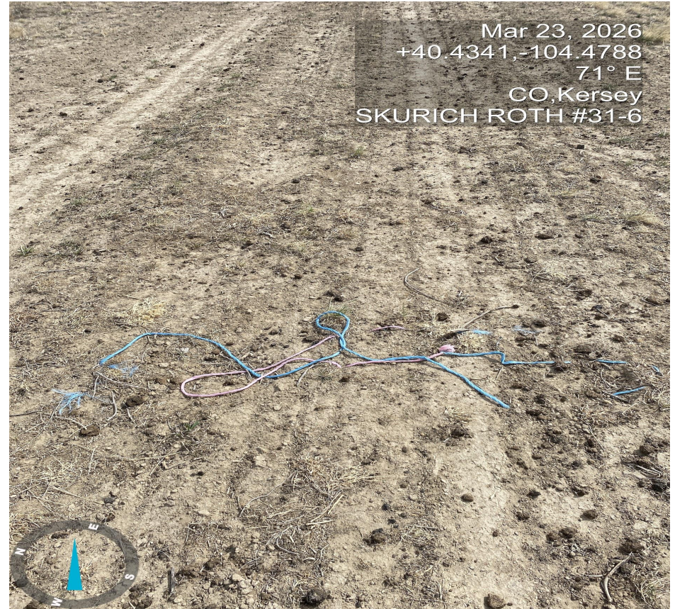
Photo 6. Photo taken from the main lease going west to east. See comment under photo 4. Baling twine from reclamation activities was found throughout the access road.