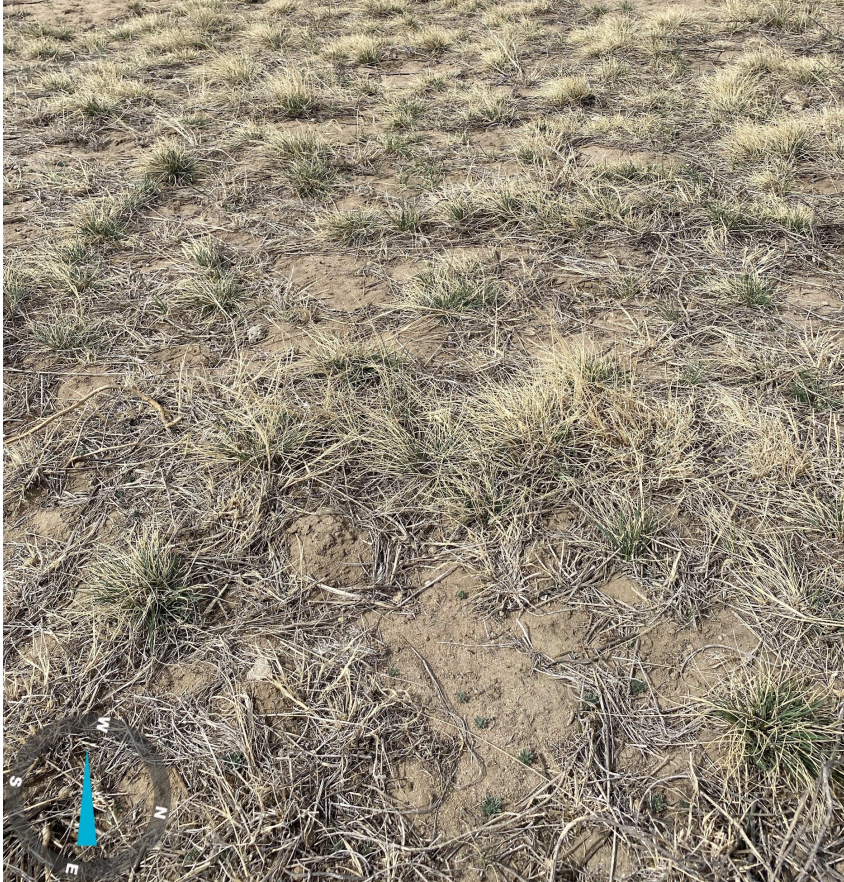
Photo 11. Photo taken from the western edge of the disturbance area facing west, showing the reference area with desirable grass species growing.