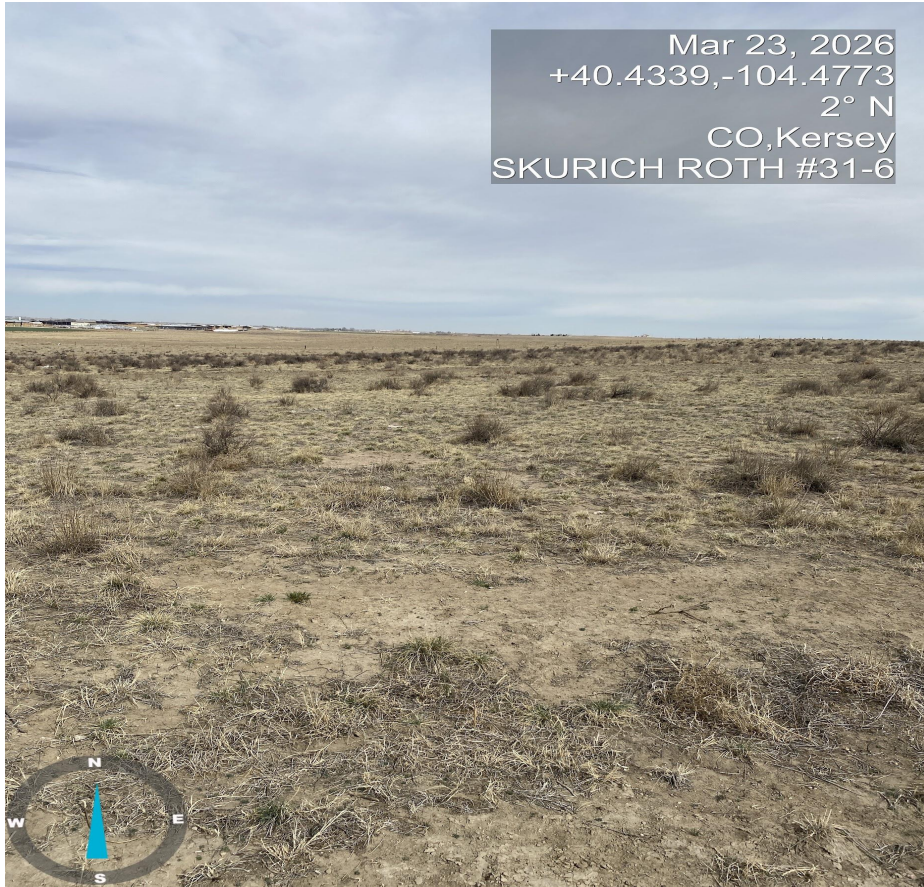
Photo 7. Photo taken from location facing north, showing growth of some desirable grass species as well as bare soil present on disturbance area.