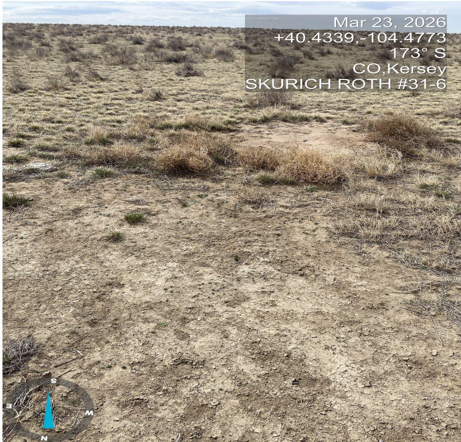
Photo 9. Photo taken from the location, facing south, showing bare soil in the foreground; in the mid-ground, a small number of undesirable weed species; and in the background, desirable vegetation growth.