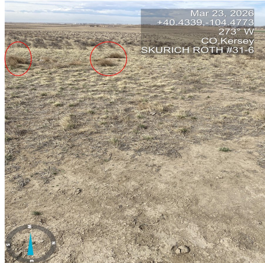
Photo 10. Photo taken from the location facing west shows bare soil as well as some desirable grass species growing. Some undesirable weeds are present, highlighted in the red circle.