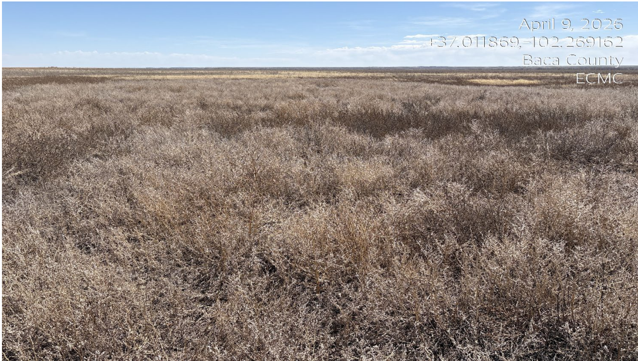
Photo 1. Center of the location facing east. The location consists of tall undesirable weeds ( Kochia, Russian thistle).