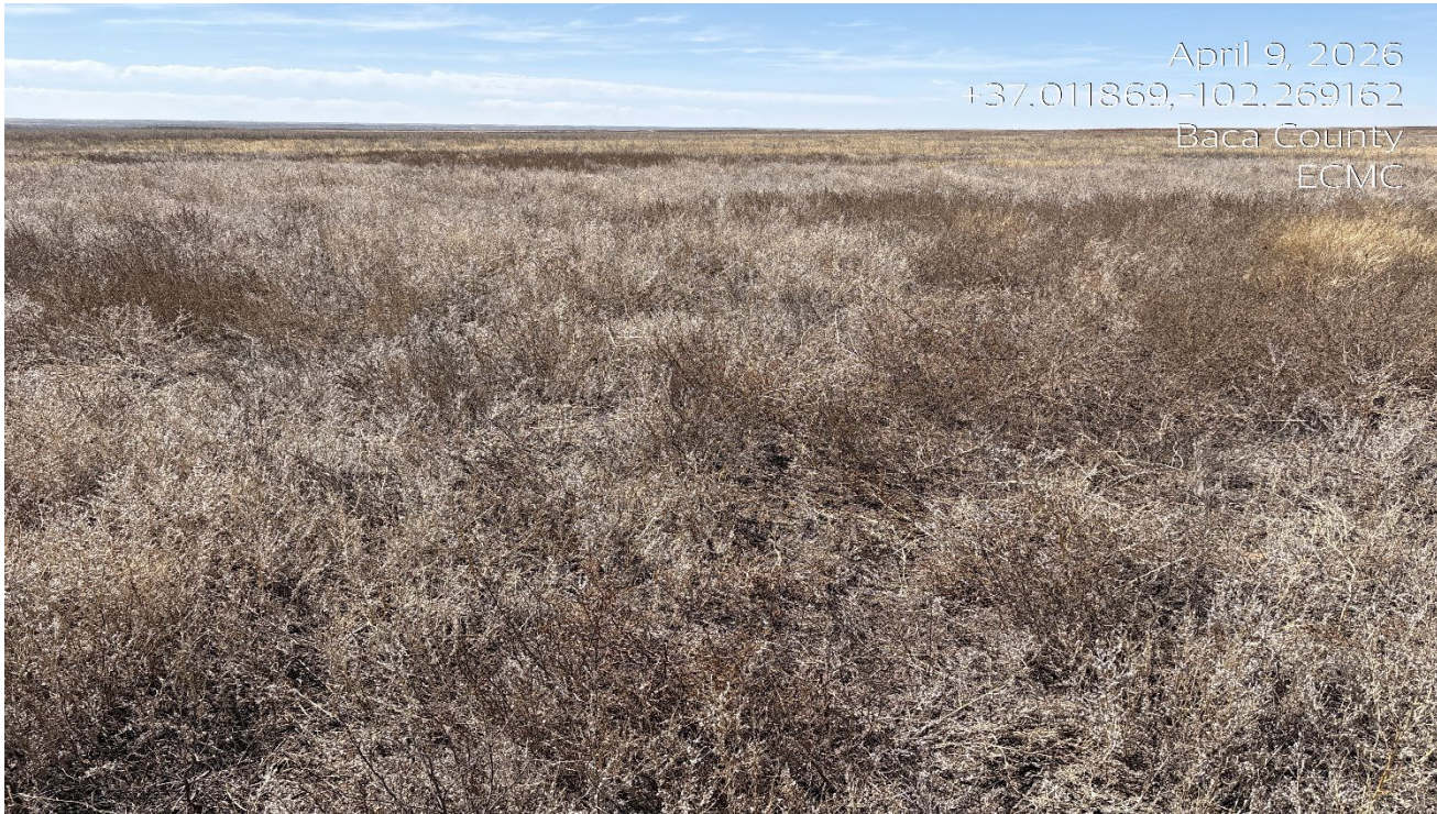
Photo 4. Center of the location facing south. The location consists of tall undesirable weeds ( Kochia, Russian thistle).