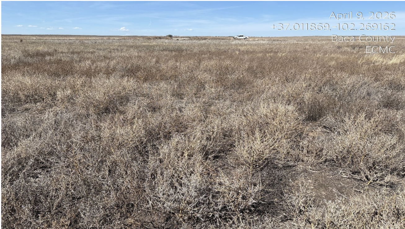
Photo 3. Center of the location facing west. The location consists of tall undesirable weeds ( Kochia, Russian thistle).