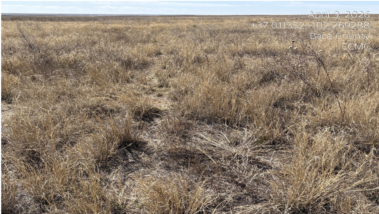
Photo 5. Facing south outside of the location toward the surrounding CRP pasture which consists of native Sand drop seed, Blue grama, Big bluestem grasses.