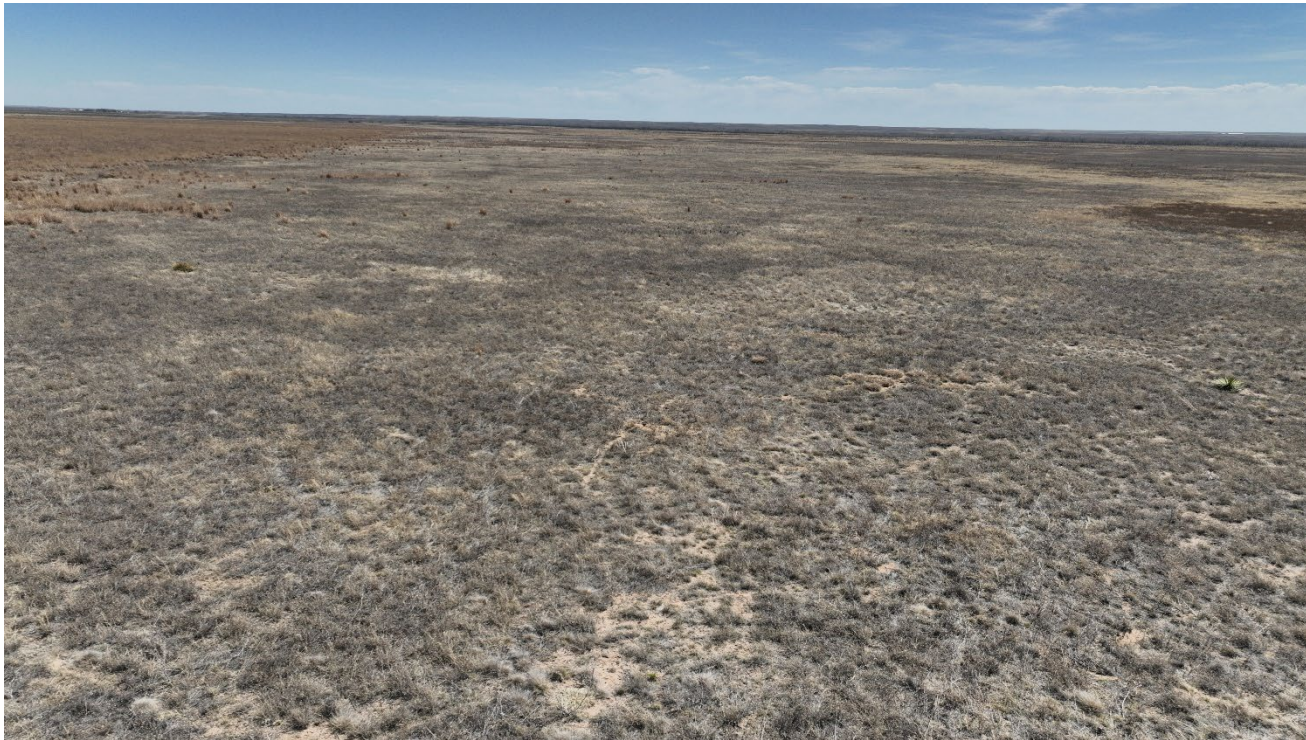
Photo 8. Drone aerial photo facing east outside of the location toward the surrounding CRP pasture which consists of native Sand drop seed, Blue grama, Big bluestem grasses.