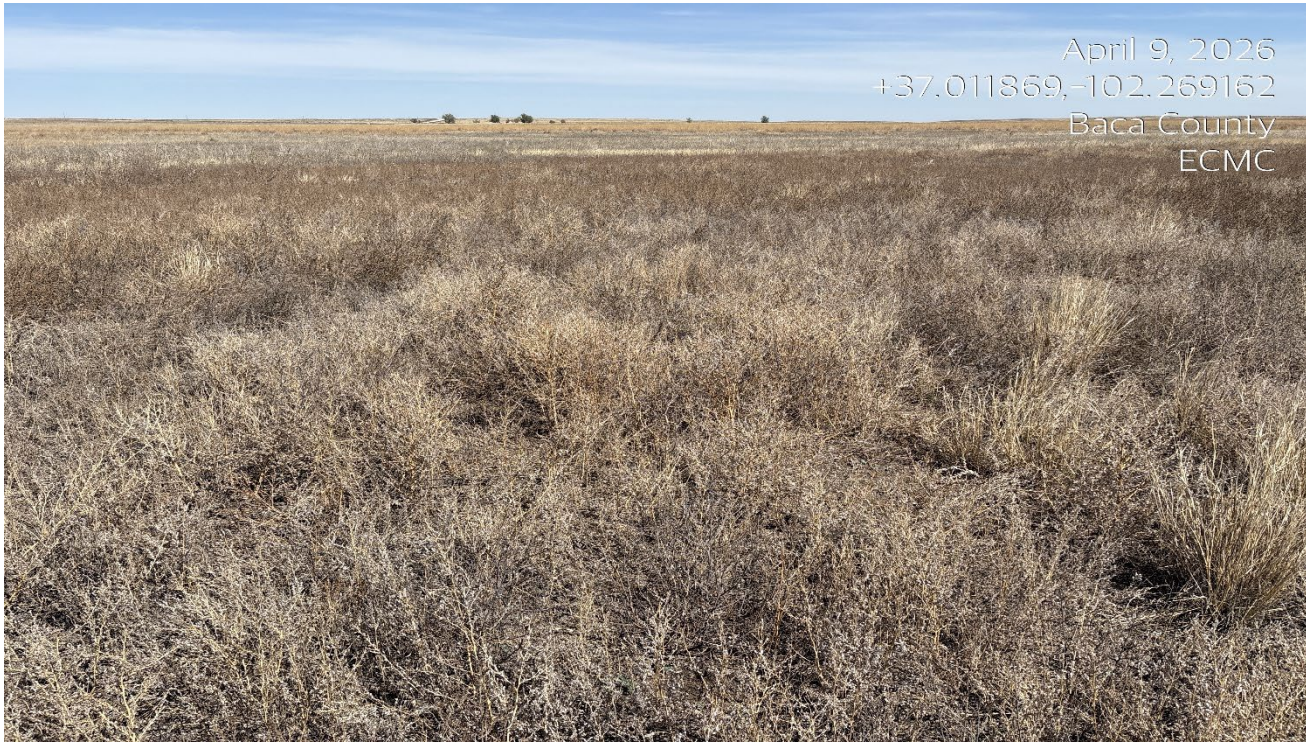
Photo 2. Center of the location facing north. The location consists of tall undesirable weeds ( Kochia, Russian thistle).