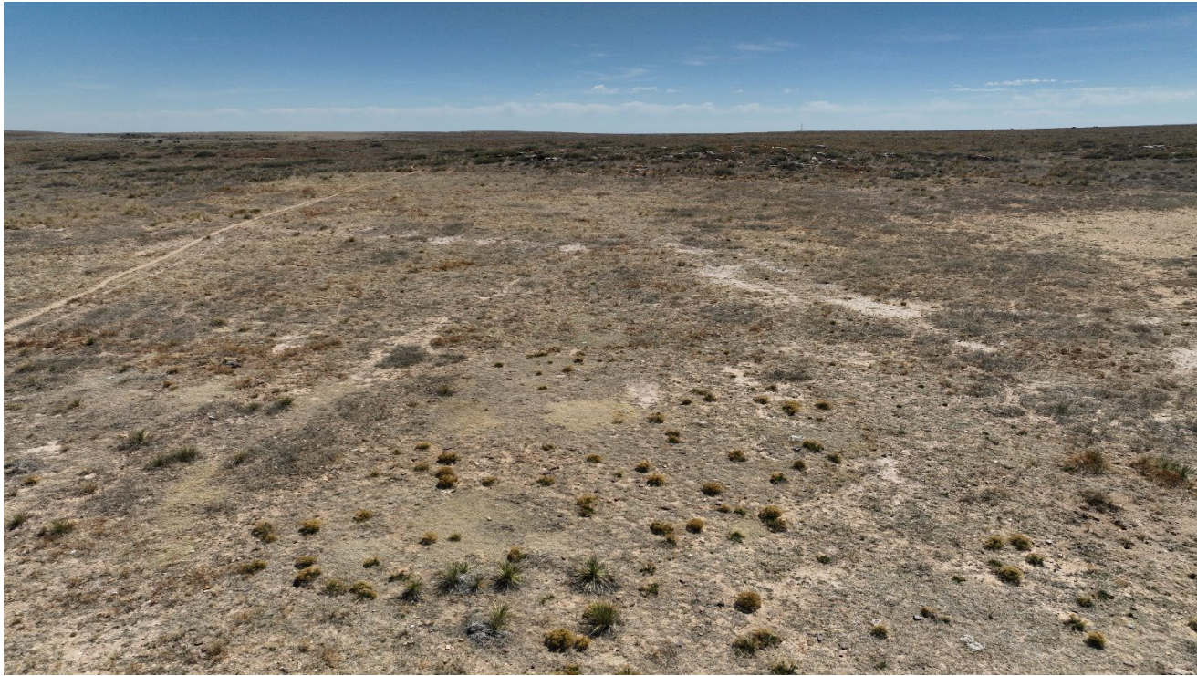
Photo 4. Drone aerial photo facing east toward the location. The location has been recontoured and reclaimed.