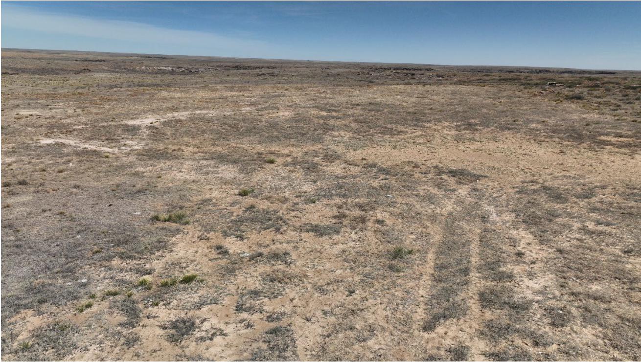
Photo 3. Drone aerial photo facing east toward the location.