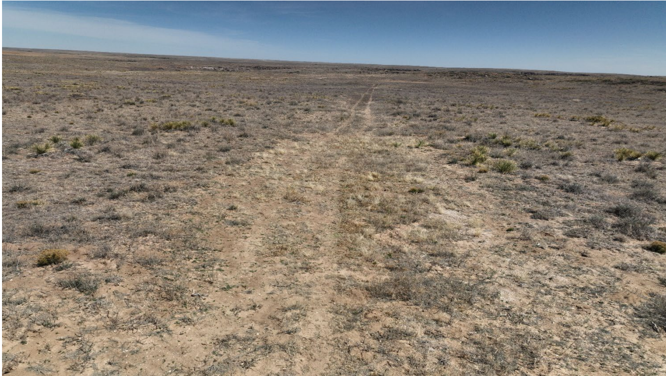
Photo 2. Drone aerial photo along the former access road. The road has been recontoured and reclaimed.