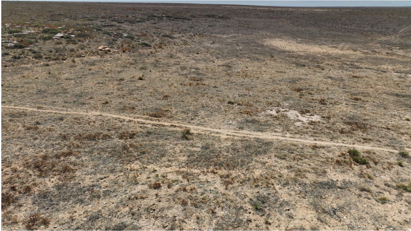
Photo 6. Drone aerial photo facing southwest at the location. It appears perennial vegetation is establishing.