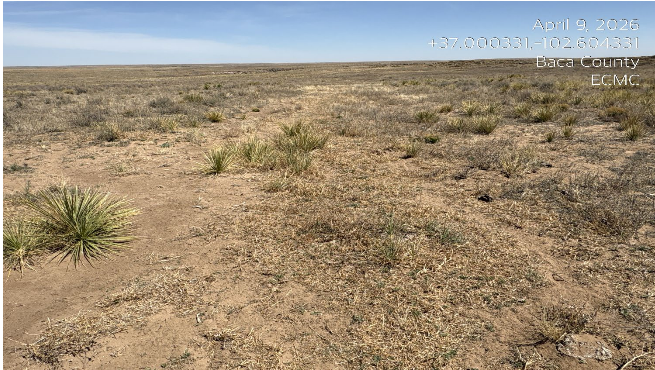
Photo 1. Facing east at the beginning of the reclaimed access road.