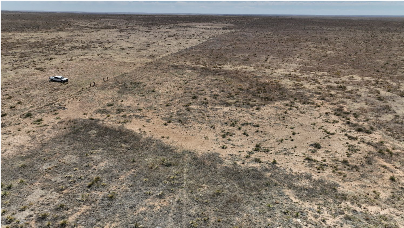
Photo 4. Drone aerial photo facing south toward the location.