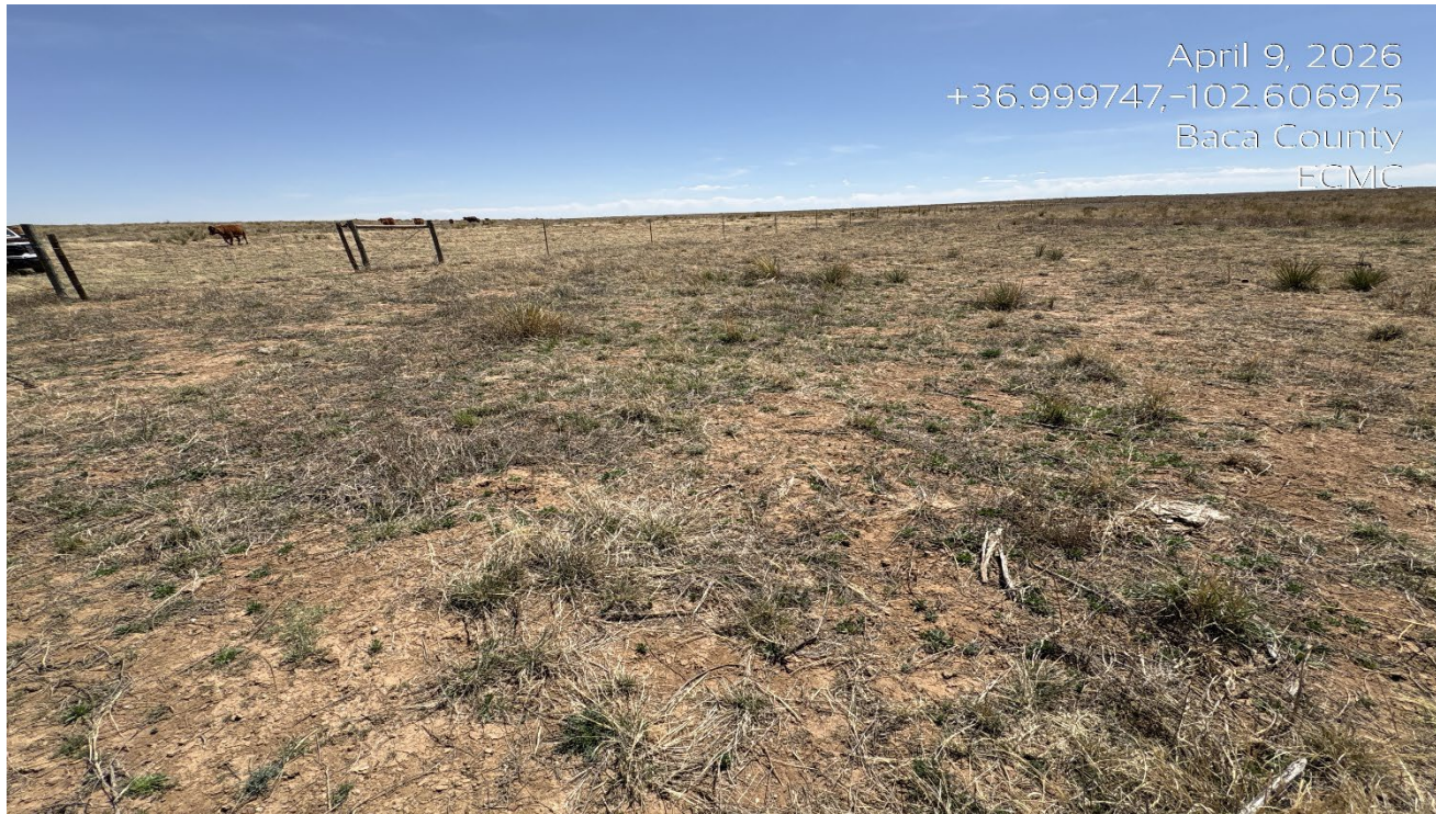
Photo 2. Center of the location facing south.