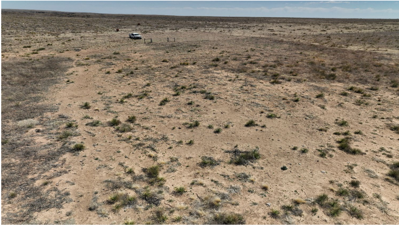
Photo 5. Drone aerial photo facing southeast at the location. This area is slowly revegetating but could benefit from additional reseeding.