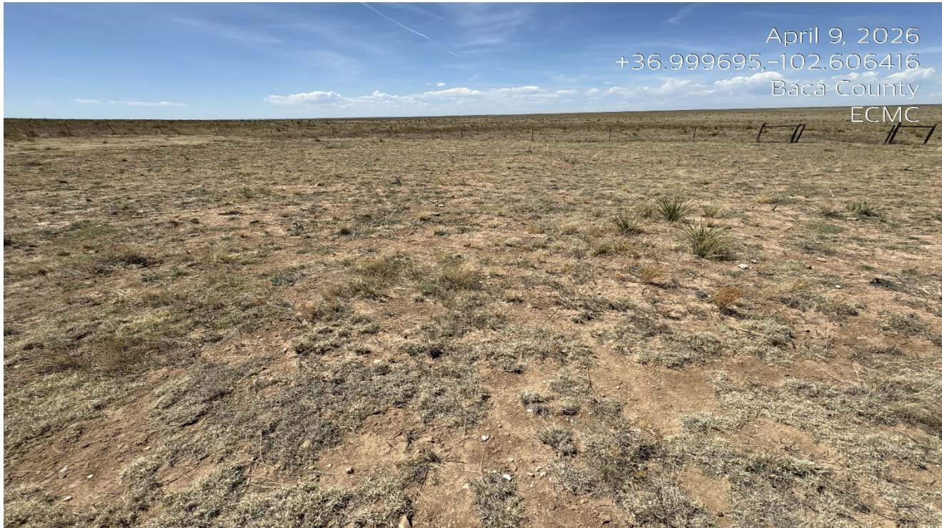
Photo 1. Facing west toward the location. This area of the location is revegetating very well.