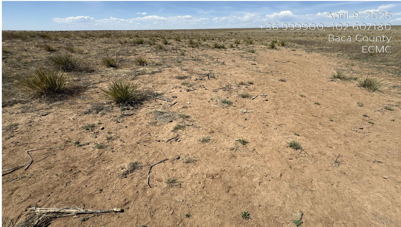
Photo 3. Facing toward the northwest side of the location. This area is slowly revegetating but could benefit from additional reseeding.