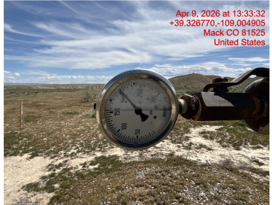
Wellhead Pressure Gauge – Photo #03499