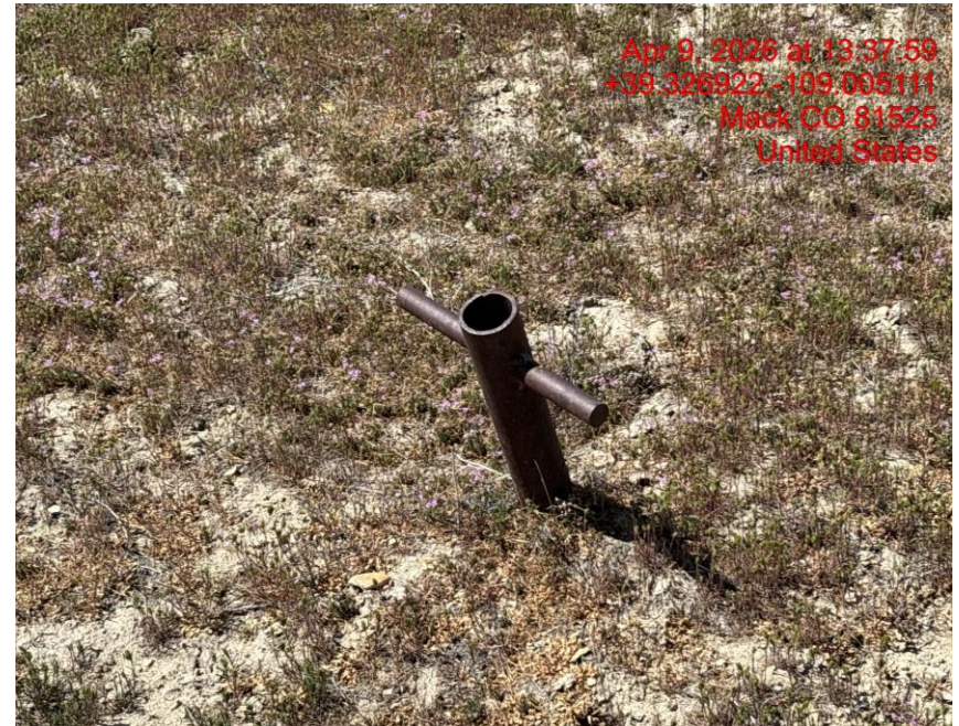
Unmarked Deadman – Photo #03509