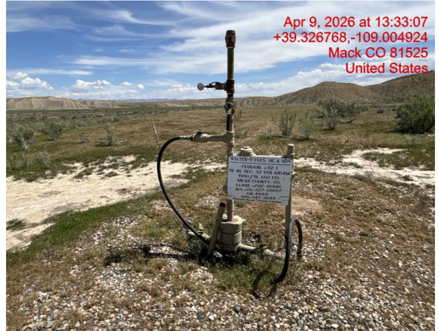
Location/Weeds – Photo #03496