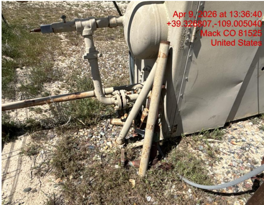
Stored Supplies – Photo #03505