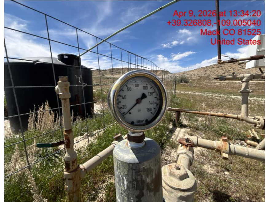
Downstream Pressure Gauge on Separator – Photo #03502