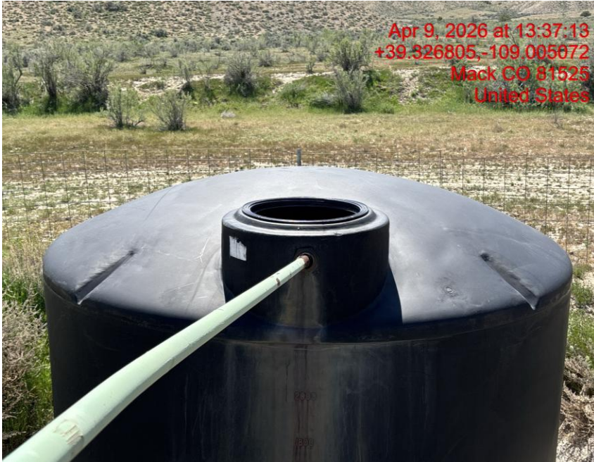
Missing Tank Cover/Wildlife Entry Hazard – Photo #03507