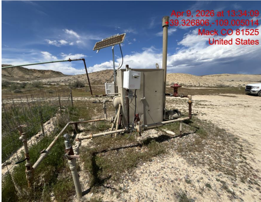
Location/Weeds – Photo #03501