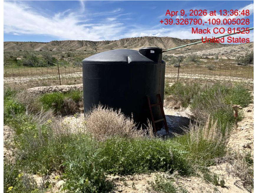
Location/Weeds – Photo #03506