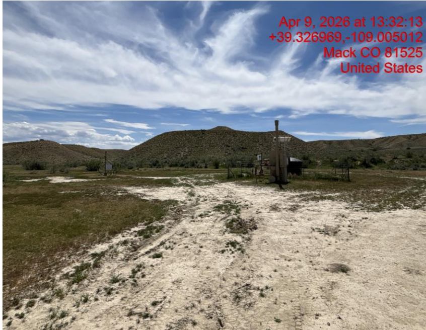
Location Overview – Photo #03495