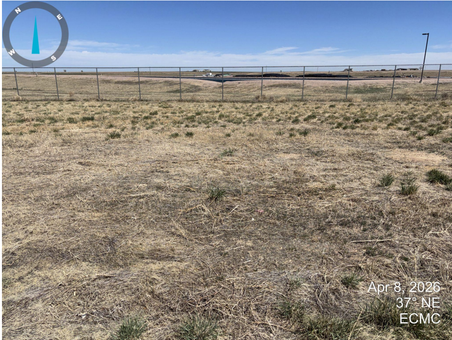
Photo 3. Looking northeast across the tank battery area. See photo 2 comments.