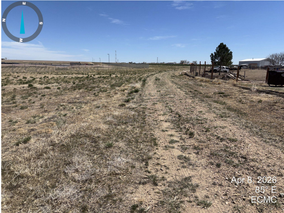
Photo 1. Looking east down the main access road. This access road appears to be preexisting to oil and gas development.