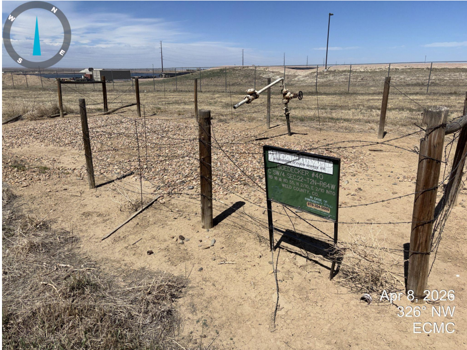
Photo 5. Looking north across the west side of the well location. It appears that production equipment was located in this area. A fence, sign, pipe riser, and heavy gravel remain on location.