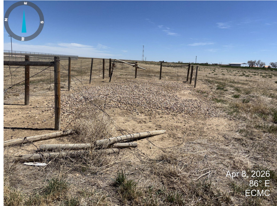
Photo 6. Looking east across the well location. There is desirable perennial vegetation surrounding the remaining equipment. The area within the remaining fence is bare ground or gravel.