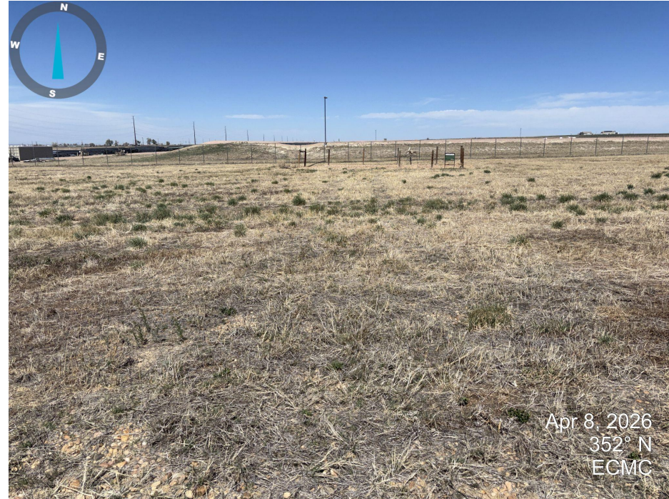
Photo 4. Looking north north down the former access road to the well area. Desirable perennial vegetation is present on the access road.