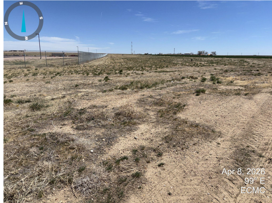
Photo 2. Photo taken approximately 1000 ft west of the well location along the access road at the tank battery location. There is less desirable vegetation establishment on the tank battery area than the surrounding reference area.