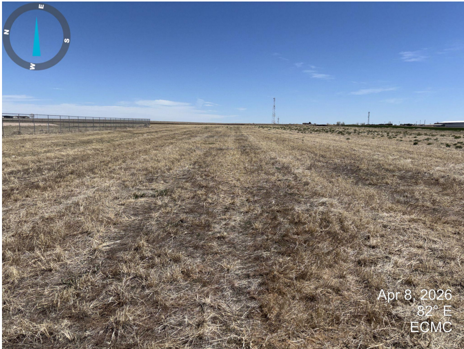
Photo 7. Reference vegetation to the east of the well location.