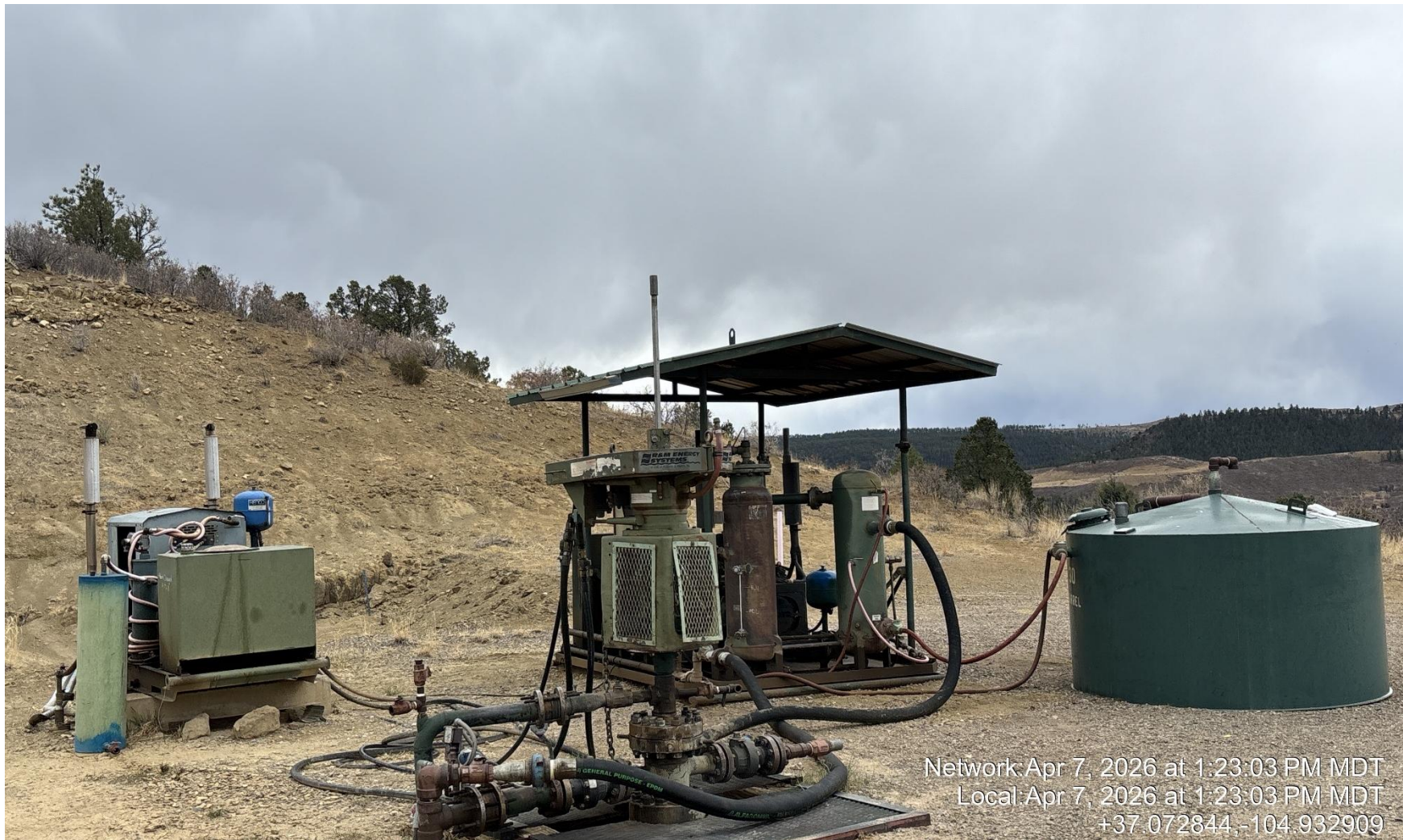
PHOTO 4: WELLHEAD AND EQUIPMENT. Vacuum pump observed on well without ECMC approval. Provide ECMC with documentation showing approval of use of vacuum pump PER RULE 432. CA DATE 4/23/2026.