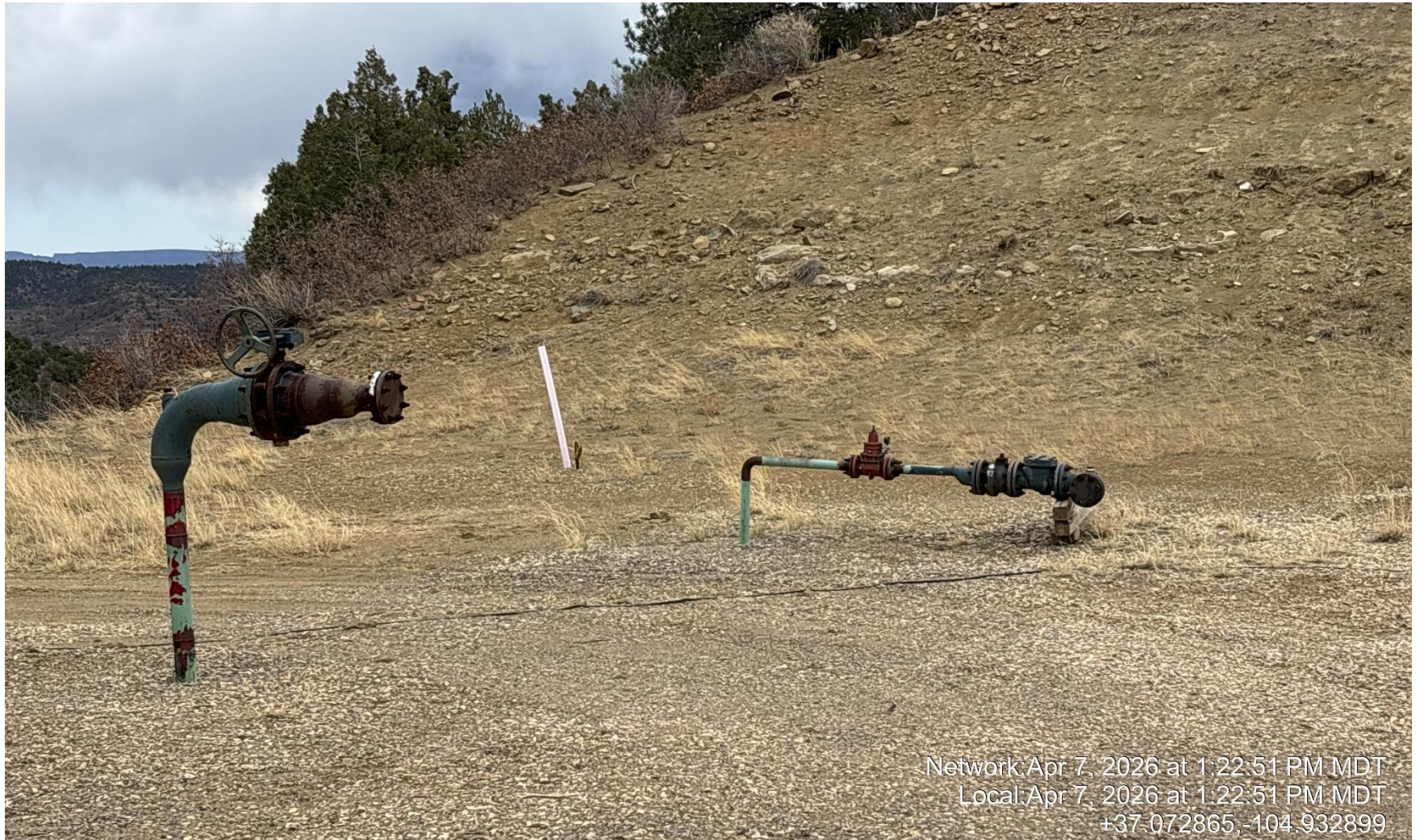
PHOTO 5: UNUSED EQUIPMENT (1-3" RISER AND 1-2" RISER NOT IN USE OR MARKED). REMOVE RISERS IF THEY NOT IN USE OR USEFUL OR MARK RISER W/ A PERMANENT SIGN OR STICKER SHOWING WHAT IT IS USED FOR PER RULE 606. CA DATE 4/23/2026.