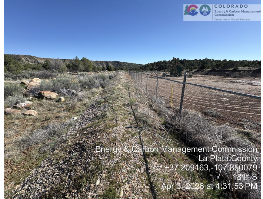
17. Location perimeter berm.