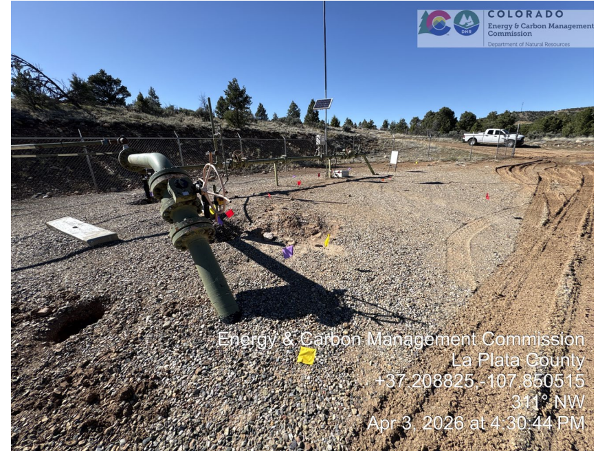
15. Chain link fence on west edge of pad. Unused fence gate segment.