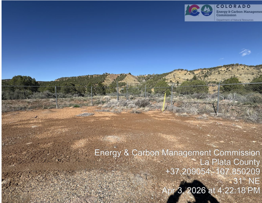
3. Pile of vegetative debris in NE corner of well pad piled against corner of fence.