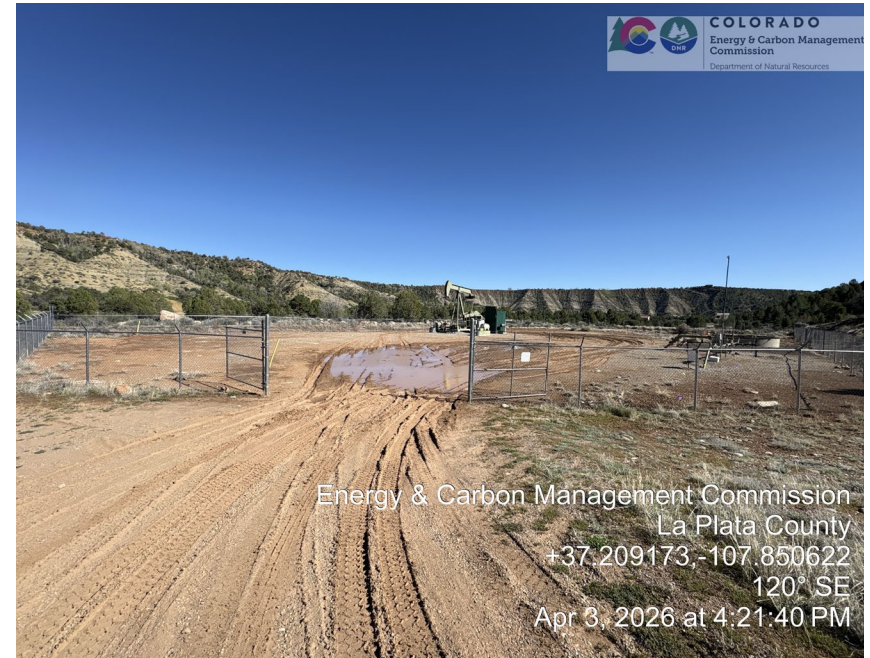
1. Well location sign.