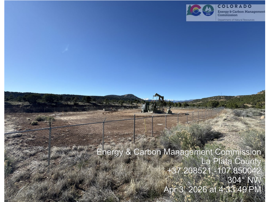
19. Location perimeter berm.