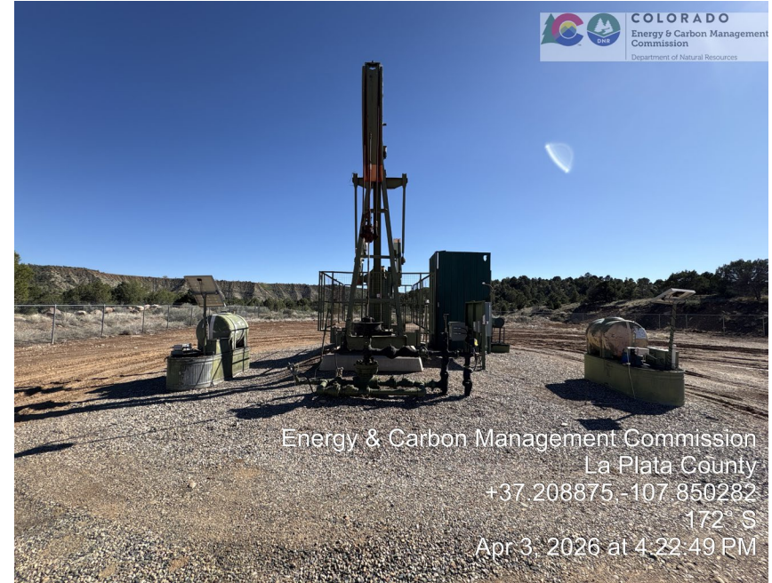
4. Pump jack, wellhead, chemical treatment tanks over secondary containment.