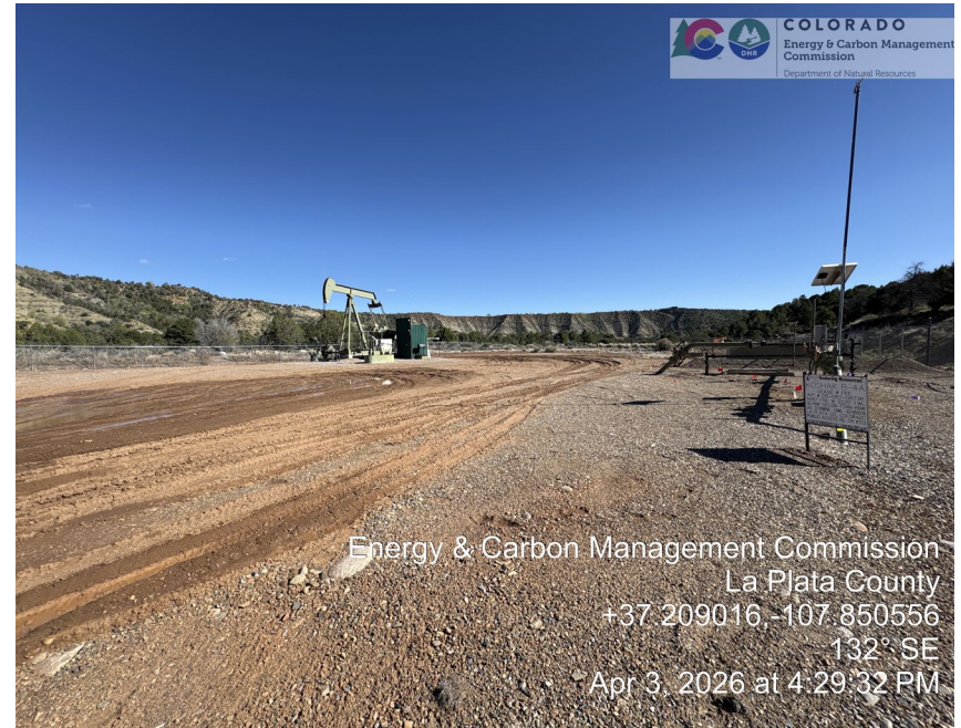
13. Meter calibration card dated 1/15/2026.