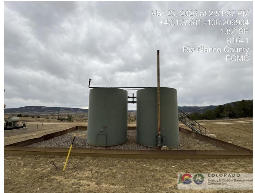
Photo # 3682 Illegible tank label/Operator name is illegible and contact number is disconnected

Photo # 3685 Secondary containment is not sufficiently impervious to contain spilled or released materials (No liner installed)