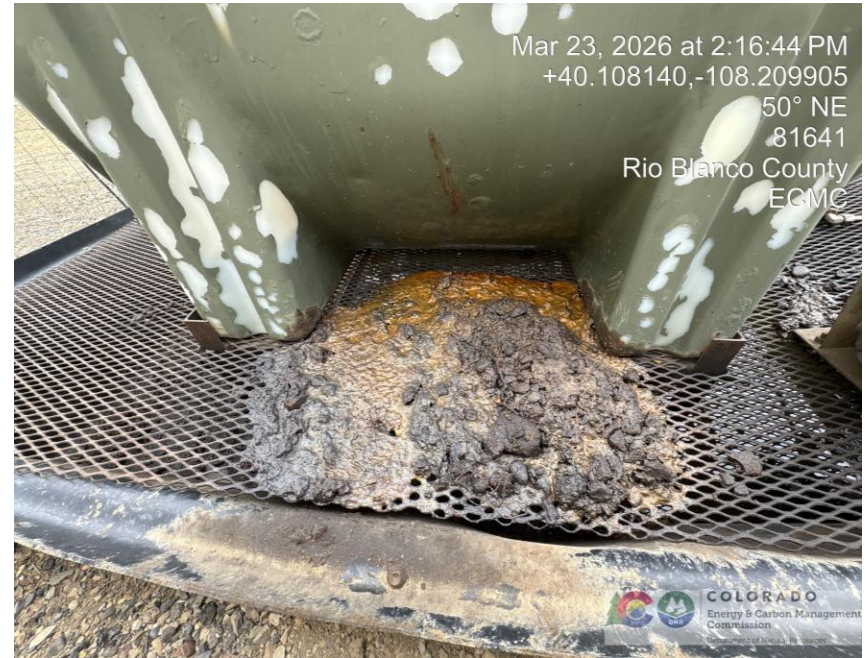
Photo # 3654 Oily waste placed on top of chemical containment grate