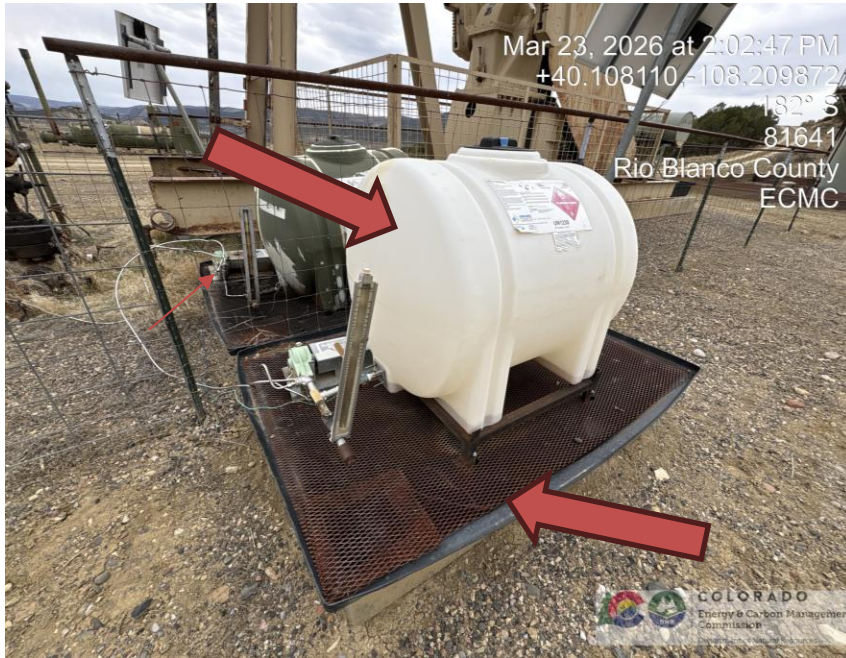
Photo # 3644 Unused chemical tank and containment on location/not in service and disconnected