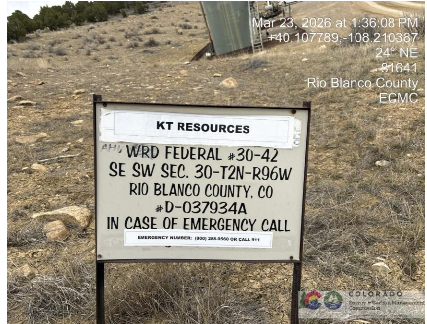
Photo # 3627 Well name on sign at entrance to location does not match database or wellhead sign