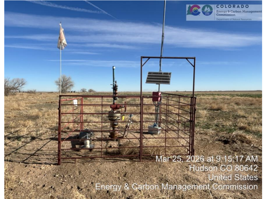
Photo 2 well head and equipment