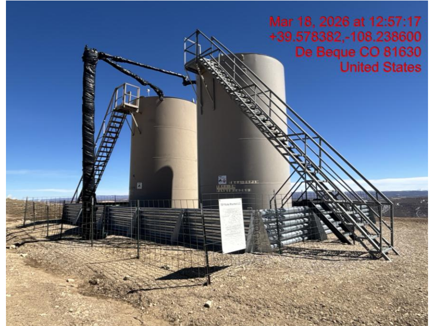
Location – Photo #03191