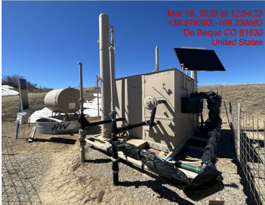
Location – Photo #03183