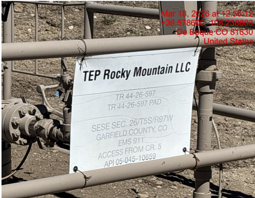
Weathered/Illegible Wellhead Sign – Photo #03187