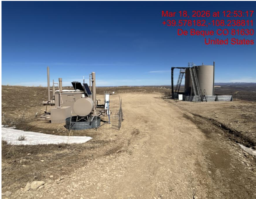
Location Overview – Photo #03182