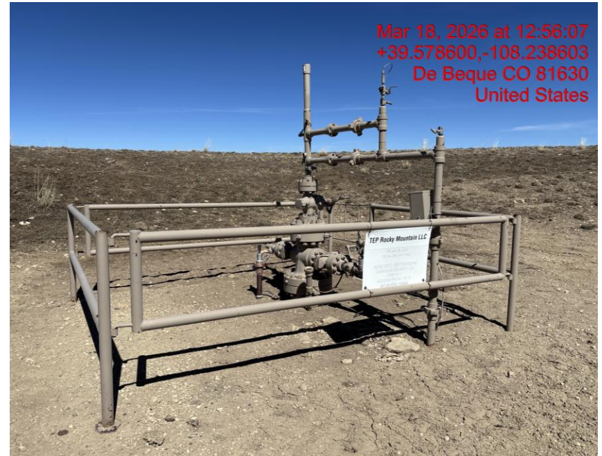
Location – Photo #03186