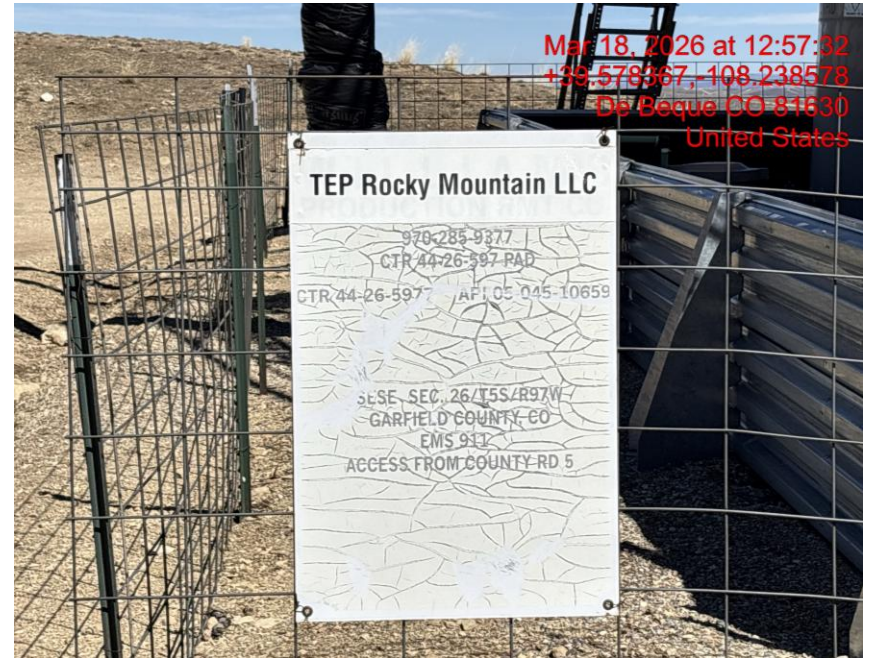
Weathered/Illegible Battery Sign – Photo #03192