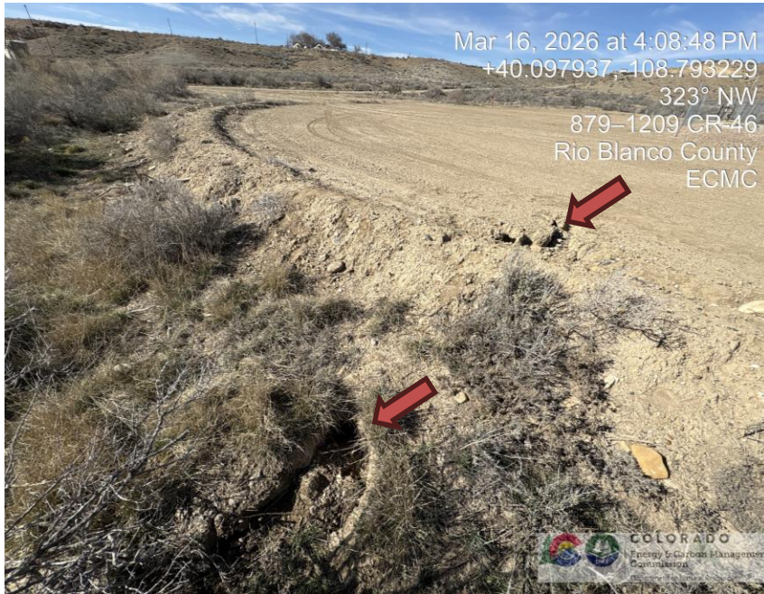
Photo # 3199 Failure to minimize erosion & transport of sediment on SW corner of location/berm needs maintenance