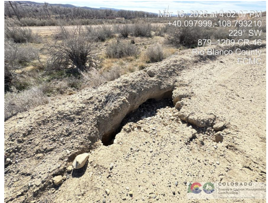
Photo # 3189 Failure to minimize erosion & transport of sediment on SW corner of location/berm needs maintenance