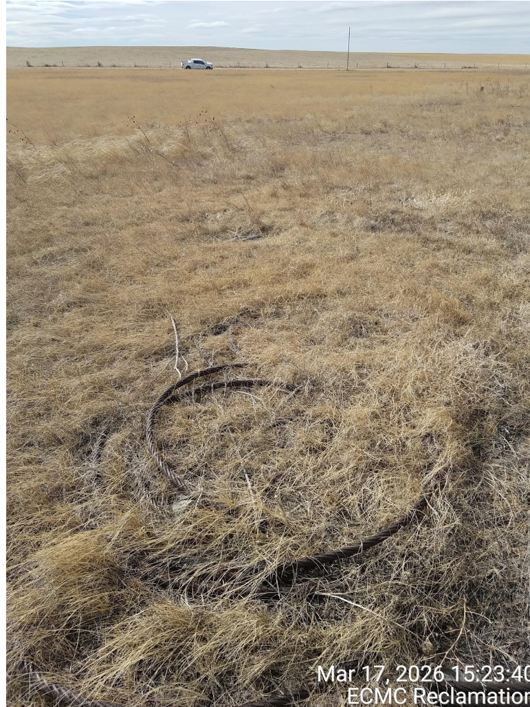
Photo 2. Photo illustrates cable wire, which is ~90 yards northwest of the DA well.

Inspection Photos Location Name: STATE 60-4325 #1 Location ID: 405071