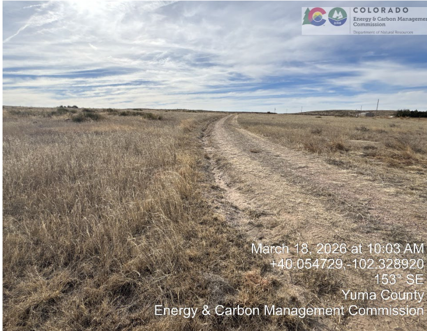
2 track erosion