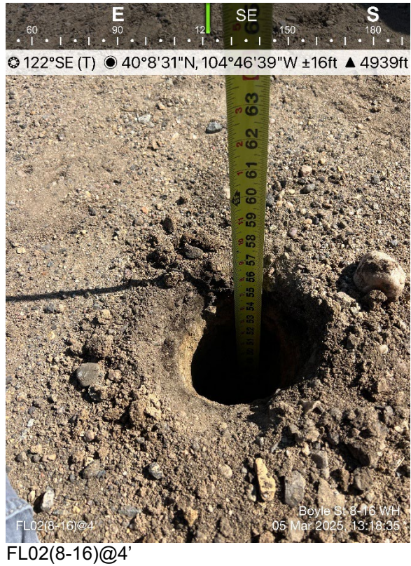
PHOTO LOG BOYLE ST 8-16 WELLHEAD WELD COUNTY, COLORADO KERR-MCGEE OIL & GAS ONSHORE, LP