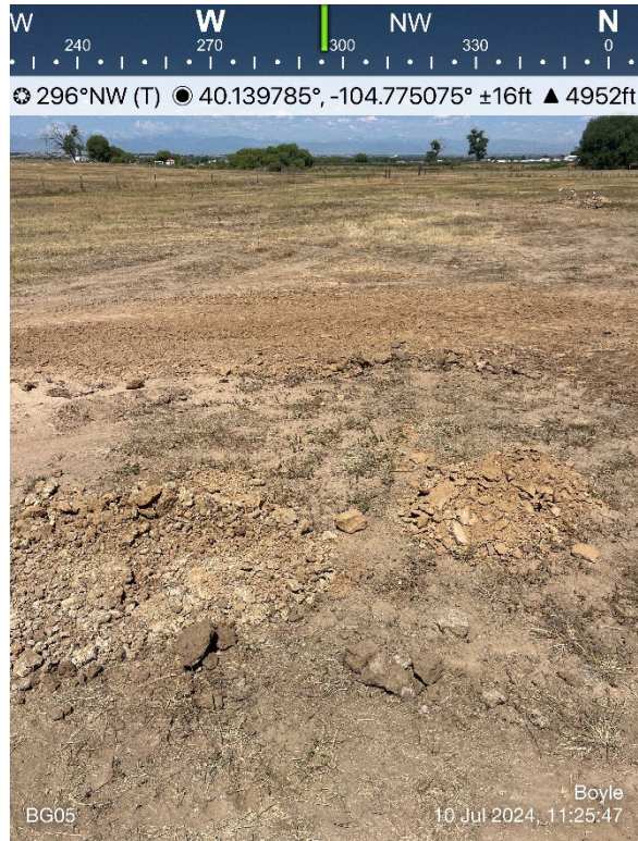
Background Sample Location BG05