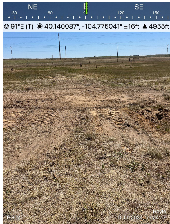
Background Sample Location BG02