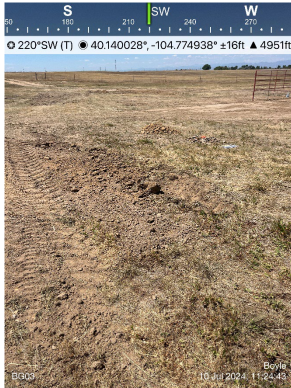
Background Sample Location BG03