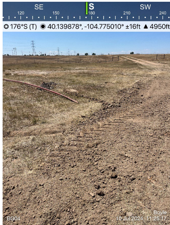
Background Sample Location BG04