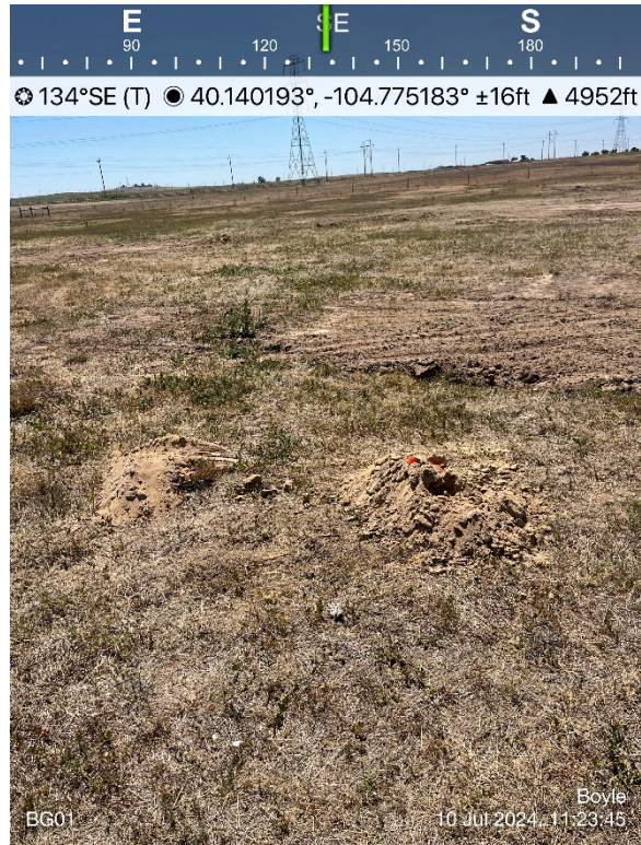
Background Sample Location BG01