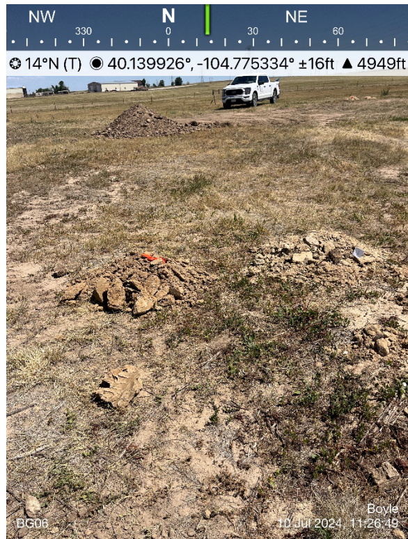
Background Sample Location BG06