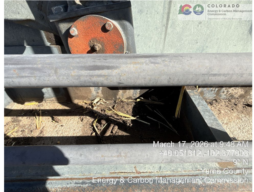
Meter run, PU, and Wellhead