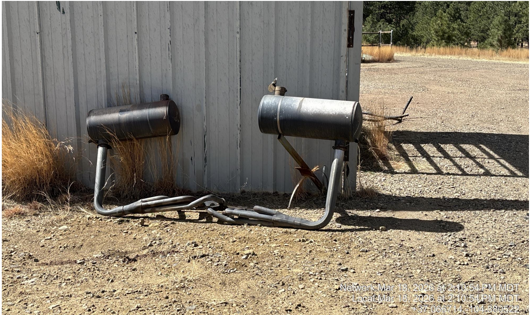
PHOTO 10: UNUSED EQUIPMENT (2 PRIME MOVER HEADERS). REMOVE UNUSED EQUIPMENT PER RULE 606. CA DATE 3/24/2026.