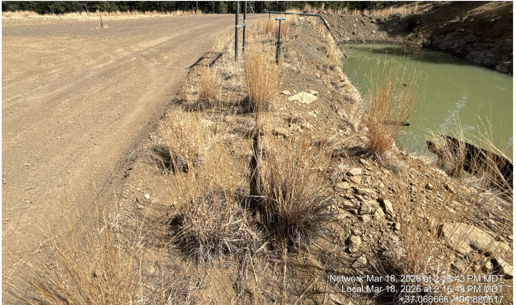
PHOTO 8: UNUSED EQUIPMENT (PIPE ON EDGE OF PIT). REMOVE UNUSED EQUIPMENT PER RULE 606. CA DATE 3/24/2026.