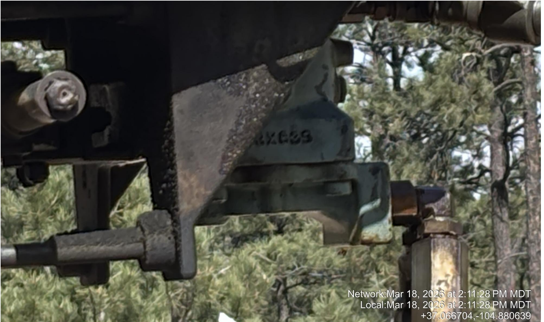
PHOTO 6: LEAKING DRIVEHEAD. COMPLY WITH RULE 1002,.(2).D. THIS IS THE SECOND NOTICE FOR THIS CA, IMMEDIATE ACTION IS REQUIRED.