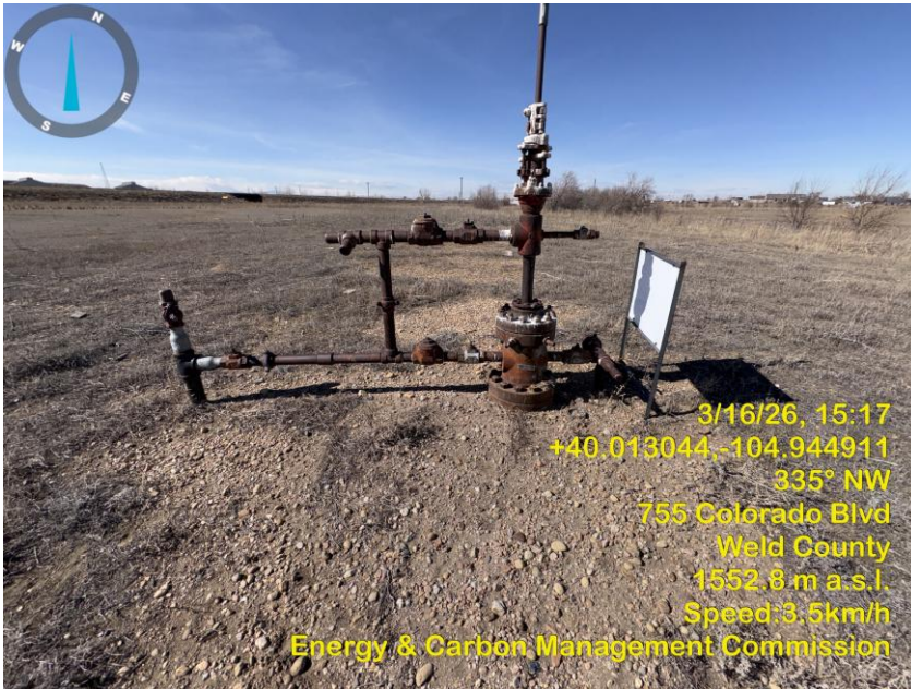
Photo 5 Wellhead.