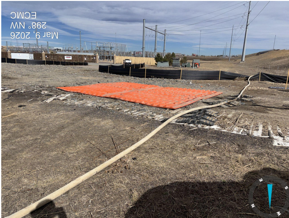
Photo 1. Trackpads are installed on top of existing electric substation BMPs. A water hose for nearby construction is present and unprotected.