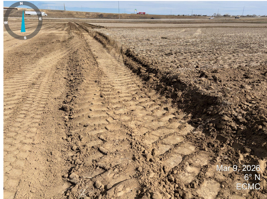
Photo 8. It appears that approximately 10 inches of topsoil was salvaged in this area.