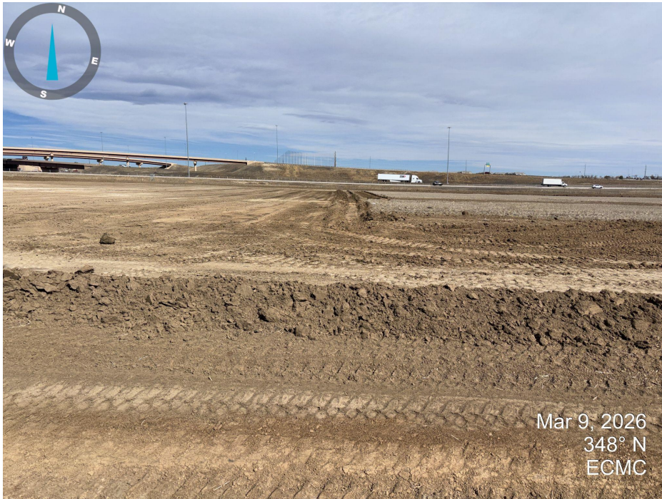
Photo 7. photo taken from the south side of the location looking north across the location. Topsoil was being salvaged at the time of inspection.