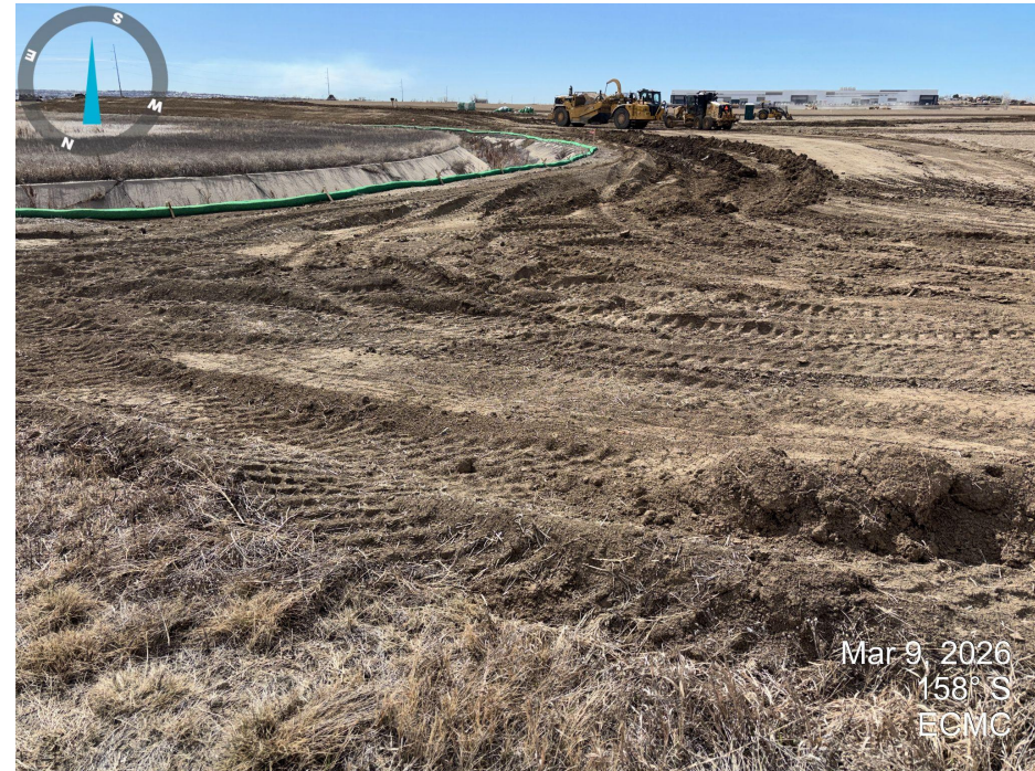
Photo 12. Looking south across the same northeast corner.