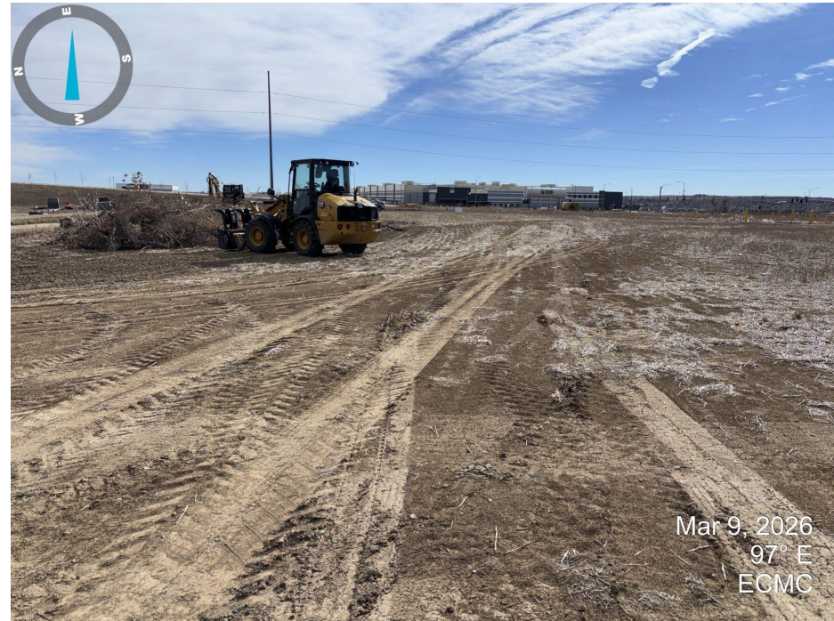
Photo 4. Looking east towards the entrance and proposed bridge area. Crews were clearing trees at the time of inspection. It did not appear that construction on the bridge had begun at the time of inspection.