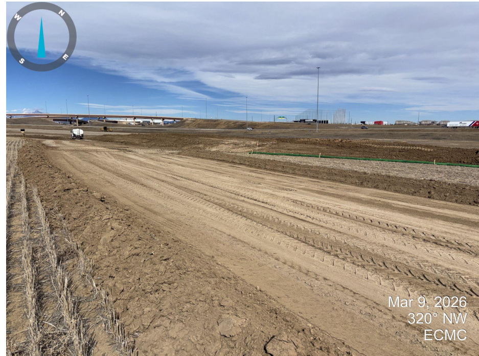
Photo 6. Looking northwest across the location. Topsoil was being salvaged at the time of inspection.