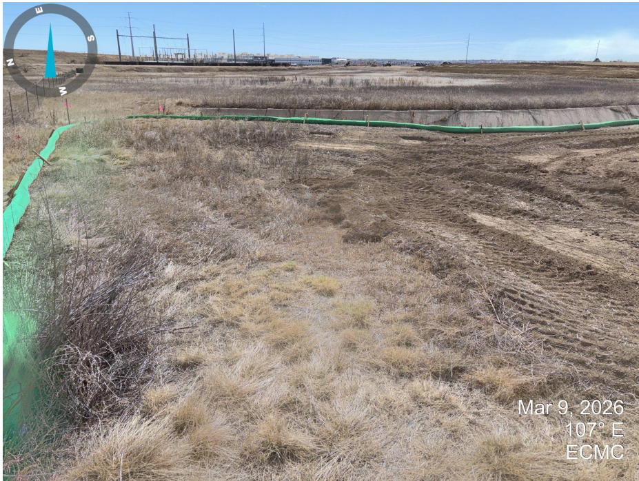
Photo 11. Picture taken at the northeast corner of the location. This area has a filtex waddle installed around it. No additional BMPs were constructed at the time of inspection. It appears this is the low/water accumulation area for most of the pad.