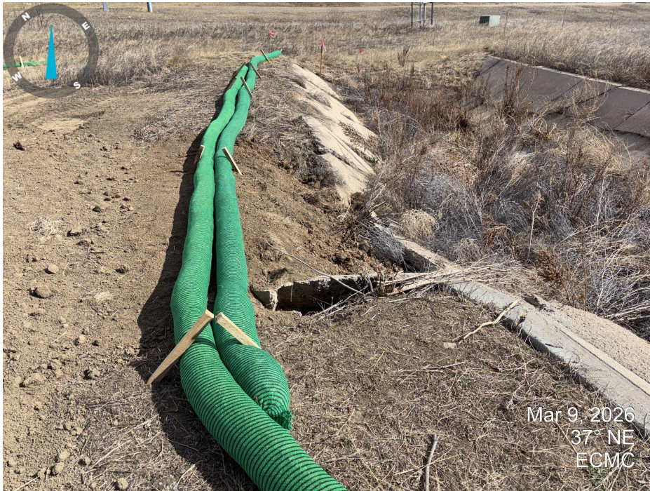
Photo 13. Photo taken at the northeast corner looking north. Filtrex waddles are installed at the edge of the unused portion of the canal. The height difference and low spots along the canal are shown in this photos.