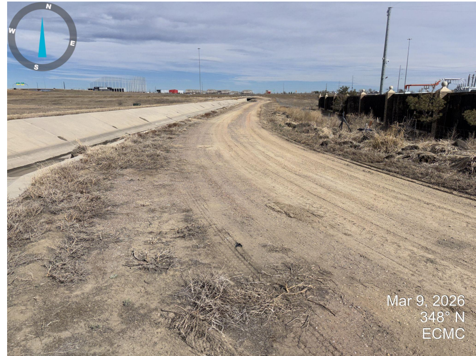
Photo 2. Vehicles are accessing the location via an existing road to the north of the location. The road travels along the active irrigation ditch and crosses near the highway. See photo 17.