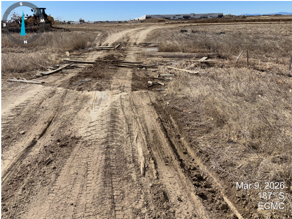
Photo 3. The currently utilized access road crosses an unused ditch section. The crossing is constructed of telephone poles and boards. The crossing is in poor condition.