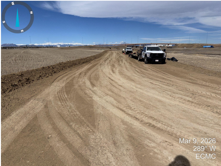
Photo 5. Looking west down the access road towards the well location. It appears that topsoil was salvaged from the access road.