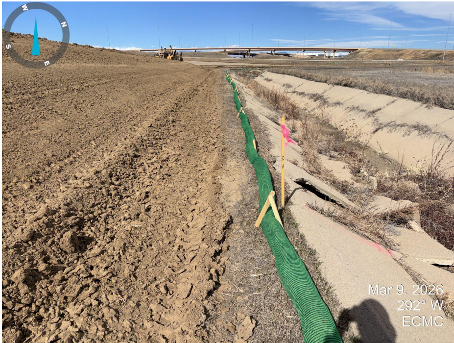
Photo 15. Looking west down the topsoil stockpile. Filtrex wattle is laid over low spots that will allow water and sediment build up/ overflow.