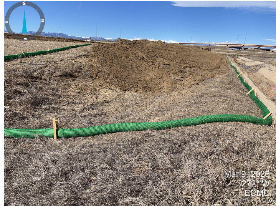
Photo 16. Picture looking west at the east side of the topsoil stockpile. Slope heads northeast .