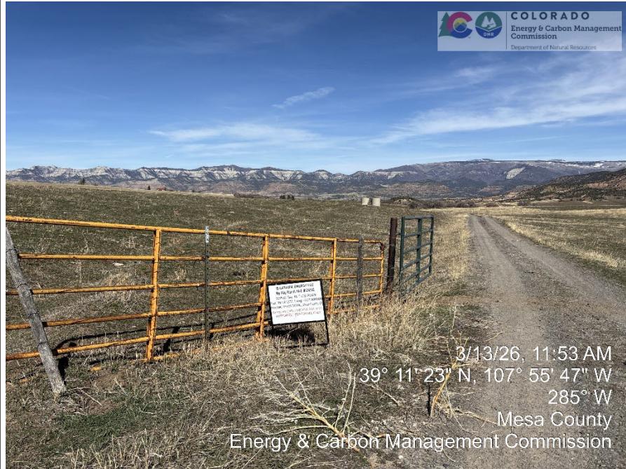
Location entrance with sign

Inspection Date: 3/13/2026 Inspection Doc#: 693809191