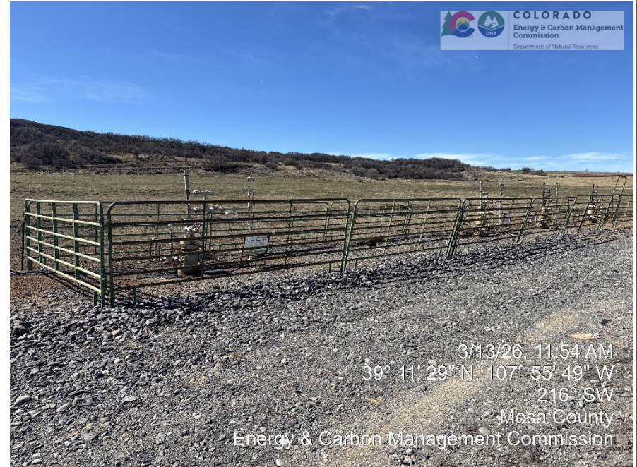
Wellhead with fence and sign