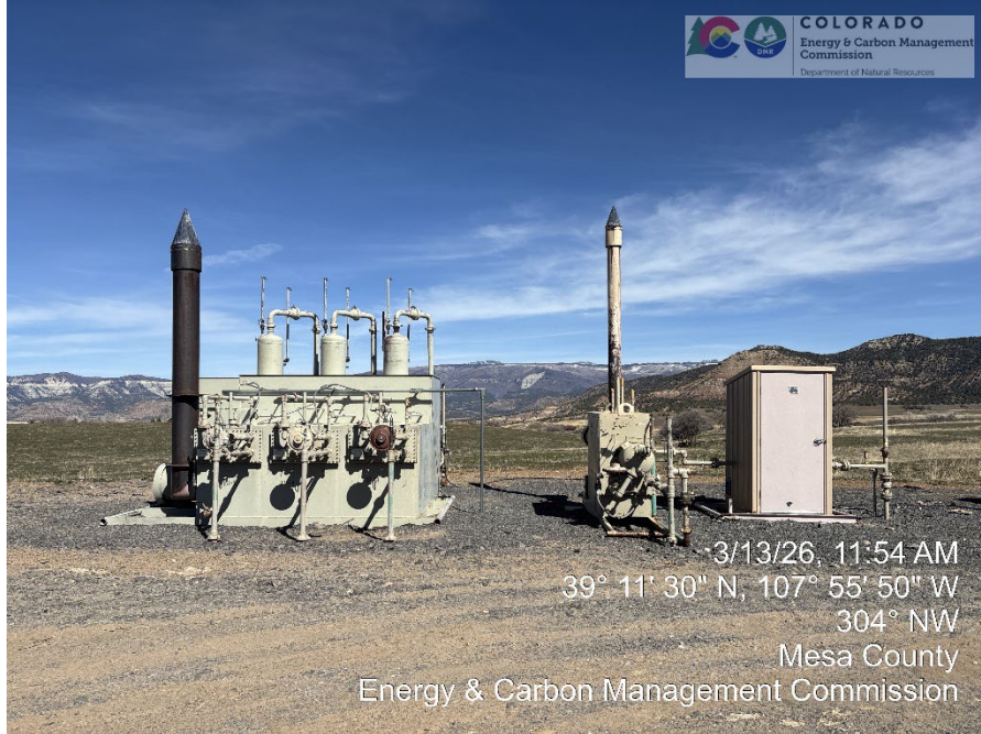
Separators and Meter housing

Inspection Date: 3/13/2026 Inspection Doc#: 693809191