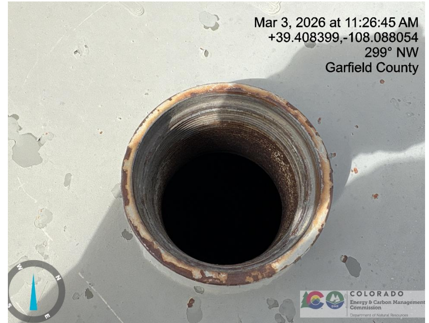
Photo # 4543 Open ended port on production tank/tank open to atmosphere (Additionally open port constitutes a wildlife hazard)