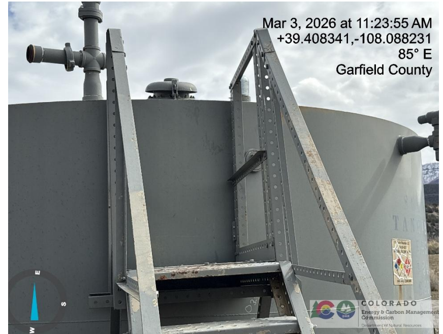
Photo # 4530 Condensate tank with open ended pipe/tank open to atmosphere (Additionally open pipe constitutes a wildlife hazard)

Photo # 4531 Condensate tank with open ended pipe/tank open to atmosphere (Additionally open pipe constitutes a wildlife hazard)