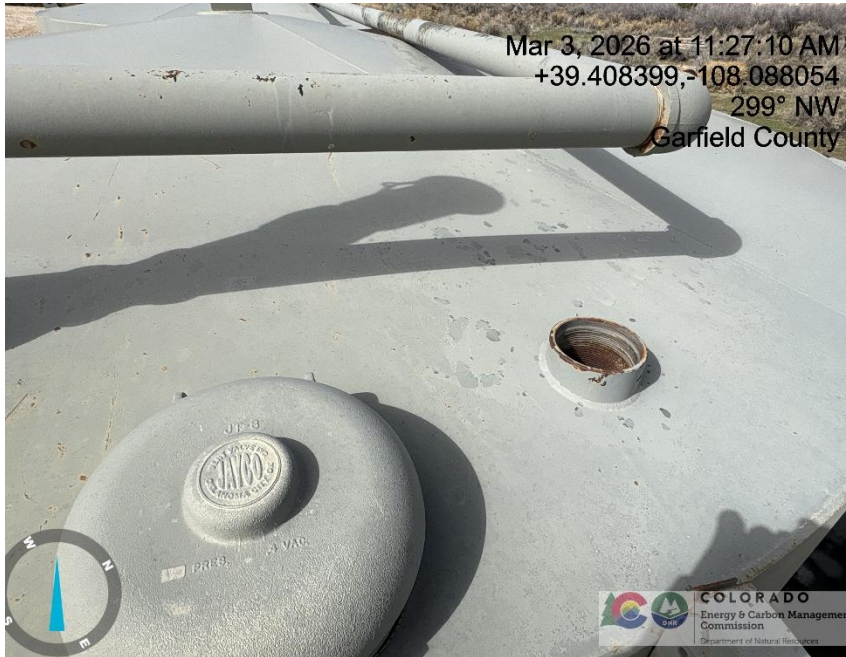
Photo # 4542 Open ended port on production tank/tank open to atmosphere (Additionally open port constitutes a wildlife hazard)