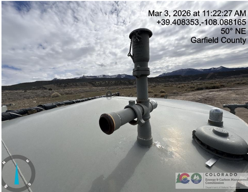
Photo # 4532 Condensate tank with open ended pipe/tank open to atmosphere (Additionally open pipe constitutes a wildlife hazard)