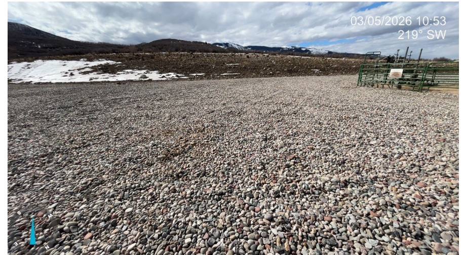
Photo 2: Photos showing an overview of the location looking northeast and southwest, respectively.