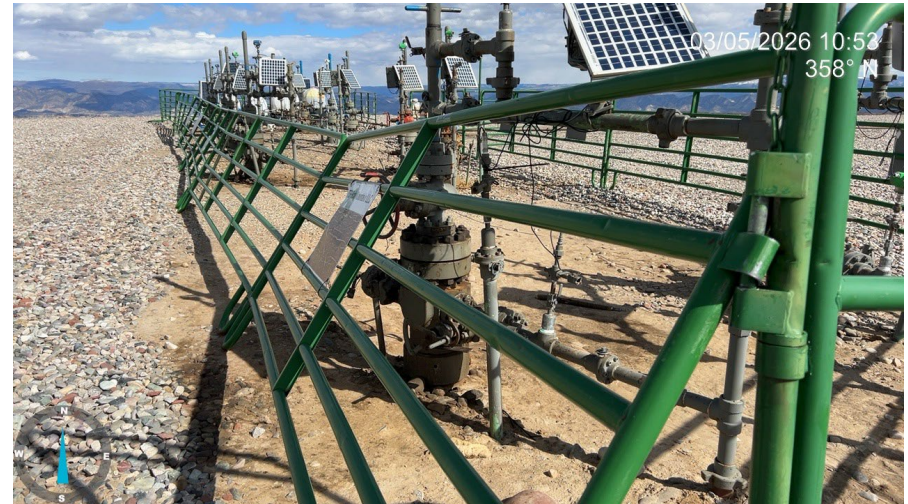
Photo 7: Photos showing panel fencing has fallen against a wellhead at the location; maintenance is recommended.