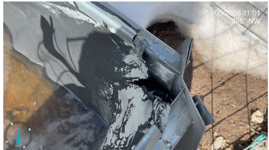
Photo 3: Photos showing examples of rips and tears in the corners of the tank's secondary containment black geotextile liner. Comply with Rule 603.o.