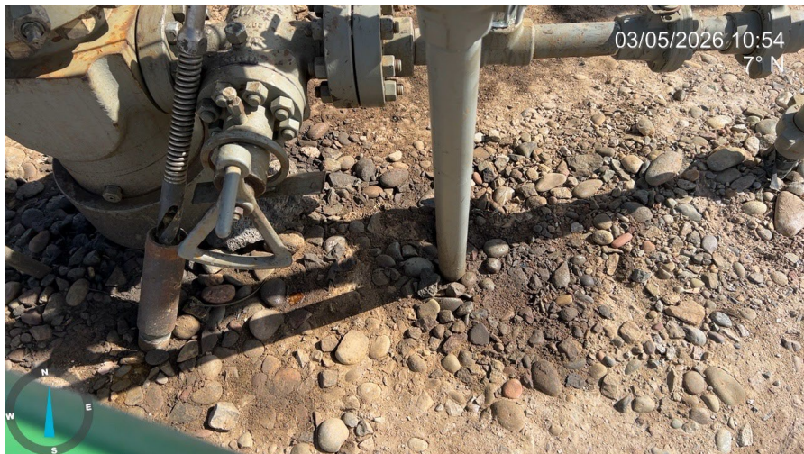
Photo 5: Photos showing examples of stained soils around the base of a wellhead and around the wellhead area; comply with Rule 912.a. and clean up/remove stained soils.