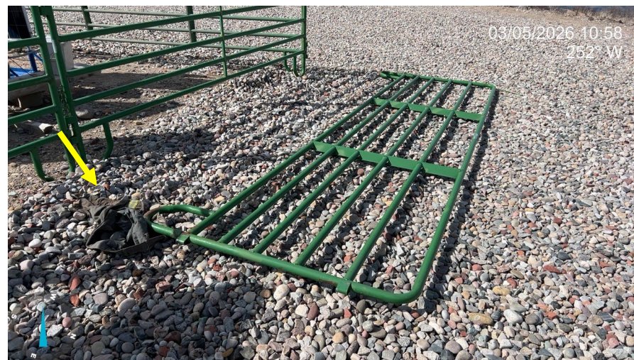
Photo 4: Photos showing trash near the tank's secondary containment system (left), an article of clothing (yellow arrow) and an unused fence panel at the location. Removal is required; comply with Rules 606.d. and 606.a.