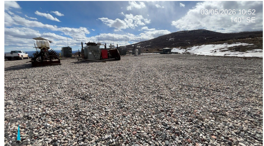
Photo 1: Photos showing an overview of the location looking northwest and southeast, respectively.