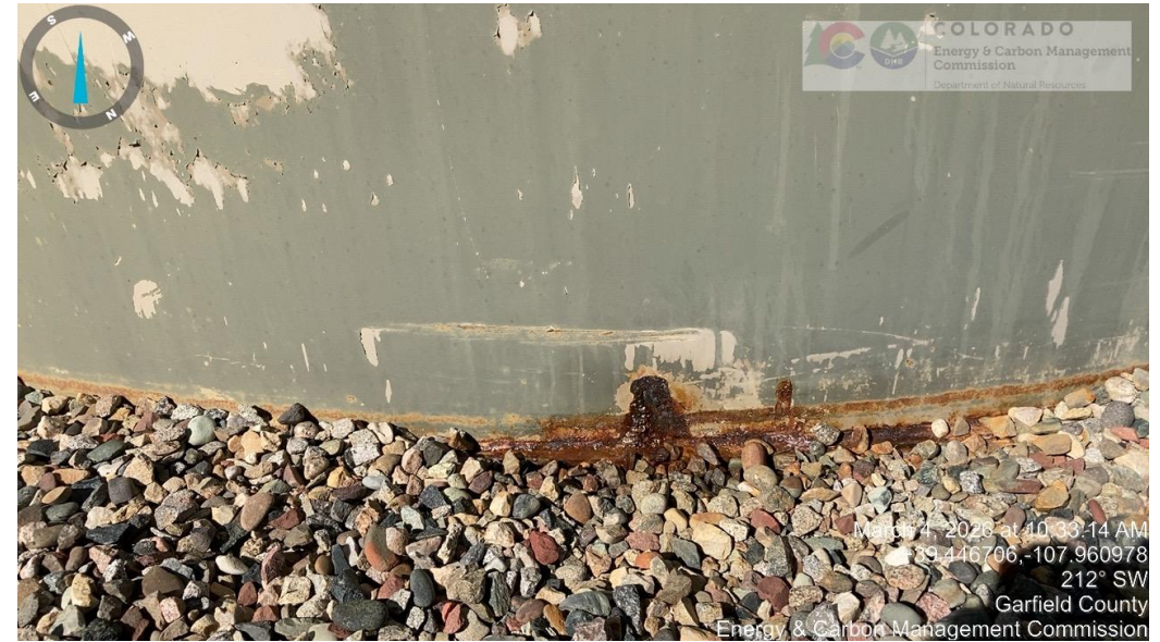
East tank has seep occuring near the bottom of tank.