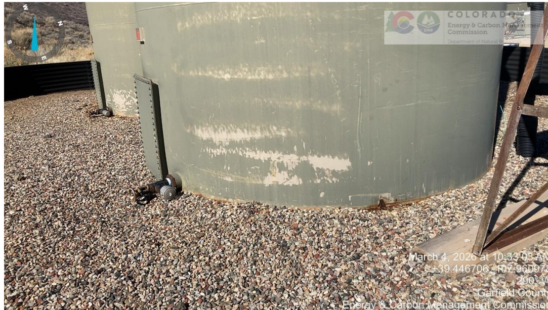
East tank has seep occuring near the bottom of tank.